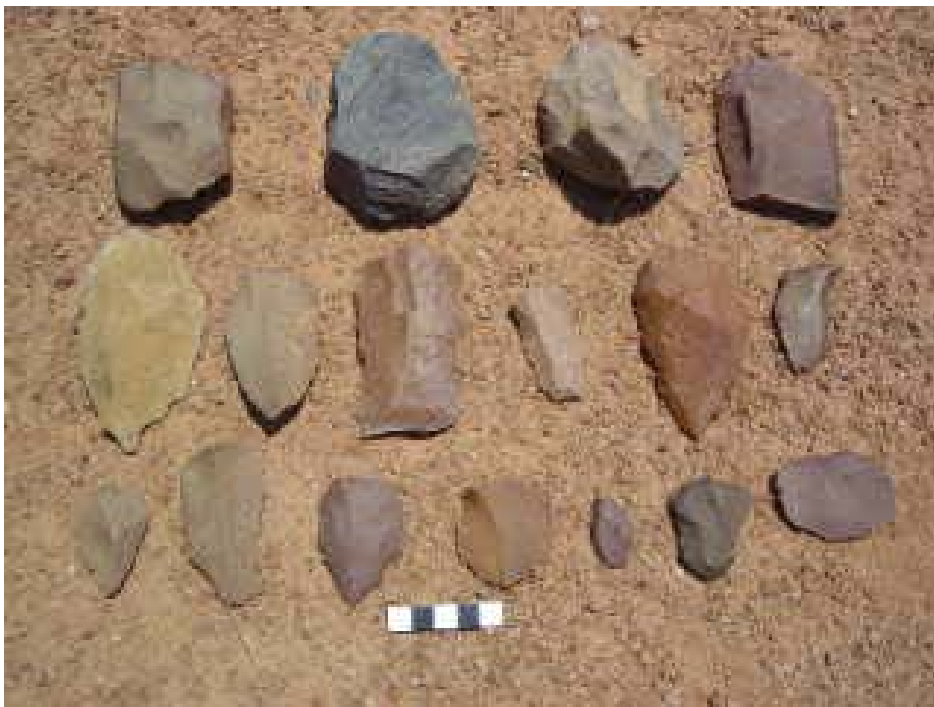
No 2. Middle Stone Age material