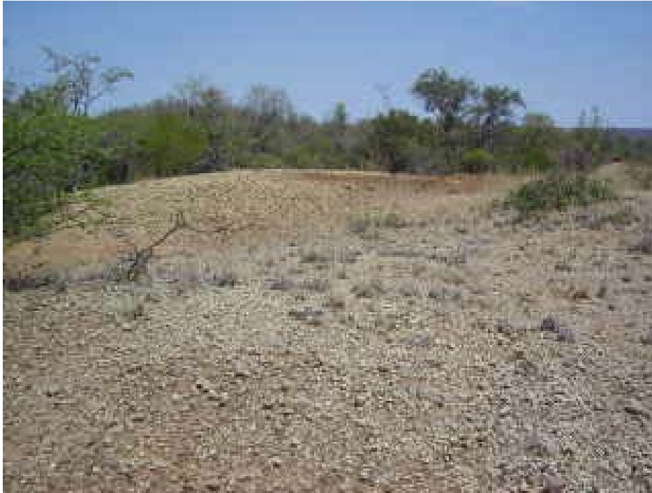
No 1. Eroded area