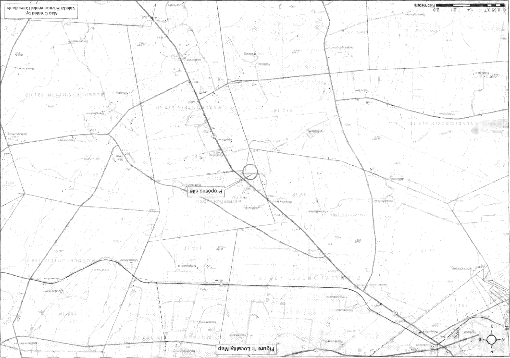
Figure 1: Locality Map

Map Created by: Naledzi Environmental Consultants