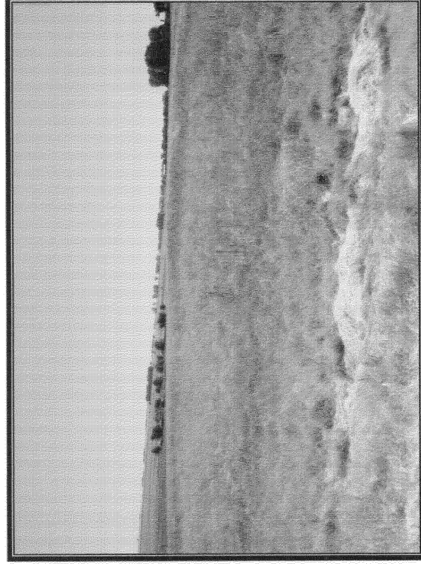
Figure 2: View of the study area from the eastern side.