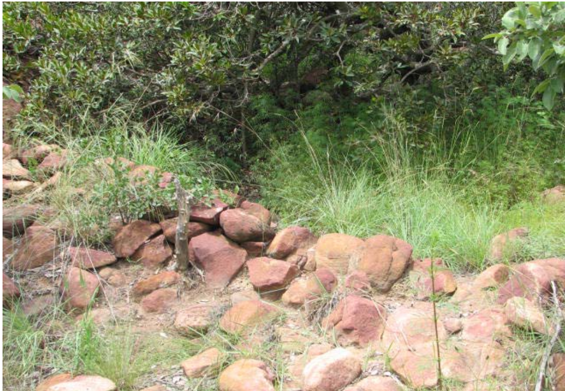
No. 3 Small semi circular stonewall