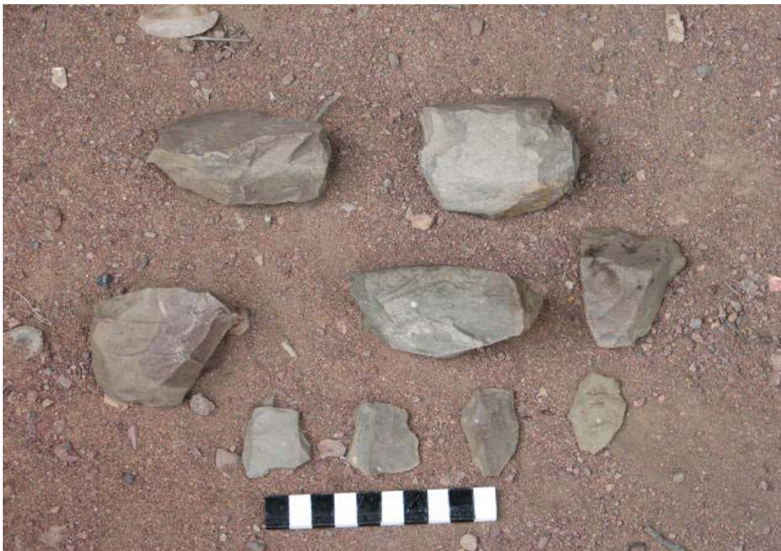
No. 2 Later Stone Age cores and flakes