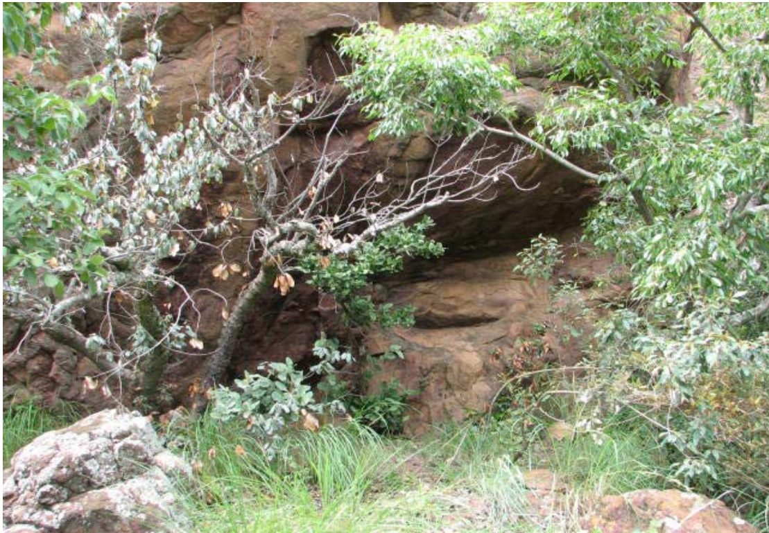
No. 1 Small rock shelter