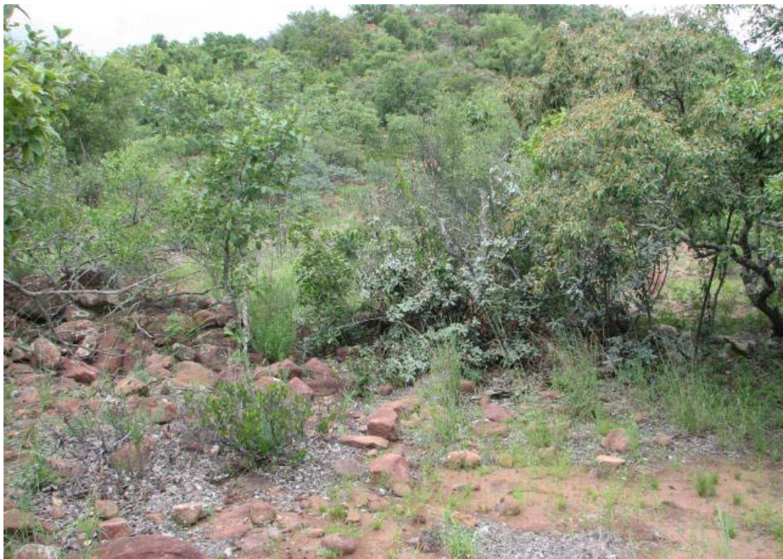
No. 4 Another small semi circular stonewall