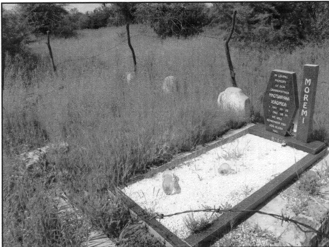
Fig. 4. Four graves in a small cemetery.

Legal requirements : Permits, SAHRA permits, police, notification, consultation, relocation