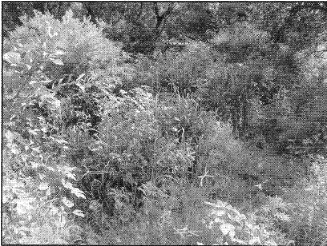
Fig. 3. The two densely overgrown graves.

Legal requirements : Permits, SAHRA permits, police, notification, consultation, relocation