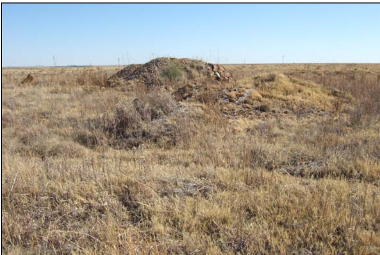
Fig.16 Old diggings, Syferfontein 2HP, Wolmaransstad.