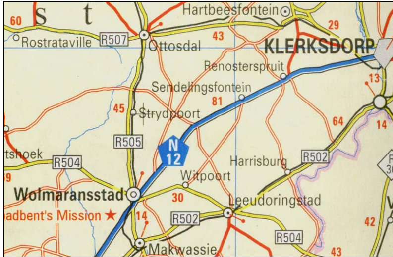
Map 1 The N12 road between Wolmaransstad and Klerksdorp, North West Province.