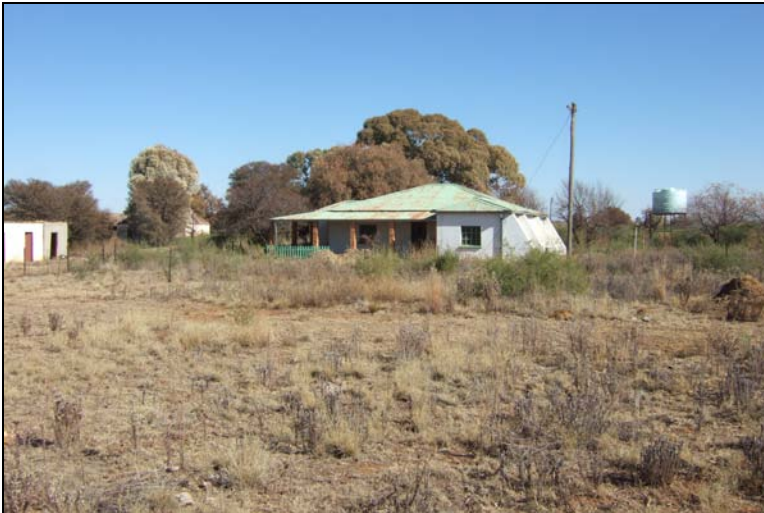
Fig.23 An old farm house at point R4, at Syferfontein 2HP, Wolmaransstad.