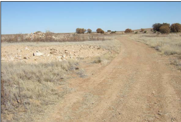
Fig.18 Old rehabilitated diggings at Syferfontein 2HP, Wolmaransstad.