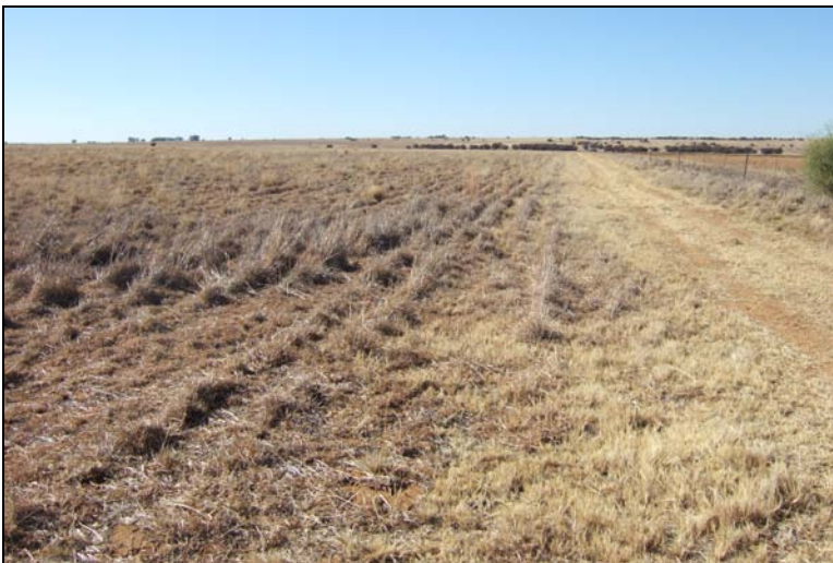
Fig.14 Old plough lands with cultivated grazing, Syferfontein 2HP, Wolmaransstad.