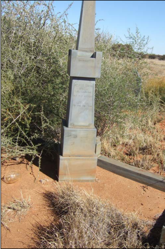
Fig.11 Graveyard 1 (GY), Syferfontein 2HP, Wolmaransstad.