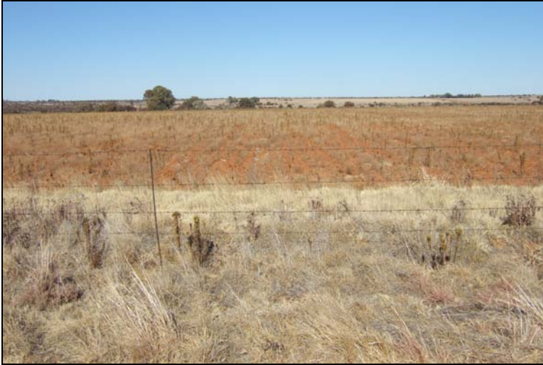
Fig.15 Old plough lands, Syferfontein 2HP, Wolmaransstad.