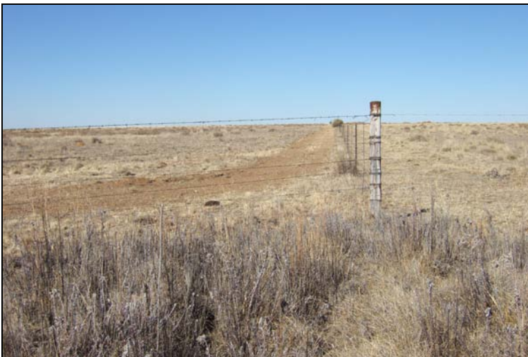
Fig.8 Point H, Syferfontein 2HP, Wolmaransstad.