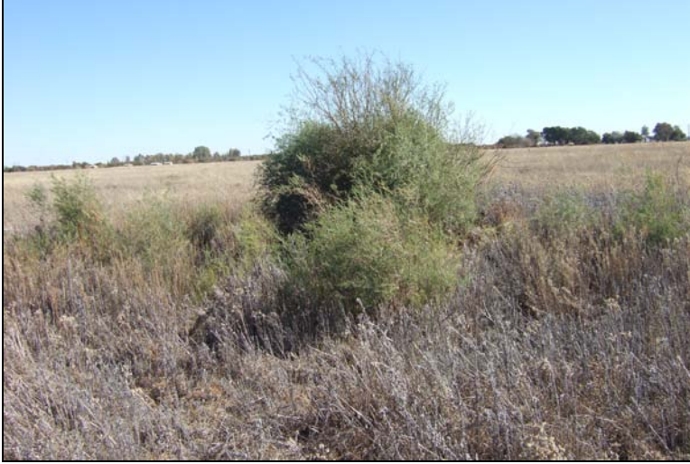
Fig.13 Graveyard 3, Syferfontein 2HP, Wolmaransstad.