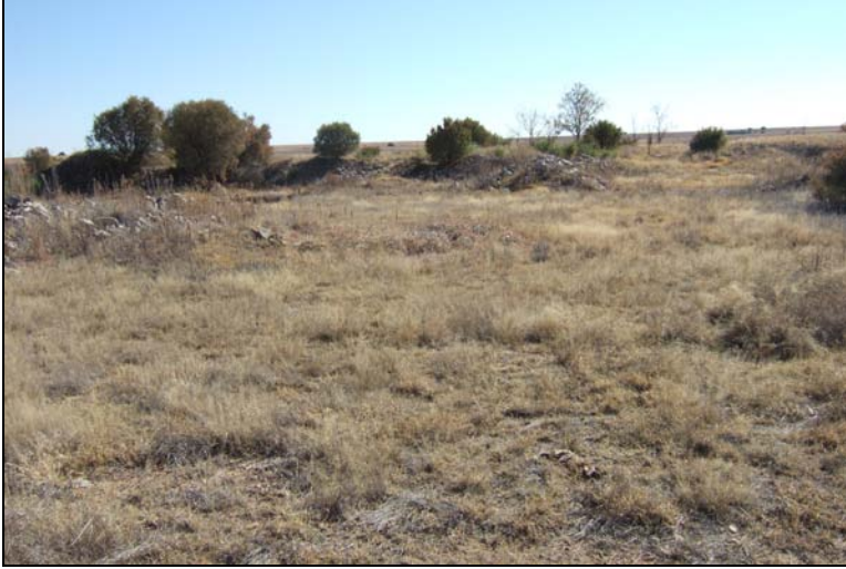
Fig.9 Point J, Syferfontein 2HP, Wolmaransstad.