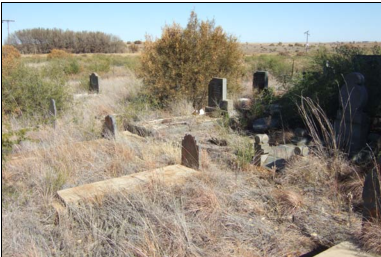
Fig.12 Graveyard 2, Syferfontein 2HP, Wolmaransstad, consisting of about 45 graves.