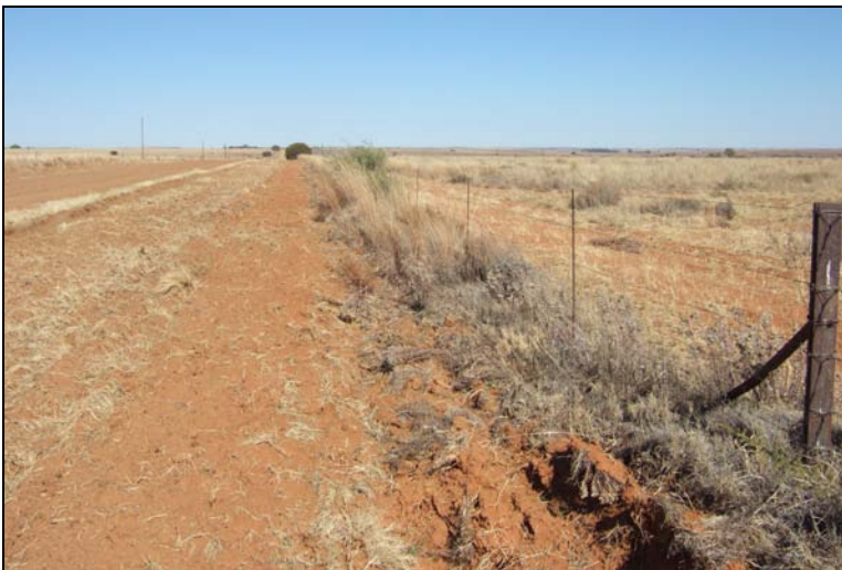
Fig.6 Point F at Syferfontein 2HP, Wolmaransstad.