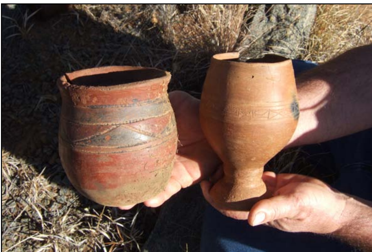
Fig.24 Traditional Batswana clay pots placed as decoration on one of the graves. Graveyard 2, Syferfontein 2HP, Wolmaransstad.