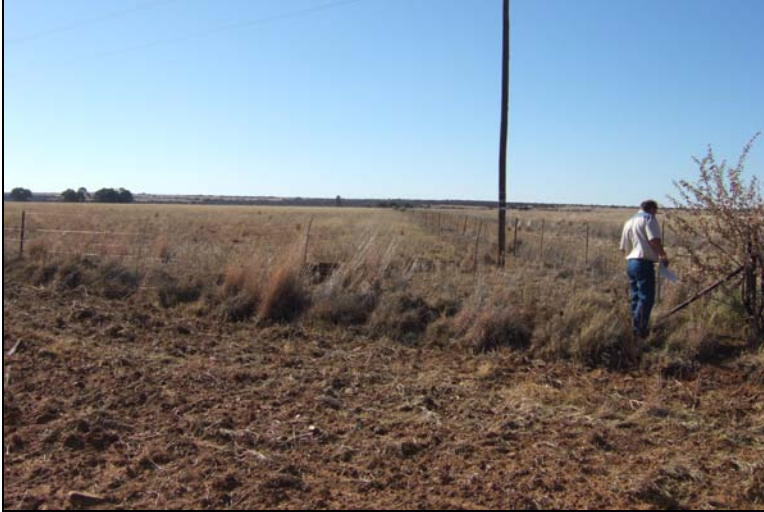
Fig.3 Point C at Syferfontein 2HP, Wolmaransstad.