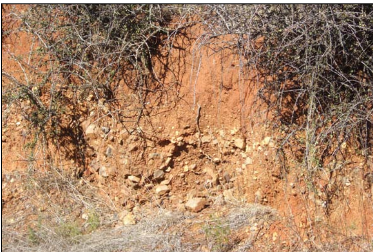
Fig.20 Soil deposit in old diggings at Syferfontein 2HP, Wolmaransstad.