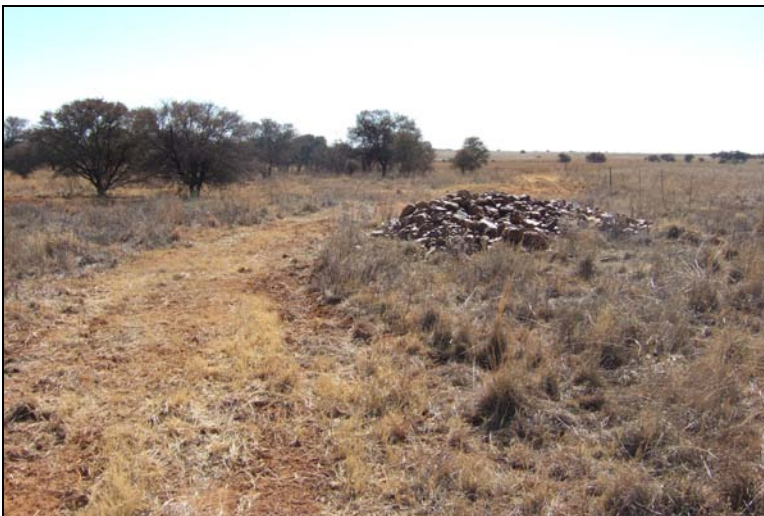
Fig.10 Point K, Syferfontein 2HP, Wolmaransstad.