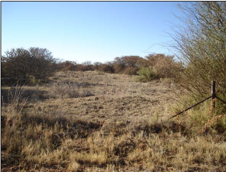
Fig.2 Point B at Syferfontein 2HP, Wolmaransstad.