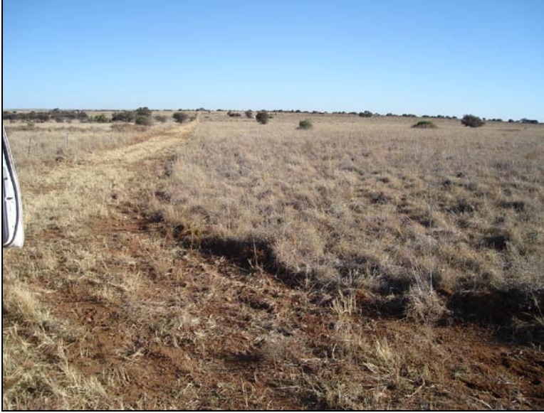
Fig.1 Point A at Syferfontein 2HP, Wolmaransstad.