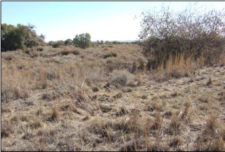
Fig.21 Old SAP diggings at Syferfontein 2HP, Wolmaransstad.