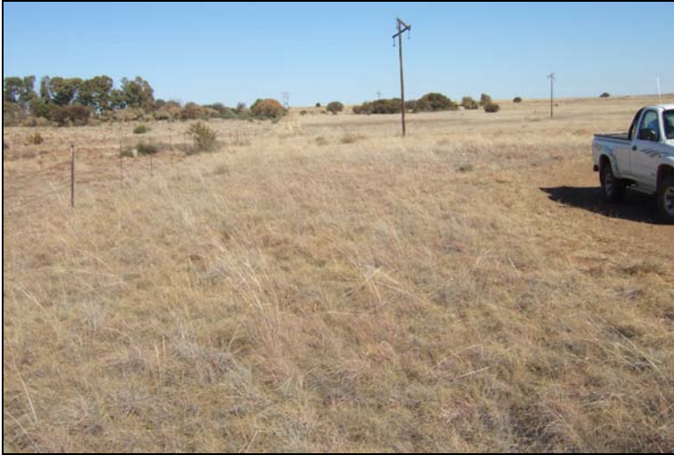
Fig.5 Point E at Syferfontein 2HP, Wolmaransstad.