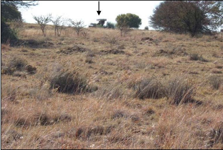
Fig.17 Old diggings at Syferfontein 2HP, Wolmaransstad. Note the sorting machine in the centre.