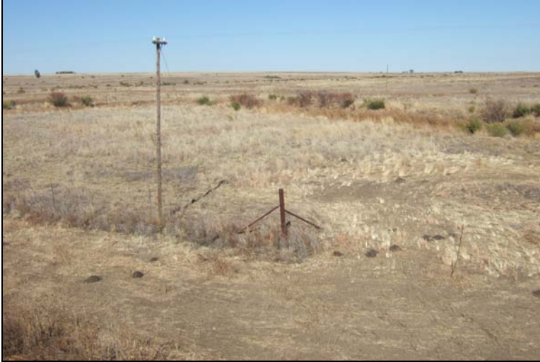
Fig.7 Point G, Syferfontein 2HP, Wolmaransstad. Flow of Makwassie Spruit indicated by the row of bushes.