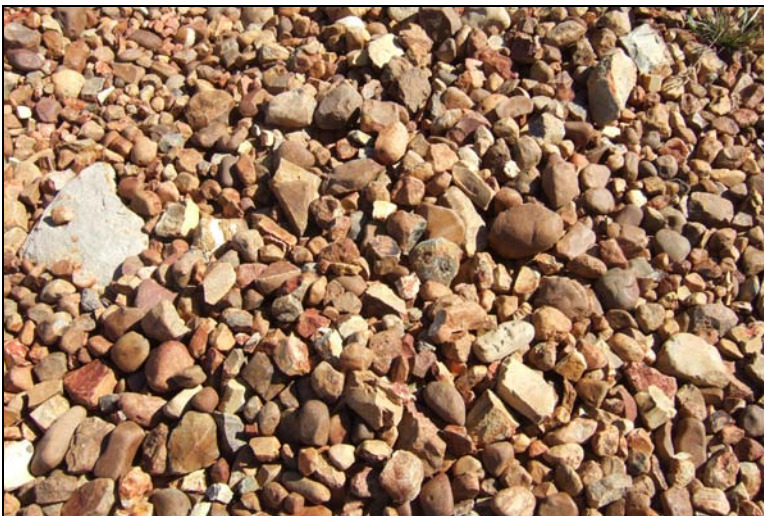
Fig.22 Pebbles at the old diggings, Syferfontein 2HP, Wolmaransstad.