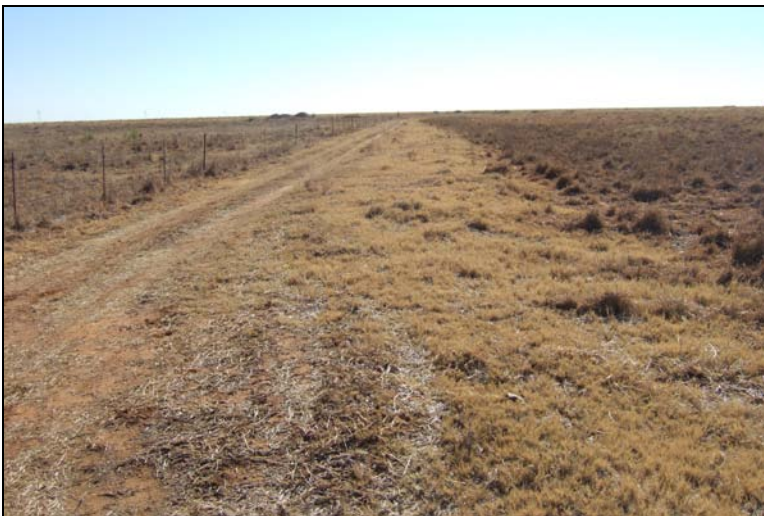
Fig.4 Point D at Syferfontein 2HP, Wolmaransstad.