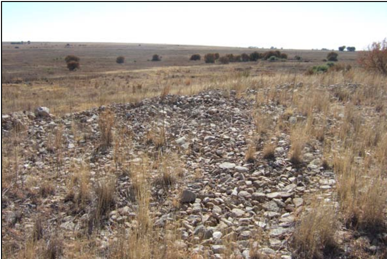
Fig.19 Old rehabilitated diggings at Syferfontein 2HP, Wolmaransstad.