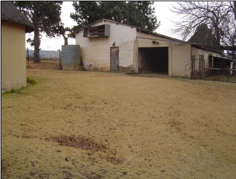
Fig.3 Existing outbuildings will become part of the new developments.