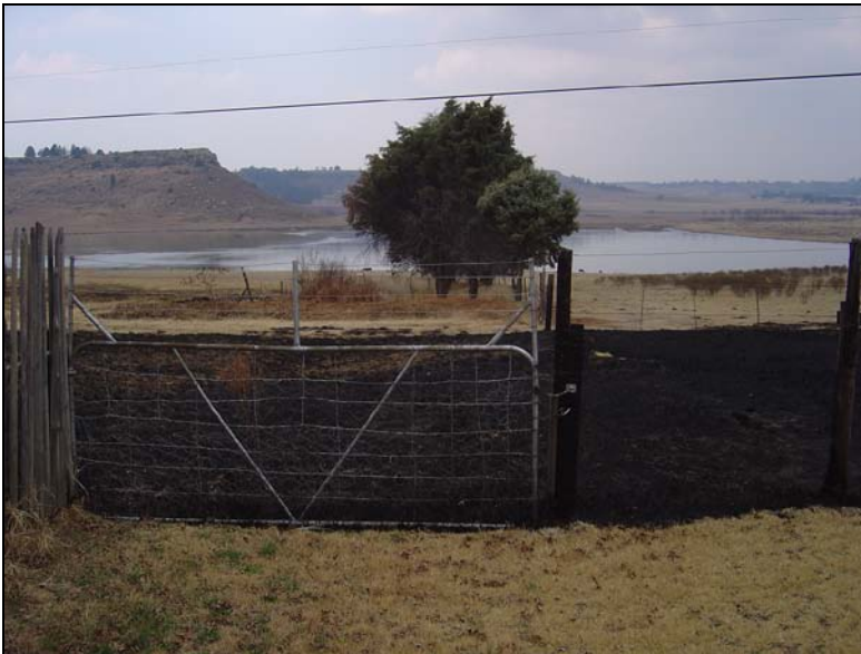
Fig.1 View from Rendezvous towards the Saulspoort Dam.