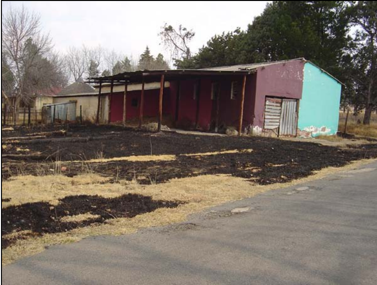
Fig.4 More outbuildings will be developed.