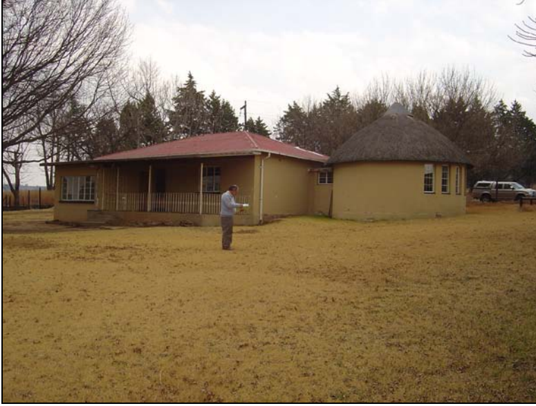
Fig.2 Existing buildings at the site will be incorporated in the new developments.