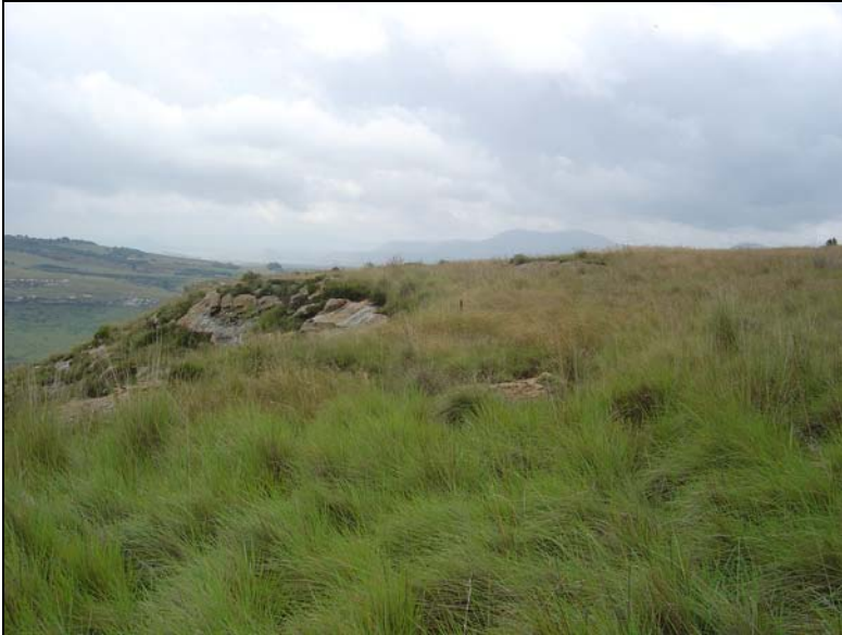
Fig.1 View of the development area at Damascus 24, Clarens.