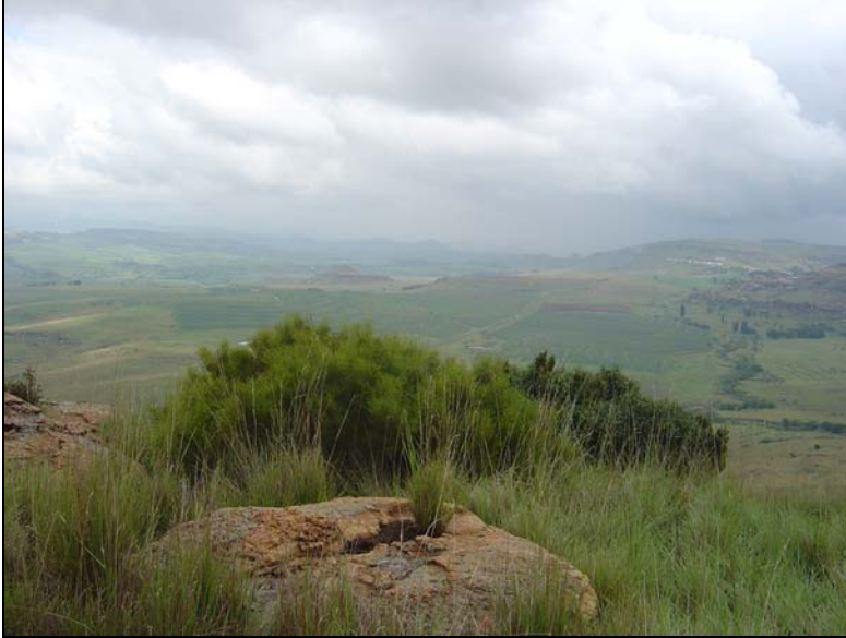
Fig.5 View from the development area at Damascus 24, Clarens.