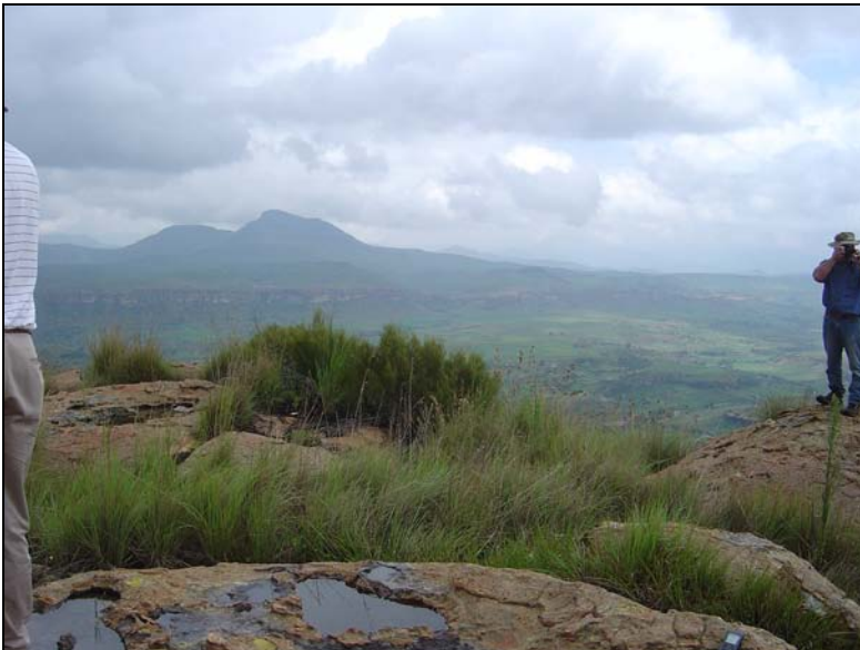
Fig.4 View from the development area at Damascus 24, Clarens.