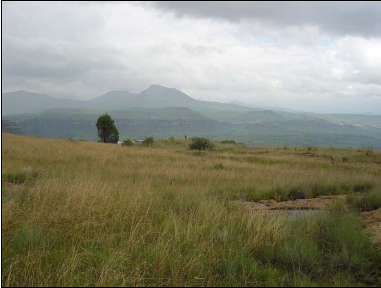
Fig.3 The development area on the farm Damascus 24, Clarens.