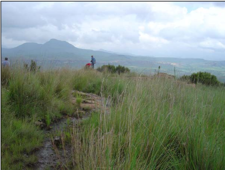
Fig.2 View of the development area at Damascus 24, Clarens.