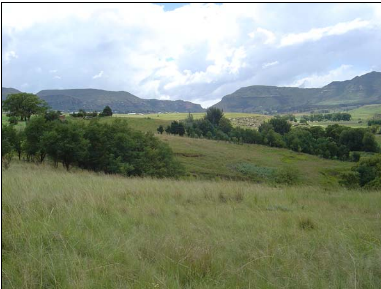
Fig.9 View on Stand 1.