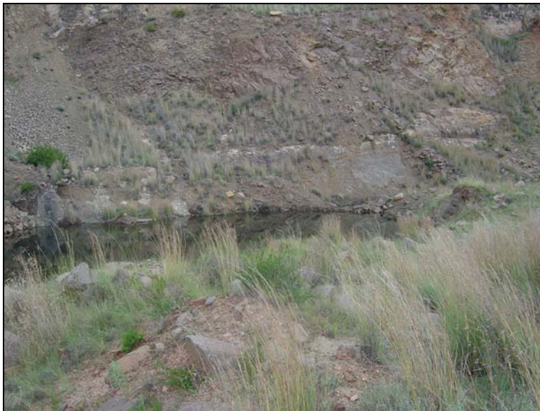
Fig.1 View of the quarry at Pietersdal 1207, Clarens.