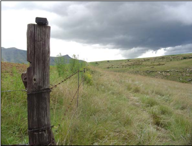
Fig.7 Corner of Stand 4 facing north.