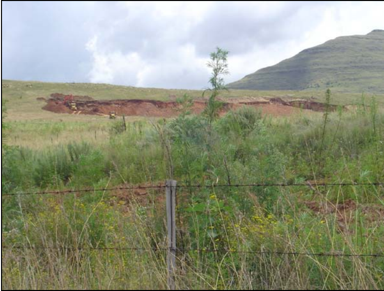
Fig.2 View at the quarry at Pietersdal.