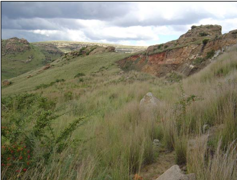
Fig.3 View of the quarry from Stand 9.