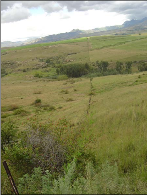
Fig.4 View from Stand 9 facing down slope in easterly direction across Stands 9-7.