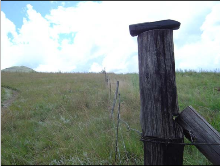
Fig.8 Corner of Stand 4 facing west.