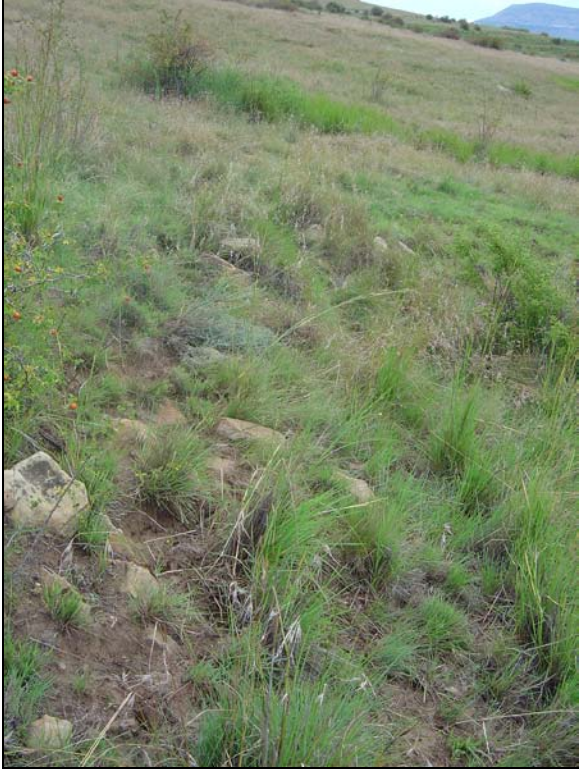
Fig.6 Robbed stone-walls at Pietersdal, Clarens.