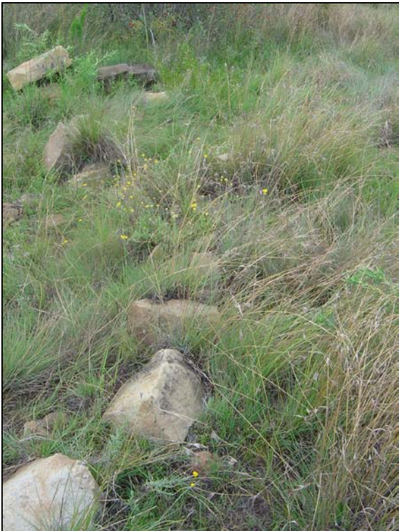
Fig.5 Remains of stone-walls at Pietersdal, Clarens.