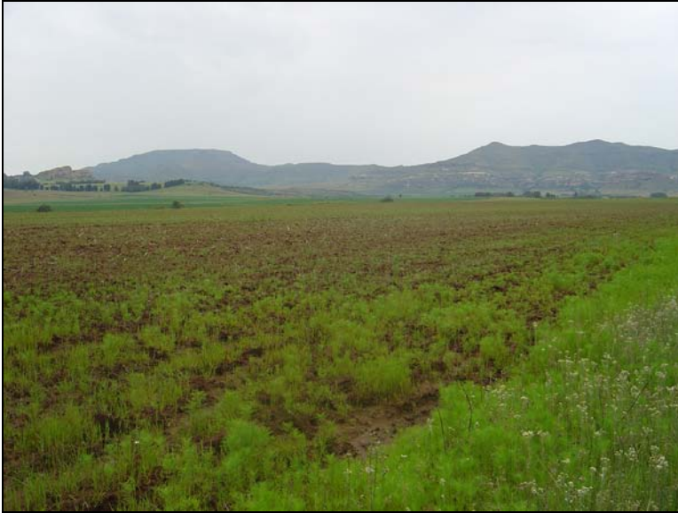
Fig.3 View of the proposed residential area at Ararat 916, Clarens, facing east.