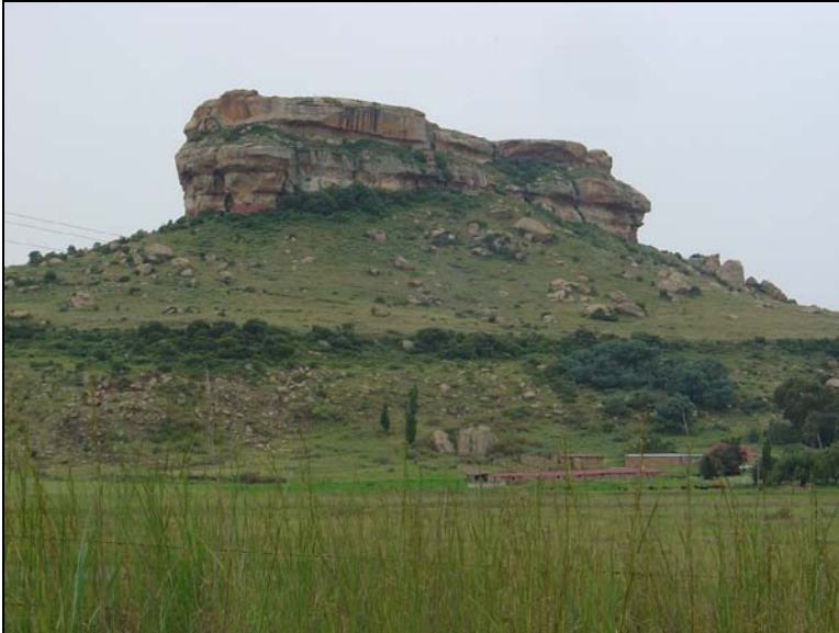
Fig.1 View of Ararat or Node's Koppie on the northern border of the farm Ararat 916, Clarens.