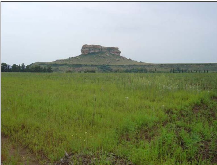
Fig.2 View of the plough lands proposed for residential development facing north.