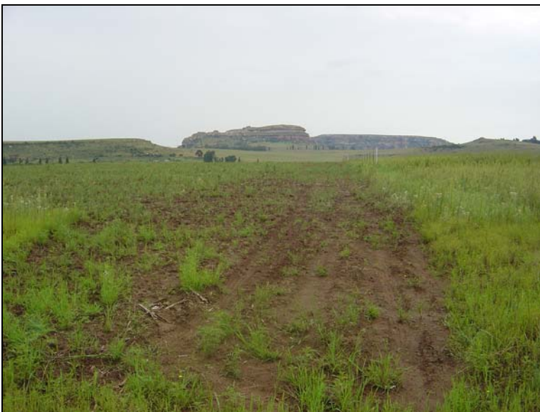
Fig.4 Plough lands at Ararat 916, Clarens, proposed for residential developments.