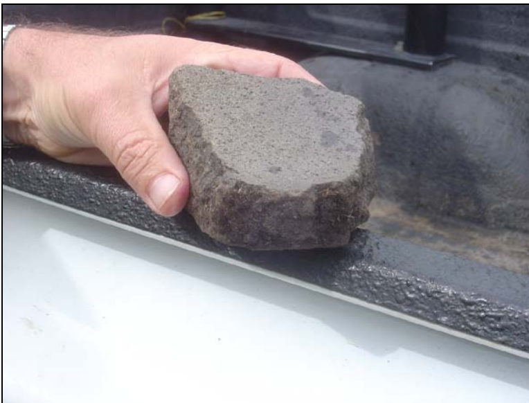
Fig.6 Part of a lower grinding stone from the site.