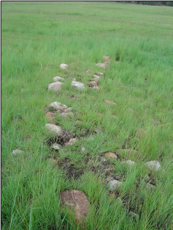
Fig.3 Base of another stone wall at site on Elim, Clarens.