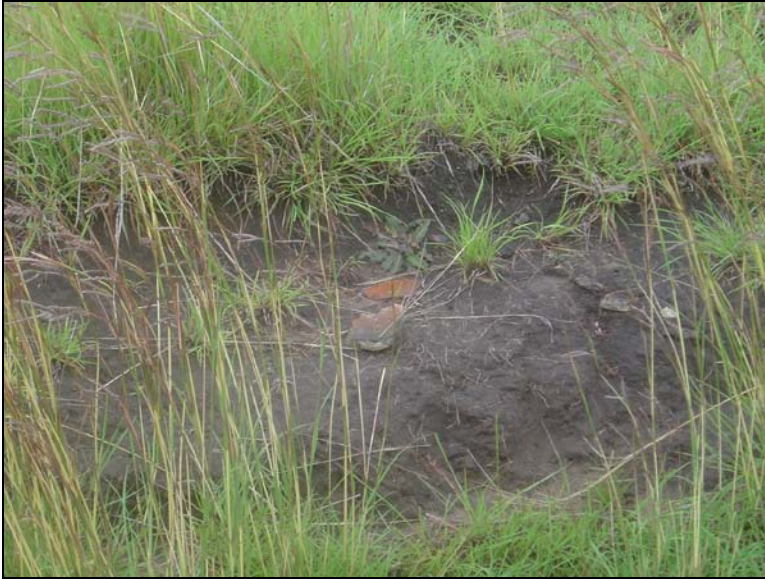
Fig.7 Potsherds on the ash heap near the stone walls at Elim.