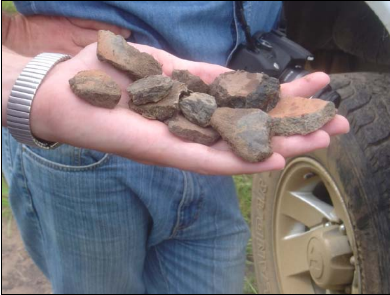
Fig.5 Potsherd from the stone-walled site at Elim, Clarens.