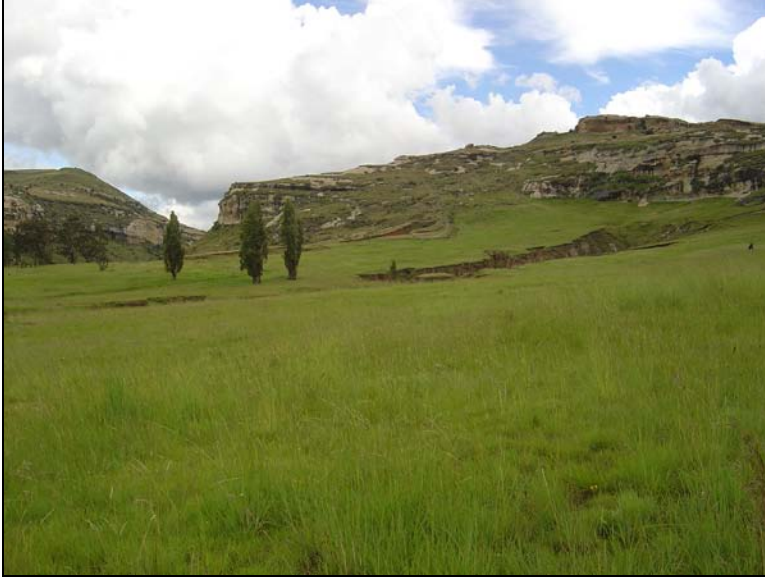
Fig.11 Eastern limit of the site at Elim 1853, Clarens, facing south towards the poort.