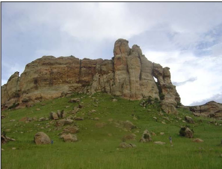
Fig.10 View of the sandstone cliffs above the site.