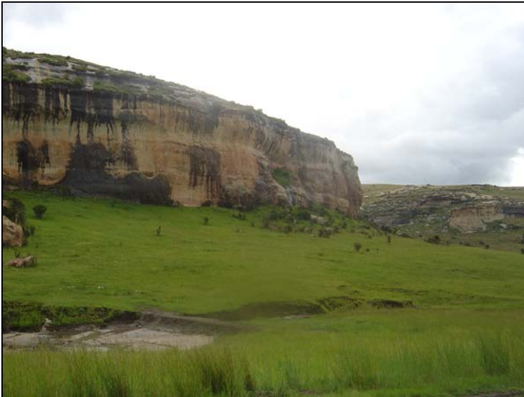
Fig.12 Western limit of the site at Elim 1853, Clarens.