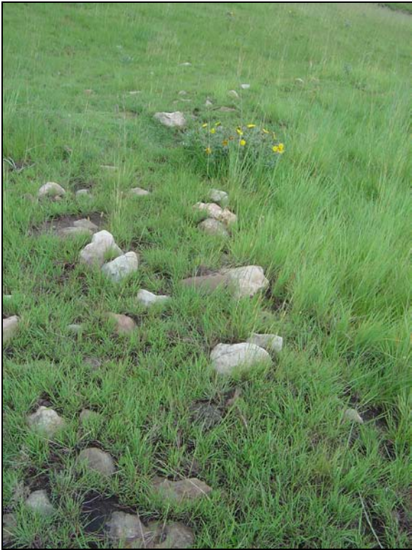
Fig.1 Remains of a stone wall on the eastern side of the site at Elim, Clarens.