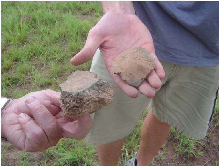
Fig.8 Potsherd from the ash heap at Elim, Clarens.