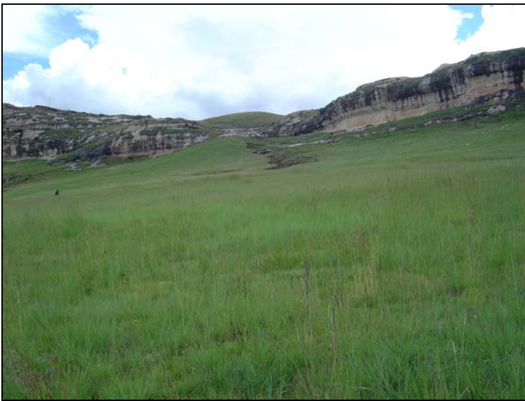
Fig.2 View of the grass land on th farm Elim, Clarens.