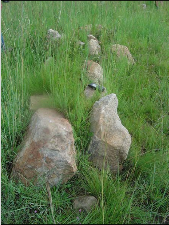
Fig.9 Stone wall remains at the site at Elim.