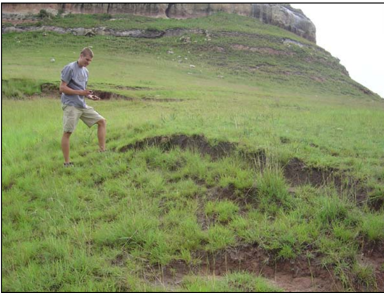
Fig.4 Ash heap near the stone walls at Elim.