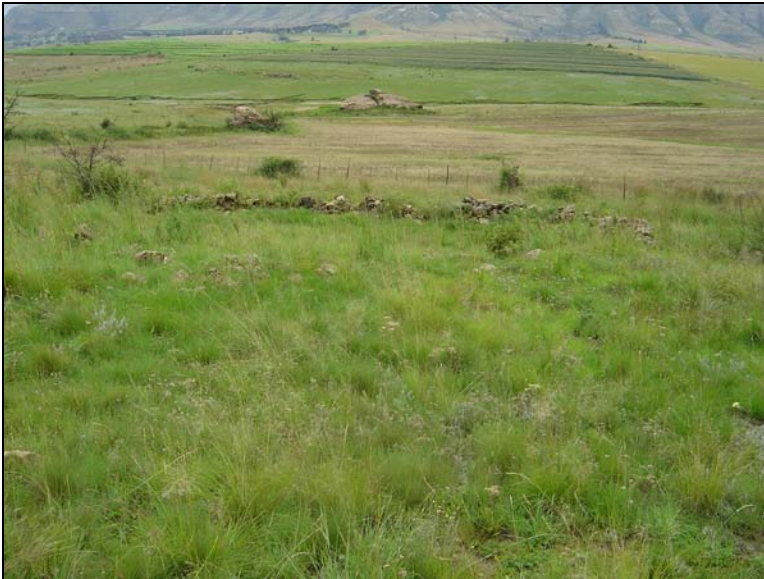
Fig.4 Elliptical stone-walled structure.