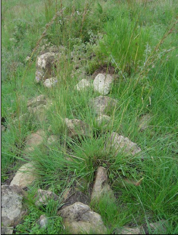
Fig.2 Base of a stone-wall at Clifton.