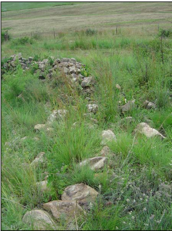
Fig.5 More stone-walls at Clifton, Clarens.