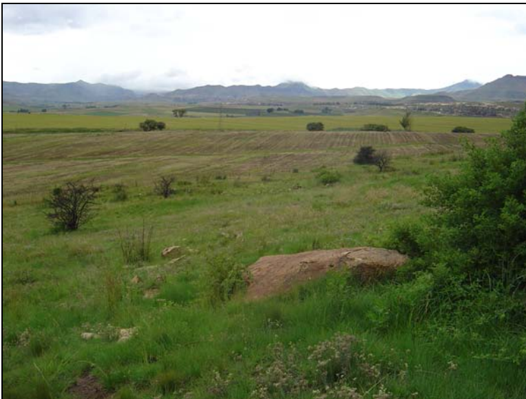
Fig.3 Ash heap near the stone-wall at Clifton.