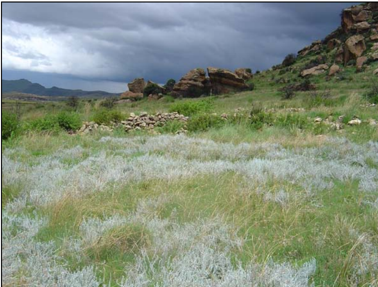
Fig.1 View of the stone enclosure wall at Clifton 530, Clarens, facing south.