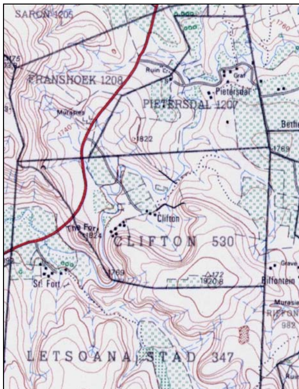
Map 2 Locality of Clifton 530, south of Clarens (2828CB).