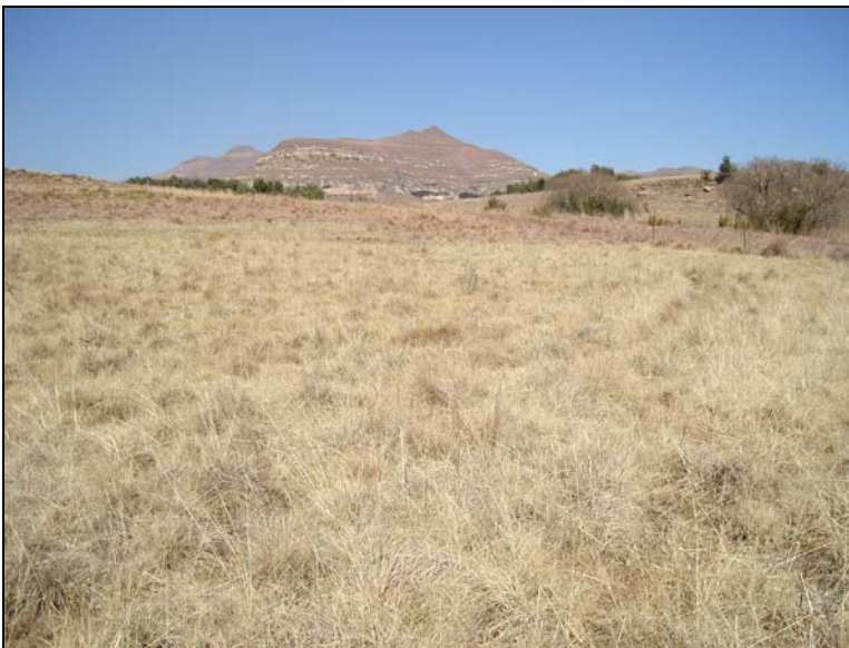
Fig.4 General view of the site at Groenland 267, Clarens.