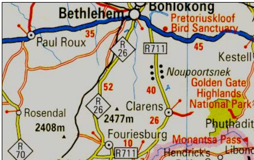
Map 1 Locality of Clarens in relation to Fouriesburg, Bethlehem and Golden Gate.