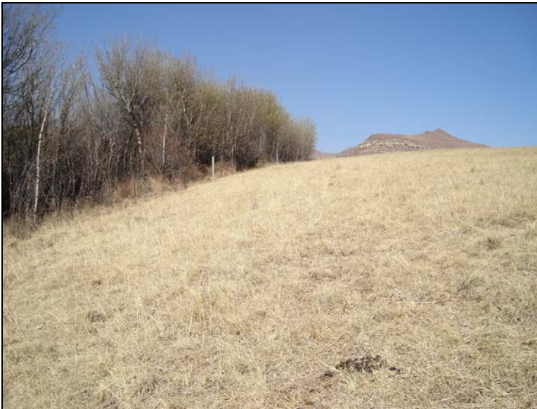
Fig.6 Northern limit of the land facing east.