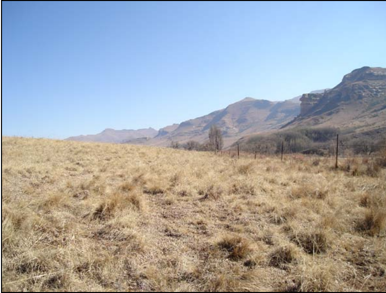
Fig.5 View along the eastern border of the proposed development at Groenland 267.