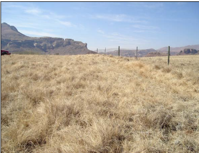
Fig.2 View of the site at Groenland 267 facing east.