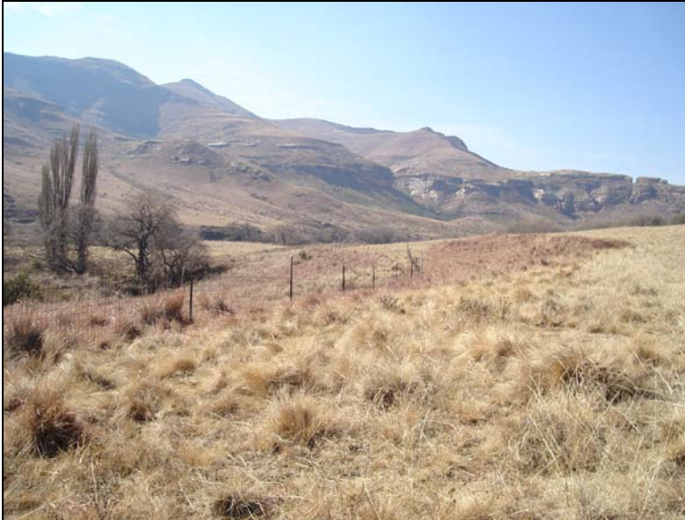
Fig.3 View along the river facing east.