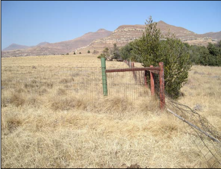
Fig.1 View along the southern border of the area of development at Groenland 267.