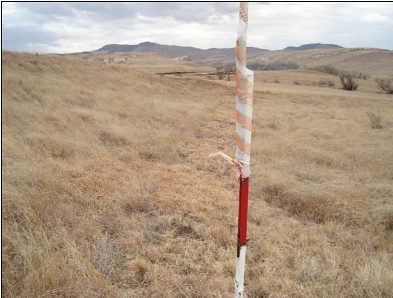
Fig.4 View from the eastern corner of the proposed site at Craig Rossie, Clarens.