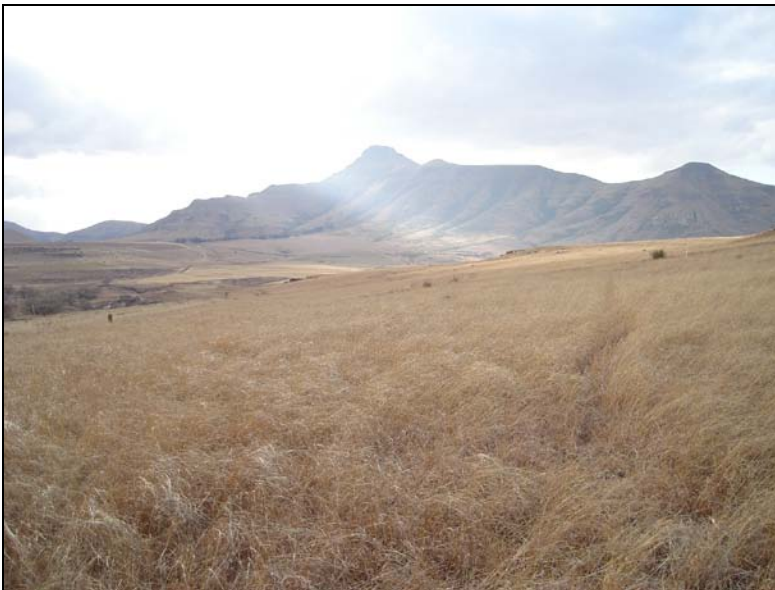
Fig.8 View from Craig Rossie towards Clarens across the area of development.