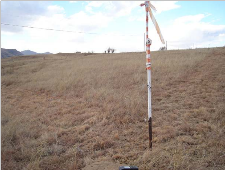
Fig.2 View from the south western corner of the proposed area of development.