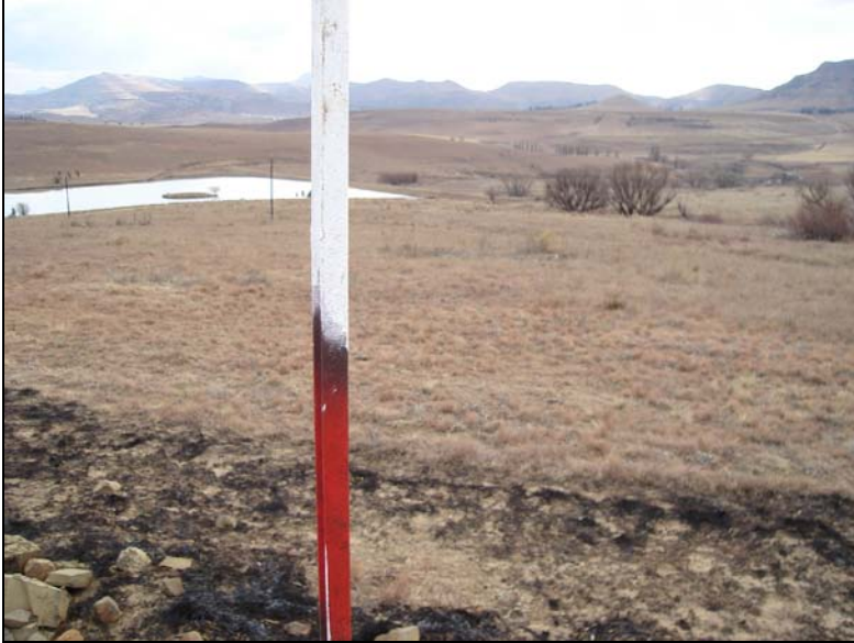
Fig.1 View at the entrance road to Graig Rossie 1422, facing towards Clarens.