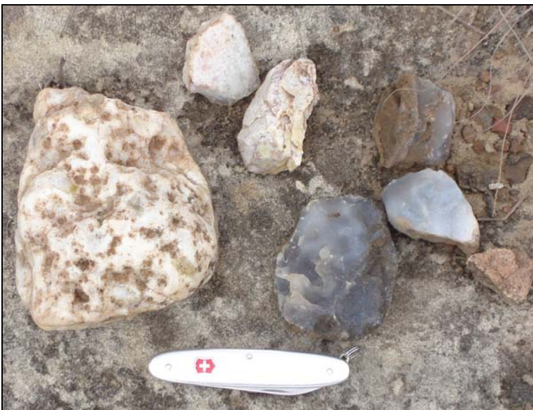
Fig.6 Lithic material at Craig Rossie, near Clarens.