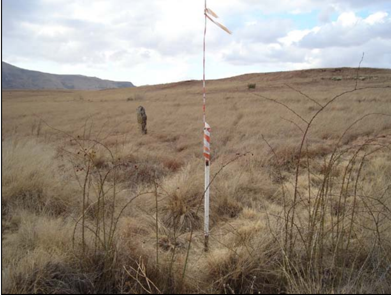
Fig.3 View from the north western corner of the proposed development at Craig Rossie.