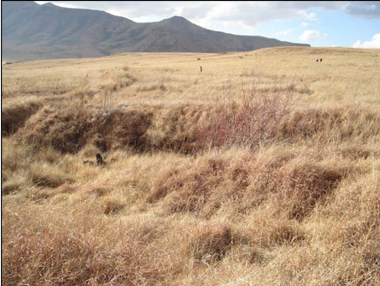
Fig.7 Contour and old road visible in the proposed area of development.