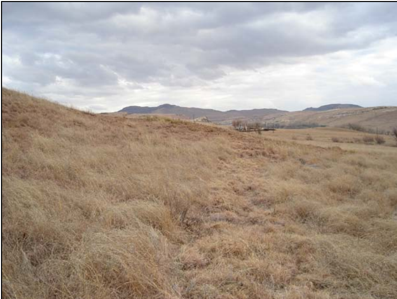
Fig.5 The hill on the eastern border of the site.