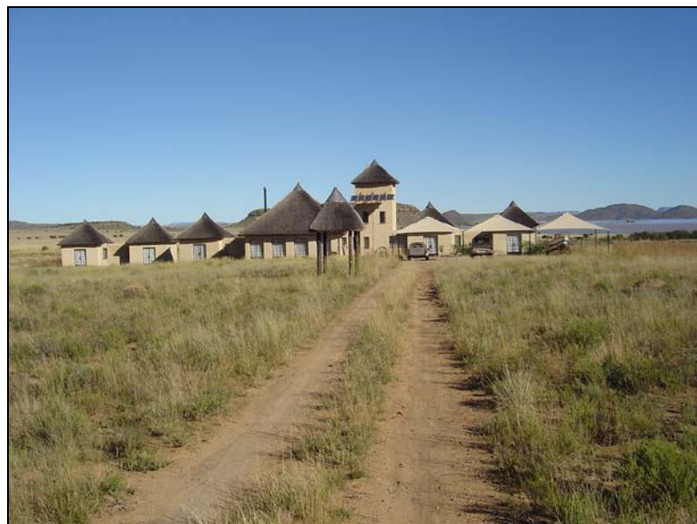
Fig.1 Raptor Ridge Bed & Breakfast fascility at Hestershoek 356, Bethulie.