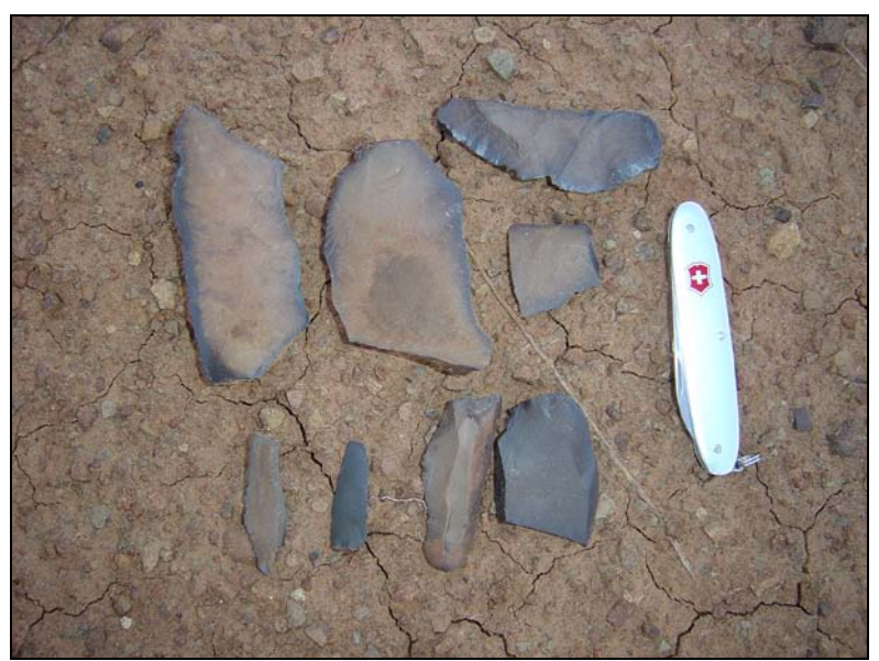
Fig.4 Patinated stone flakes from the area around the chalets, Hestershoek. (Pocket knife = 83mm).