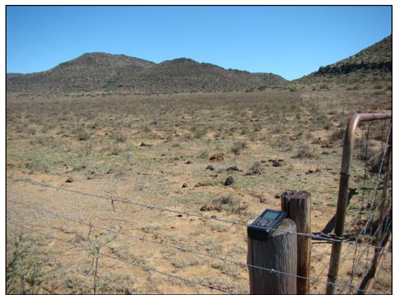
Fig.3 Point B at Bosduifkloof 522, along the R701 near Bethulie (See Map 2).