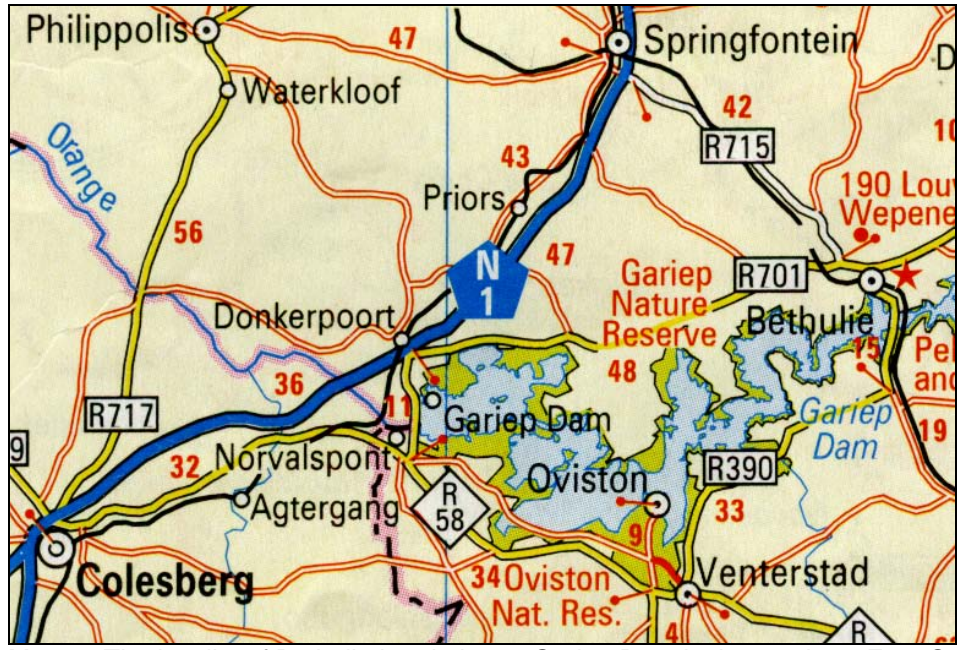
Map 1 The locality of Bethulie in relation to Gariep Dam in the southern Free State.