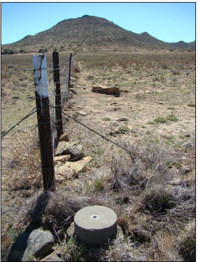
Fig.2 Point A (HHK/BDK) at Bosduifkloof 522, along the R701 near Bethulie (See Map 2).