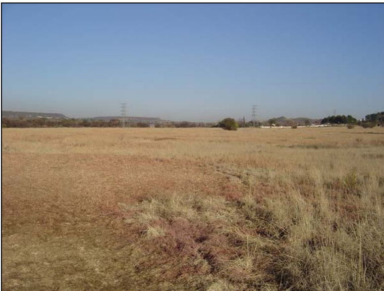
Fig.4 The soil surface is grass covered and without any traces of cultural material.