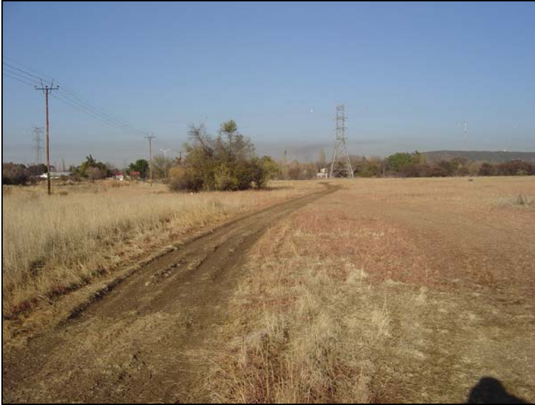
Fig.3 General view facing south towards Andries Pretorius Road.