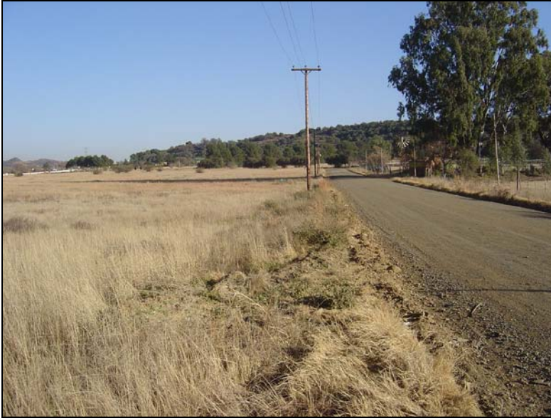
Fig.5 Facing west towards the hill.