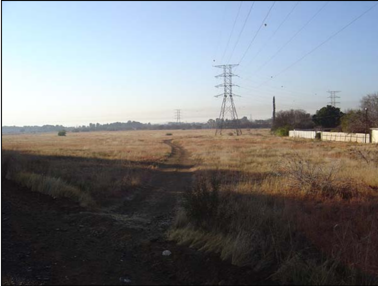
Fig.1 Roderick's Park 2834 on the outskirts of Bloemfontein facing south east.