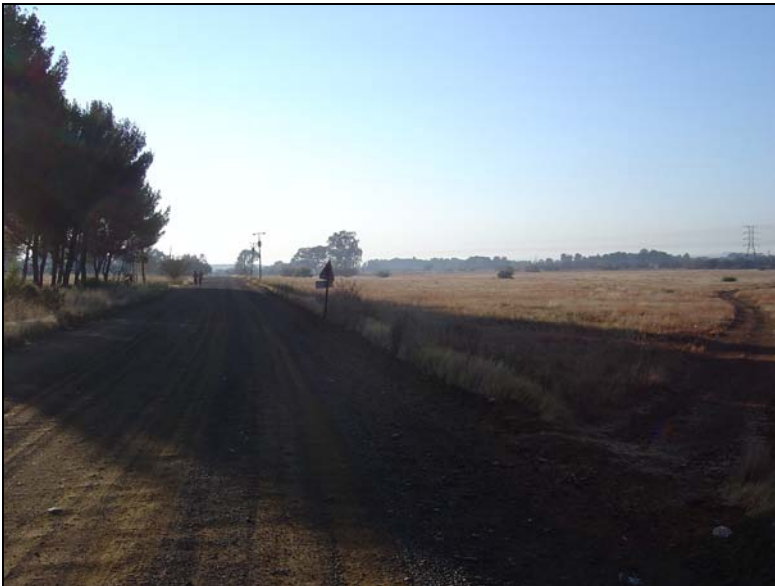
Fig.2 A general view of the area facing east.