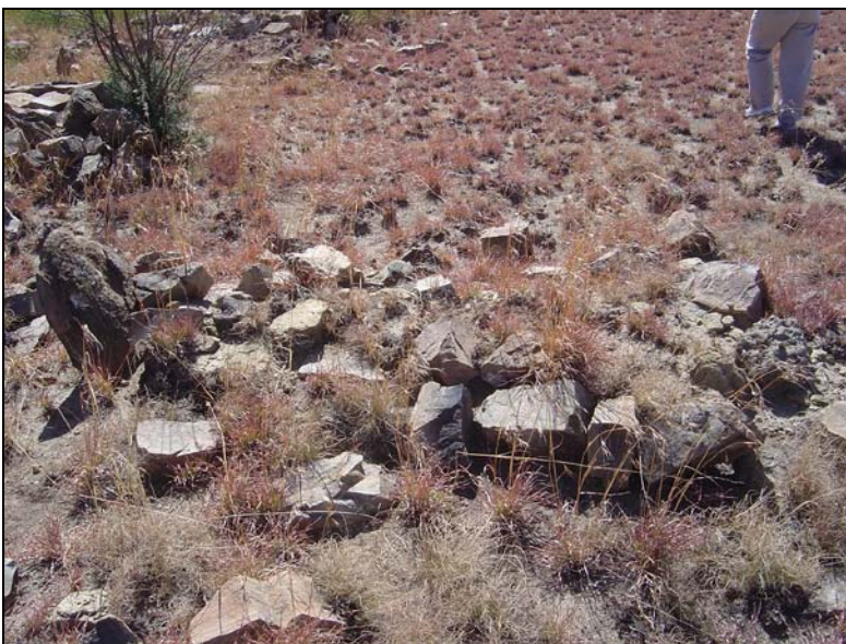
Fig.14 Grave covered with natural stones from the hill.