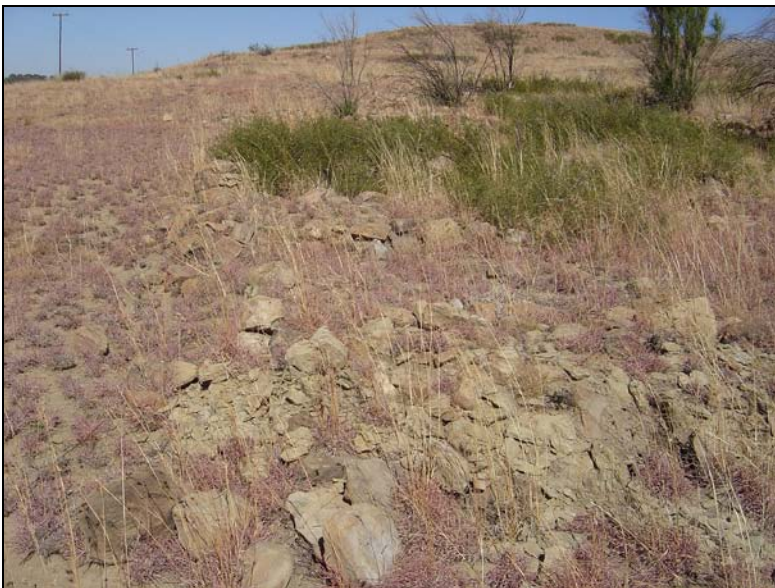
Fig.13 More graves at the site below the hill.