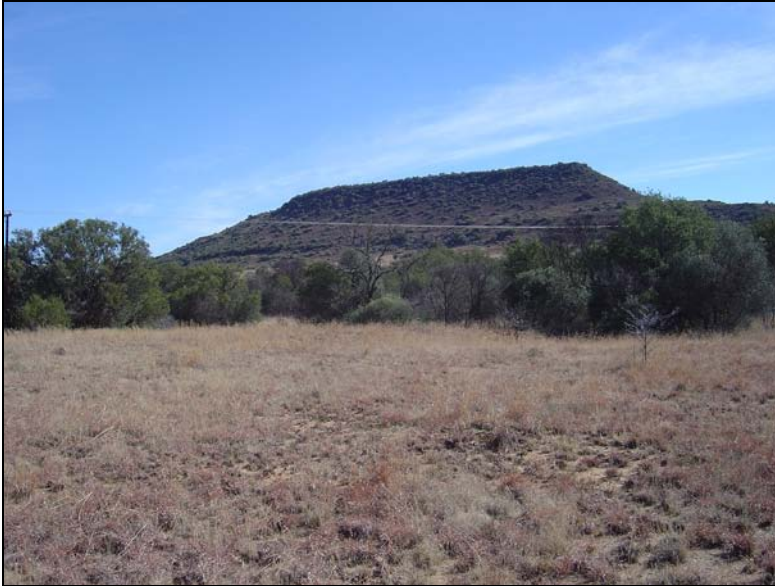
Fig.1 Tafelkop as seen from the lower part of the farm near the railway line.