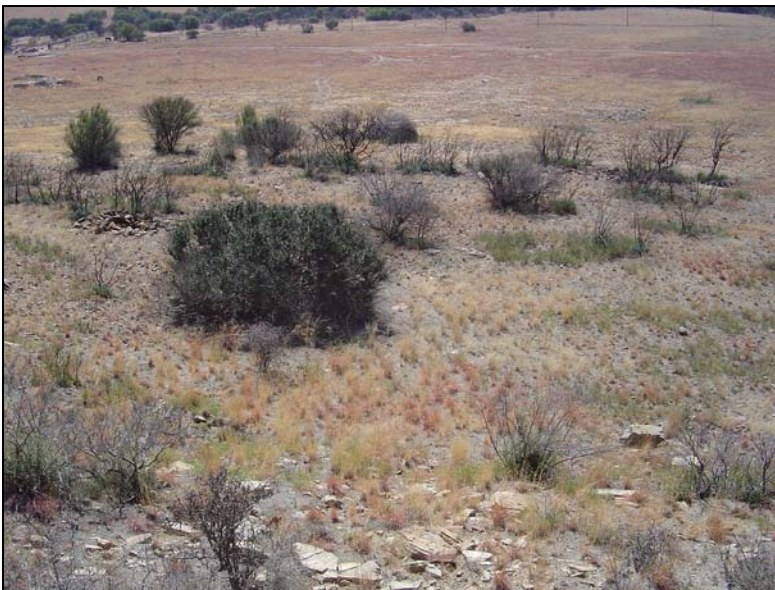
Fig.8 The locality of labourer's houses along the north-facing slope of the hill.