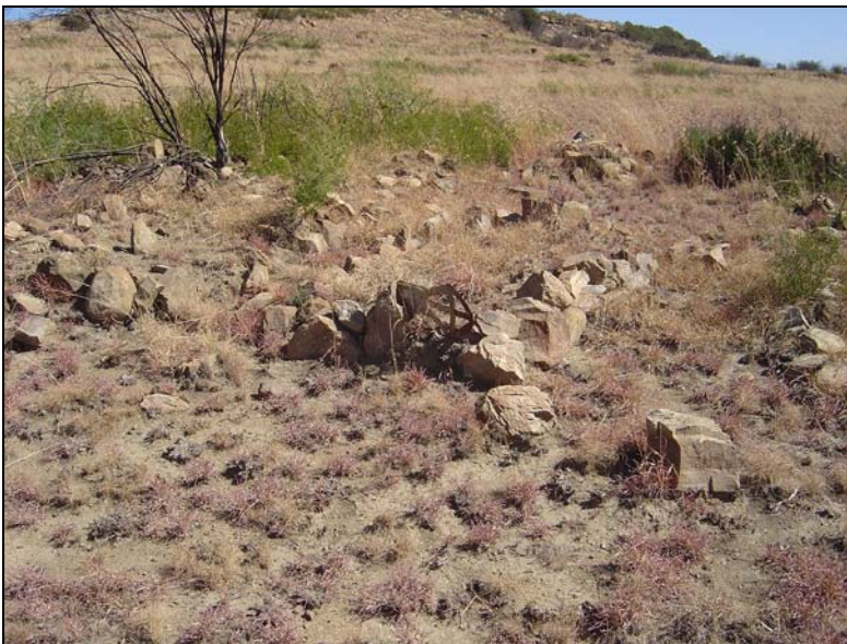
Fig.10 Graves at the foot of the hill near the labourer's houses.