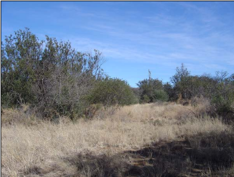
Fig.3 A substantial bush and tree cover occur along the storm-water ditch.