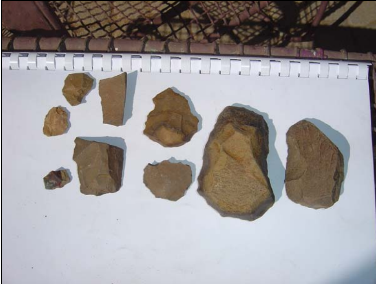
Fig.7 A collection of Late Stone Age (LSA) tools and flakes found scattered on the surface.