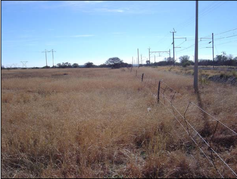
Fig.5 South-eastern corner along the railway line.