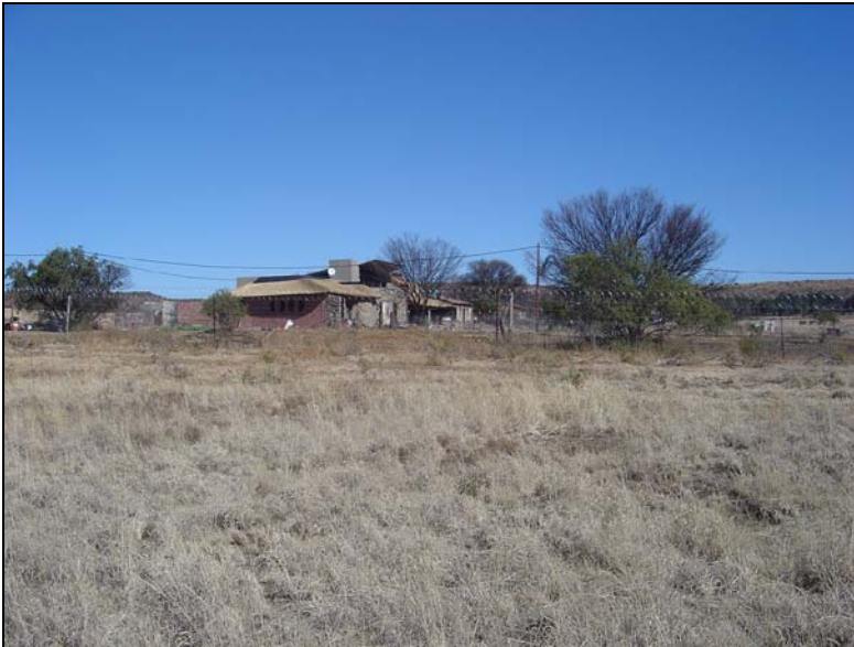
Fig.6 Residential house.