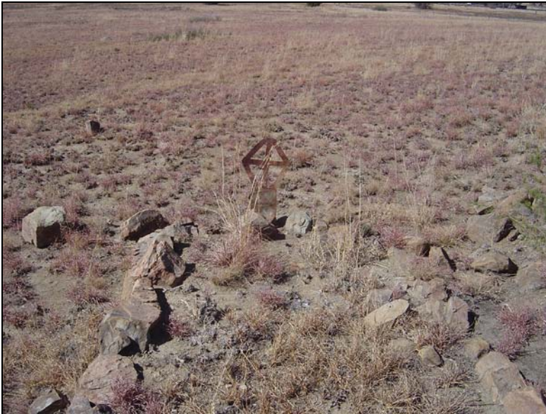
Fig.11 A grave with a metal cross headstone.