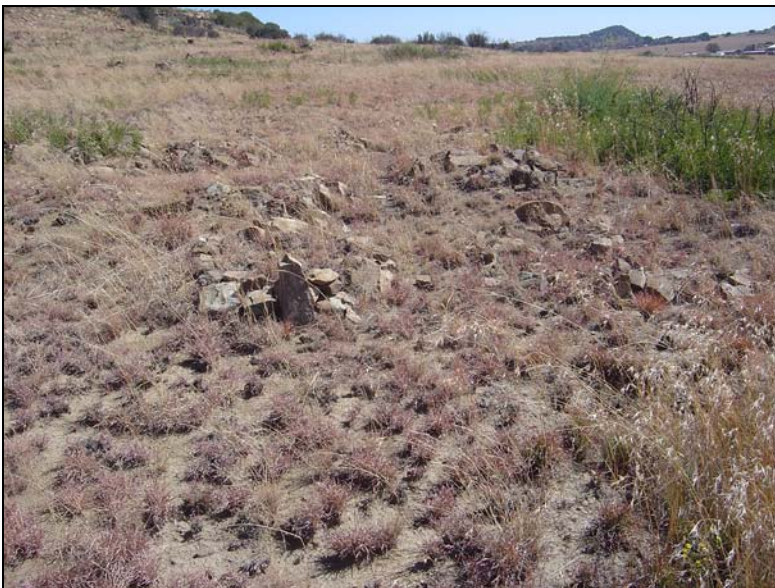
Fig.12 Another group of graves at Dealesgift 2804, Bloemfontein.