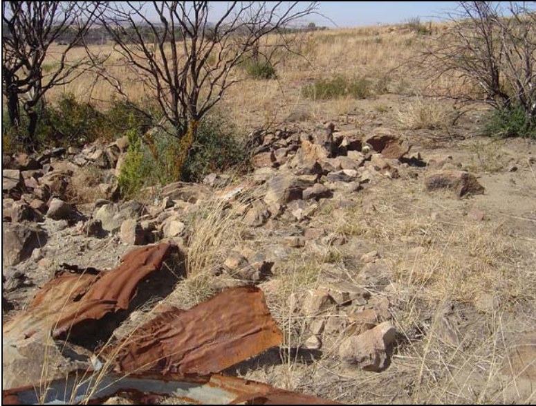
Fig.9 Remains of labourer's houses.