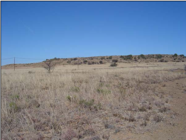
Fig.2. View of the unnamed hill on the property above the residential house.