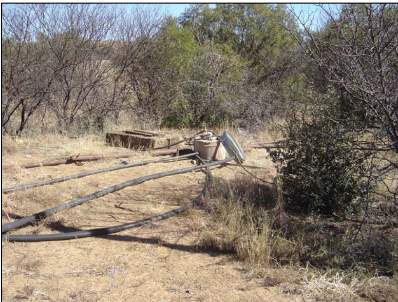
Fig.4 The boreholes for the water supply.