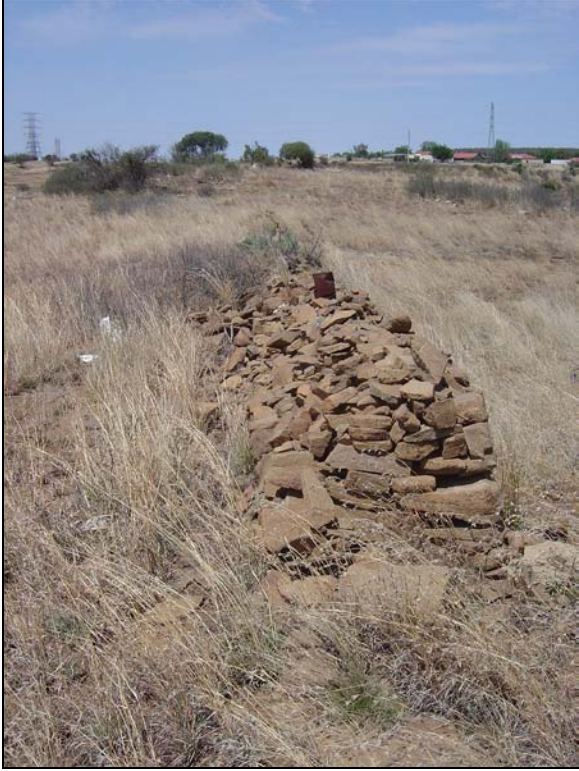
Fig.7 Remains of a stone wall about 15m long.