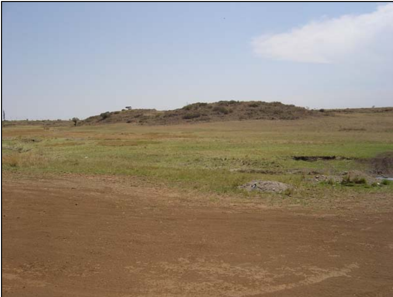
Fig.6 Facing the hill along the entrance road to the Petra Stone Crusher.