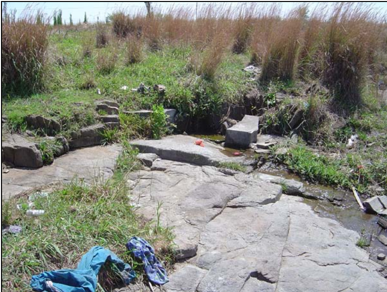
Fig.12 Run-off water from the Noordstad shopping mall provides water for the homeless people living in the bushes and on the rubbish dump.