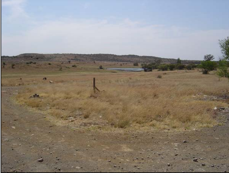
Fig.5 View across the Valley of Seven Dams facing east.