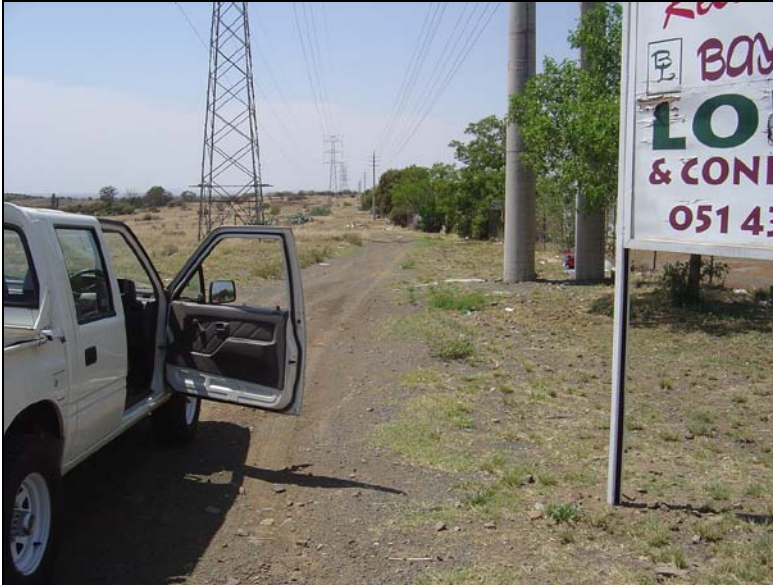
Fig.1 The south eastern corner of the property between Noordstad business complex and the R700 main road facing north west.