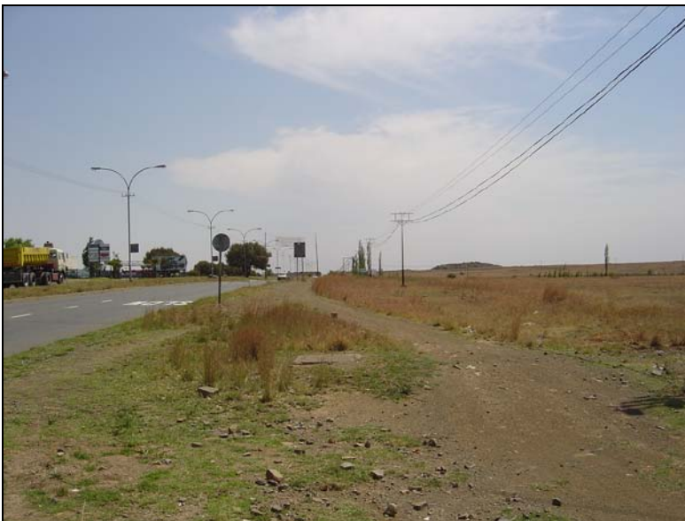
Fig.2 The same locality facing west.