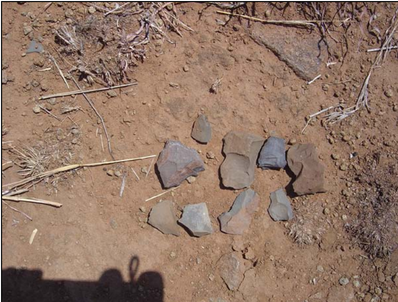
Fig.8 A collection of flake scrapers found near the stone-wall.