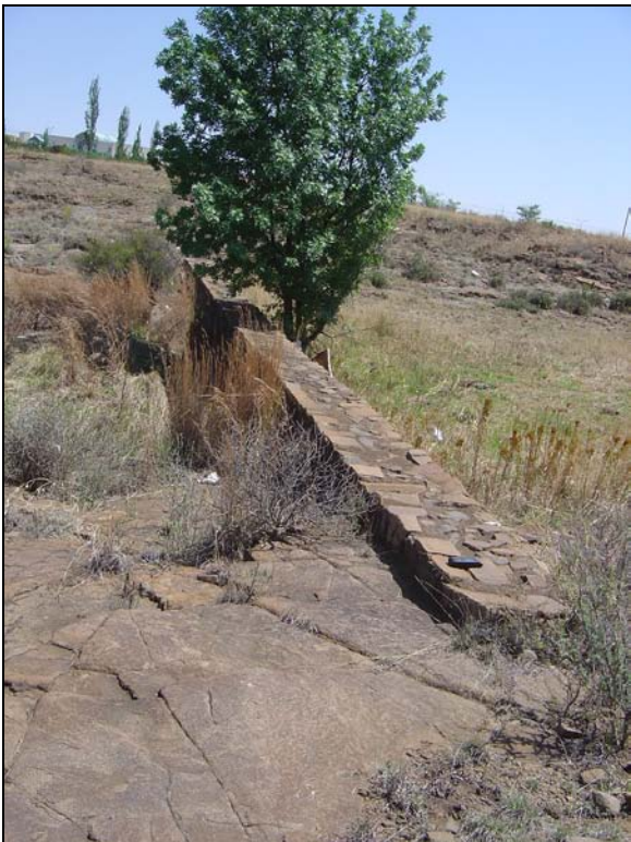
Fig.10 A stone-walled weir in the little stream bed.