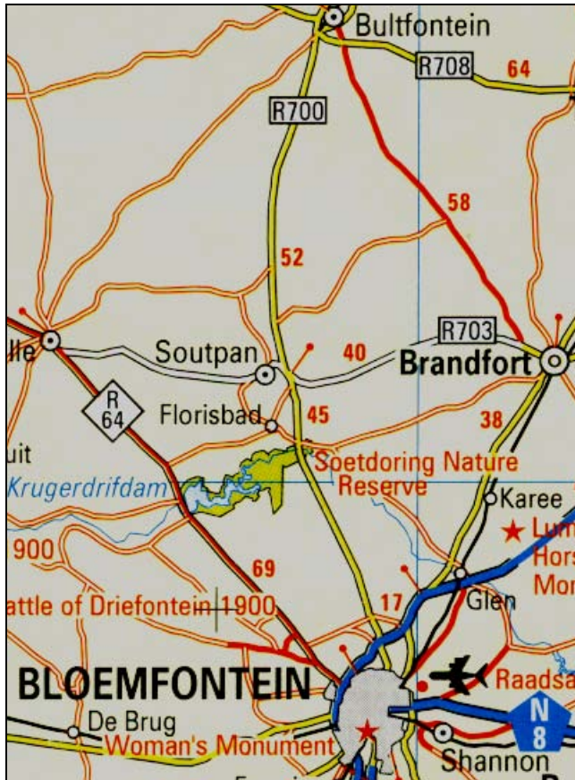
Map 1 Locality of the R700 from Bloemfontein to Bultfontein via Soutpan.