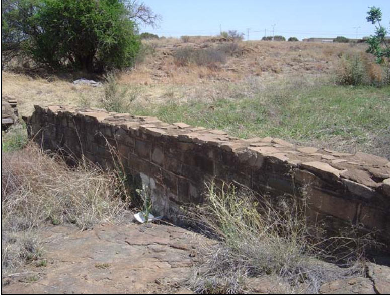
Fig.11 Broken stone-walled weir in the stream bed.