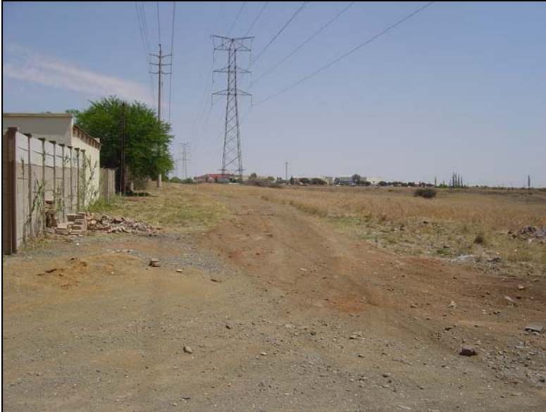
Fig.3 View backwards towards the Noordstad shopping mall.