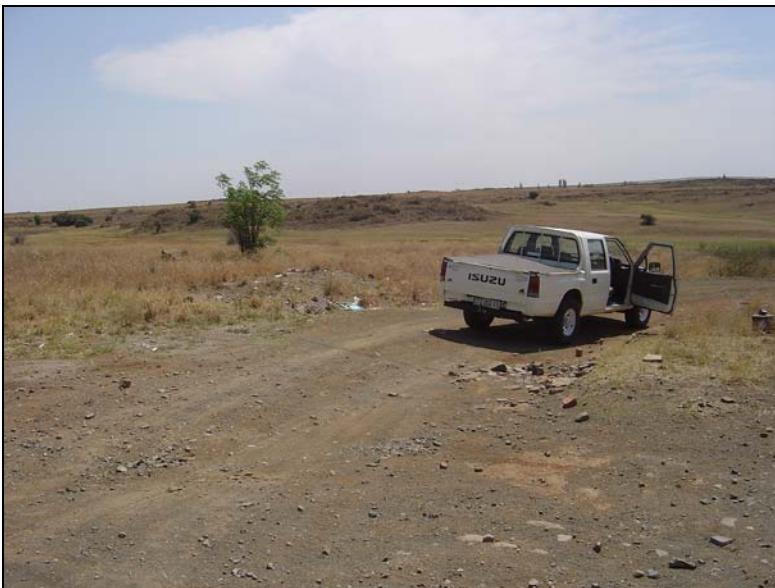
Fig.4 A view from the entrance street from the Bayswater residential area facing north.