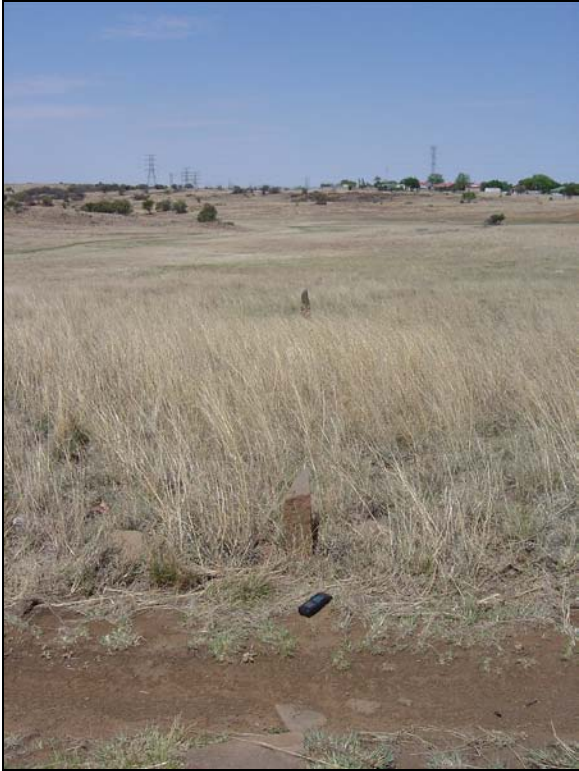
Fig.9 A few stone poles left from a fence of long ago.