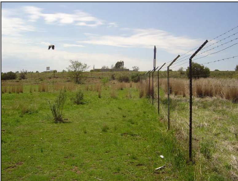
Fig.3 South western corner of the property.