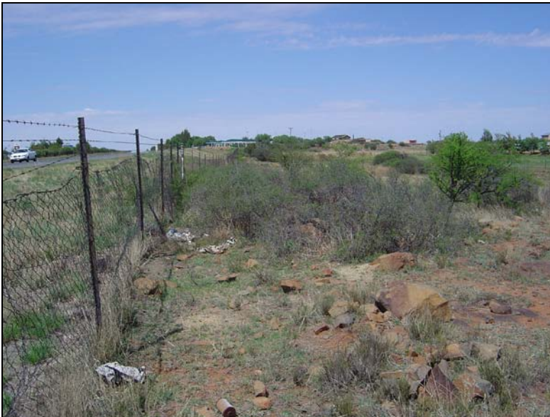
Fig.1 North eastern corner of New Market 2946 along the N1.