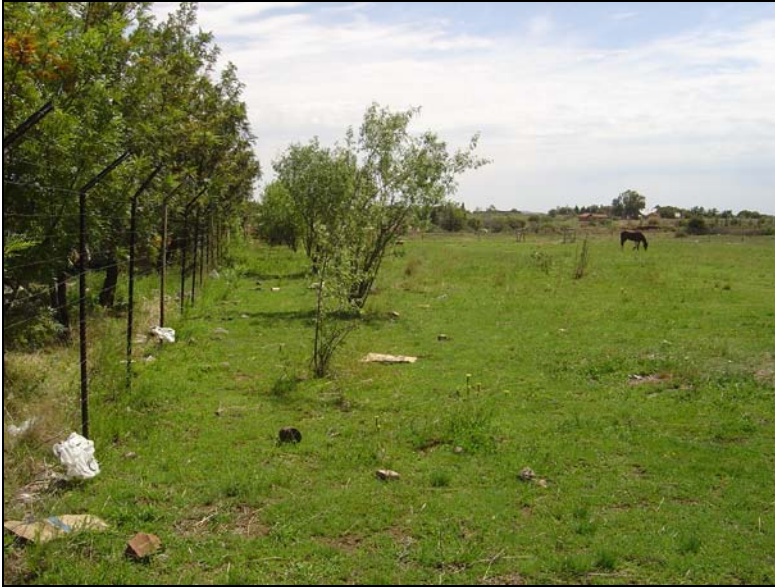
Fig.4 North western corner of the property.