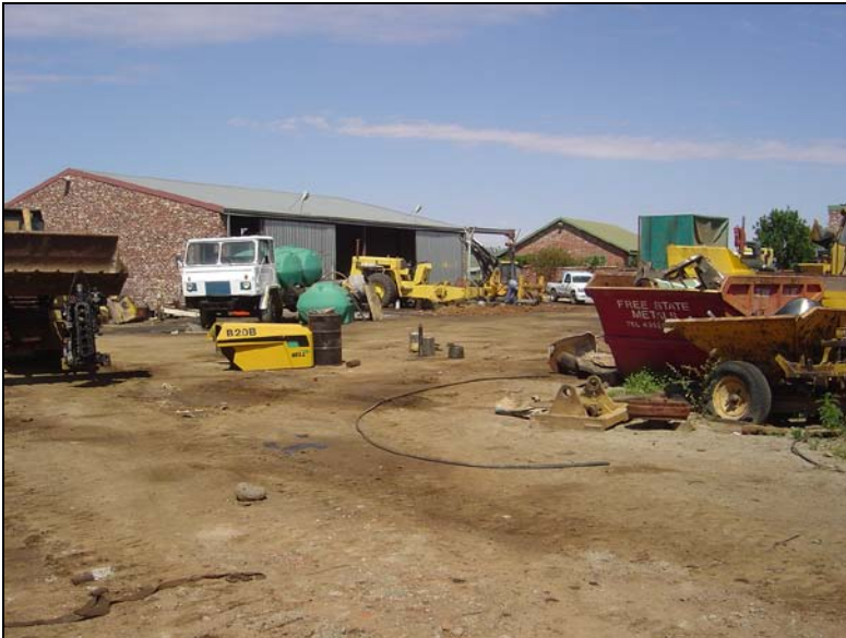
Fig.5 The workshop.