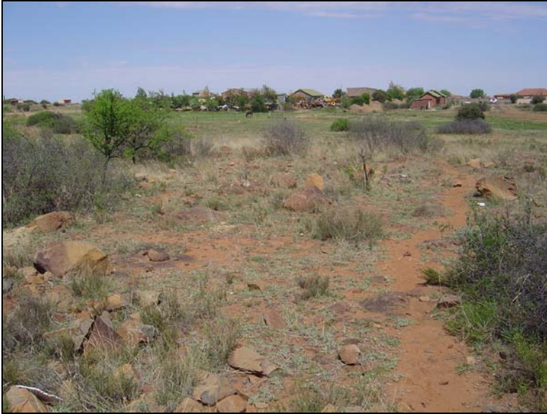
Fig.2 South eastern corner of the property along the N1.