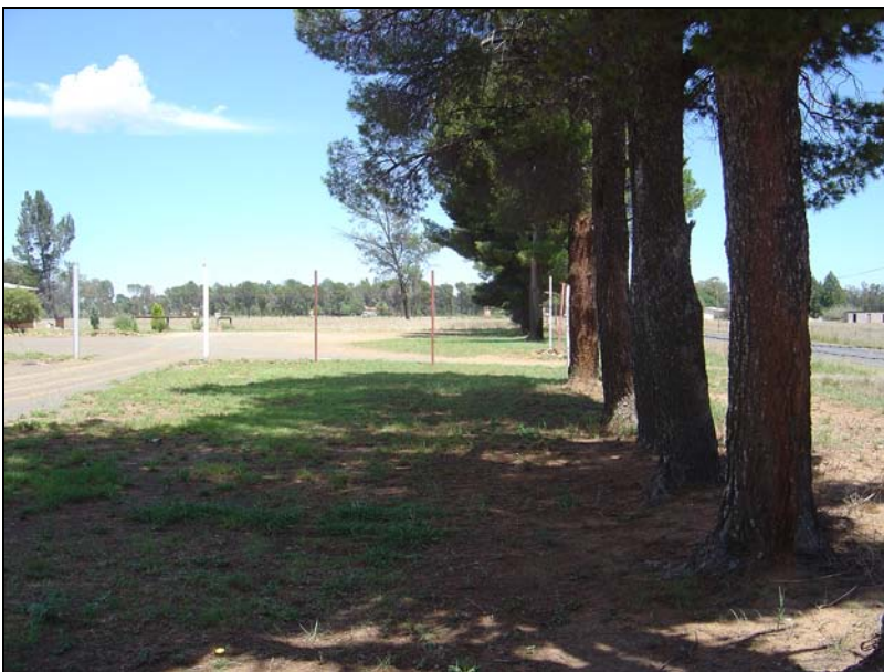
Fig.6 Old Thaba Nchu road at pawn shop.