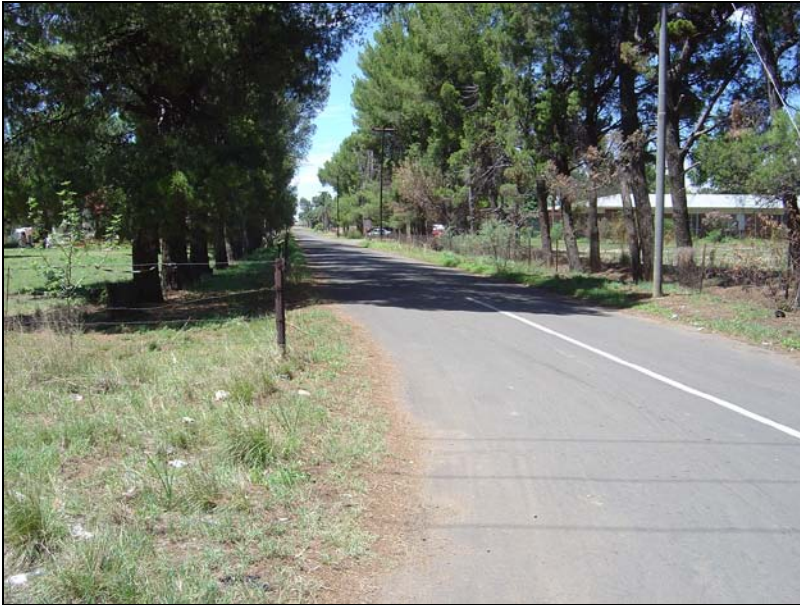
Fig.8 View along Denne Avenue from corner of old Thaba Nchu road. Bloemspruit SAPD station on the right.