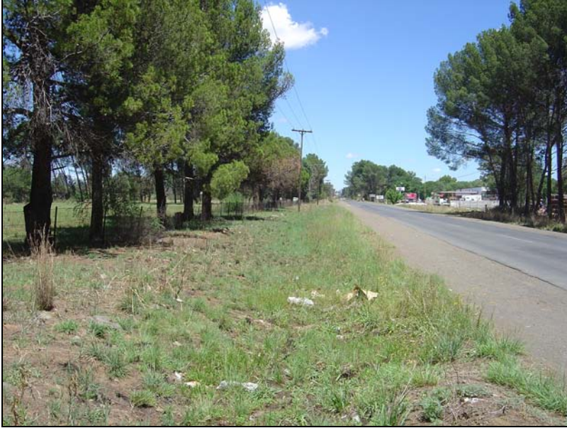
Fig.7 View along old Thaba Nchu road at the corner with Denne Avenue.