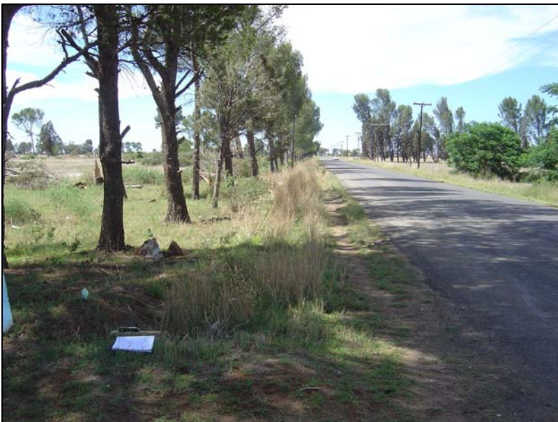
Fig.2 View along Eeufees Ave from corner of old Thaba Nchu road.