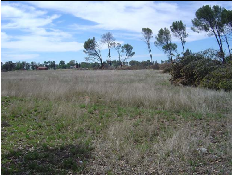
Fig.3 View across the site facing south from Eeufees Avenue.