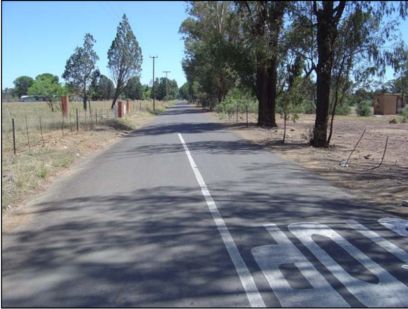
Fig.5 Corner of Denne Avenue and Rose Avenue.