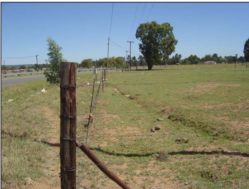
Fig.4 Corner of Eeufees Road and Rose Avenue.