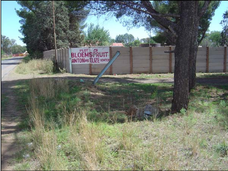
Fig.1 Corner of old Thaba Nchu road and Eeufees Avenue in the distance.