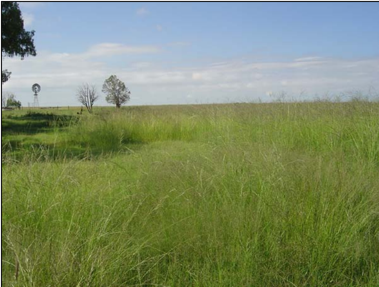
Fig.3 The lush stand of cultivated grazing on the land.