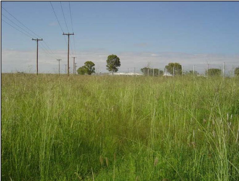
Fig.1 View from the entrance gate of the piece of land.