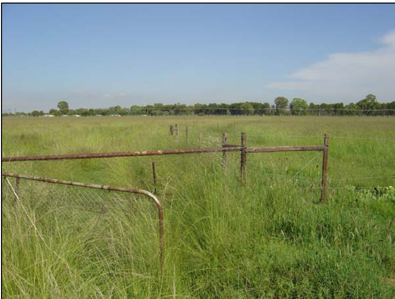
Fig.2 Facing back towards the entrance gate the proposed land on Welton 1587, Bloemfontein.