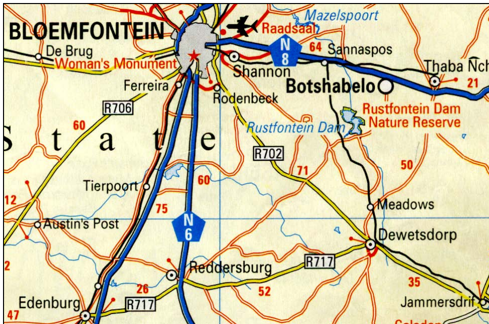
Map 1 Locality of the R702 road between Bloemfontein and Dewetsdorp.