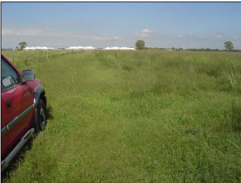
Fig.4 View towards the Grootvlei prison from Welton 1587, Bloemfontein.