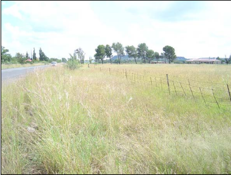
Fig.2 Roderick's Park 2032/Hillside 2827 facing south.