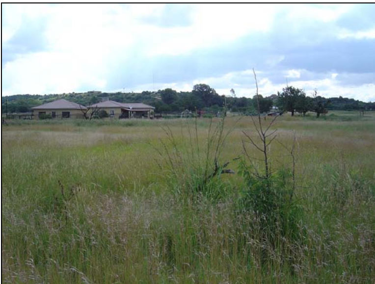
Fig.3 Roderick's Park 2032/Hillside 2827 facing west.