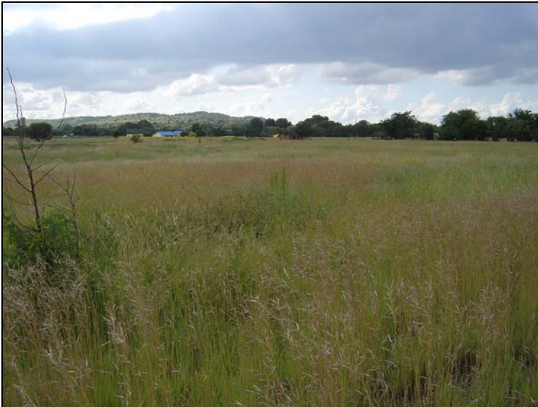
Fig.4 Roderick's Park 2032/Hillside 2827. General view of the site.