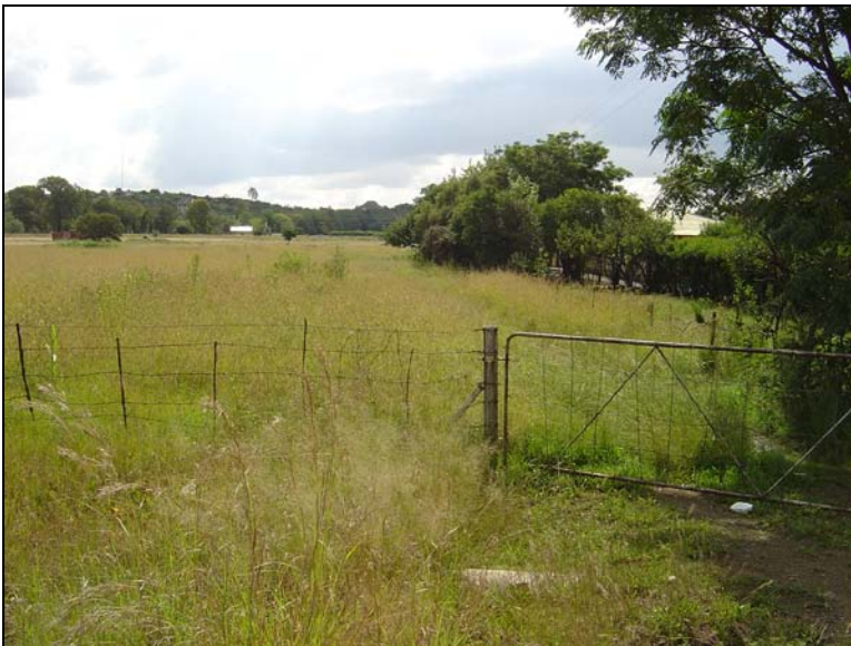
Fig.1 Roderick's Park 2032/Hillside 2827 on the outskirts of Bloemfontein facing north.