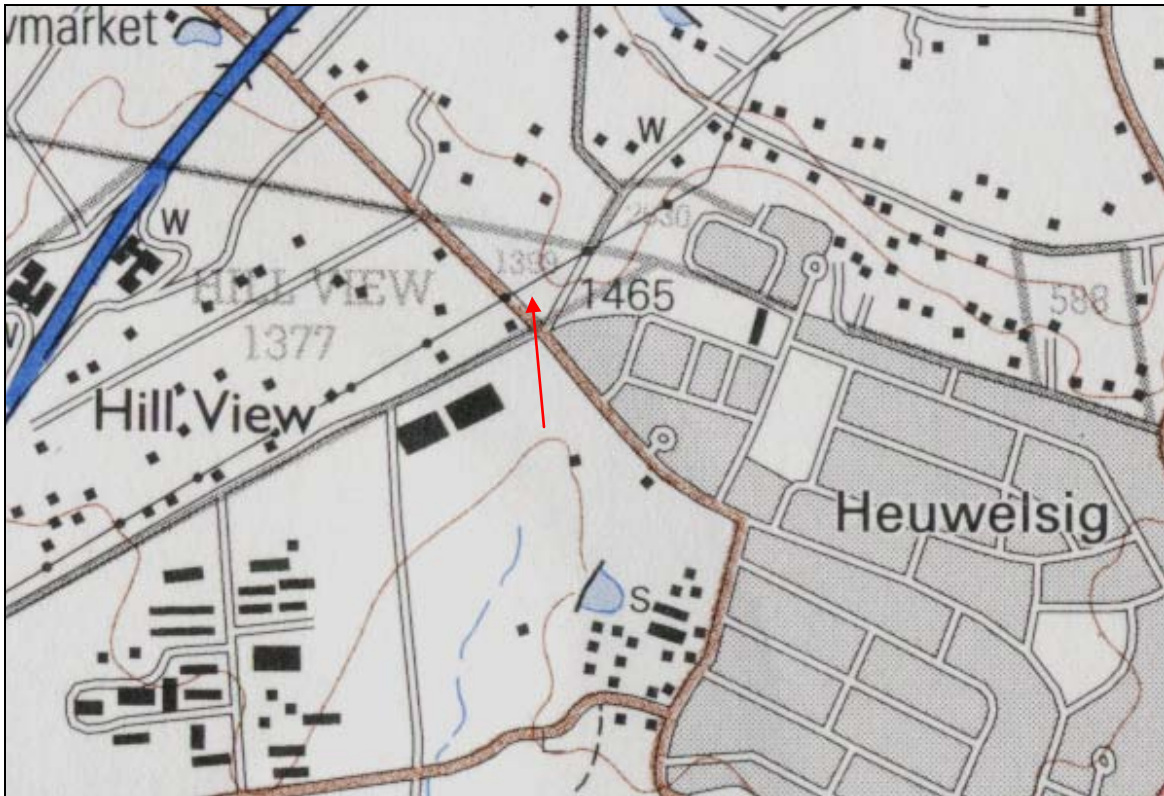
Map 1 Locality of Western Spitskop 1399 near Rayton, Bloemfontein (2926AA).