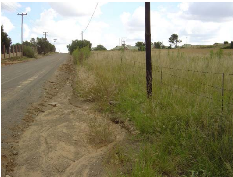
Fig.2 Western Spitskop 1399, Rayton, Bloemfontein, facing north towards the N1 along Frans Kleynhans Road.