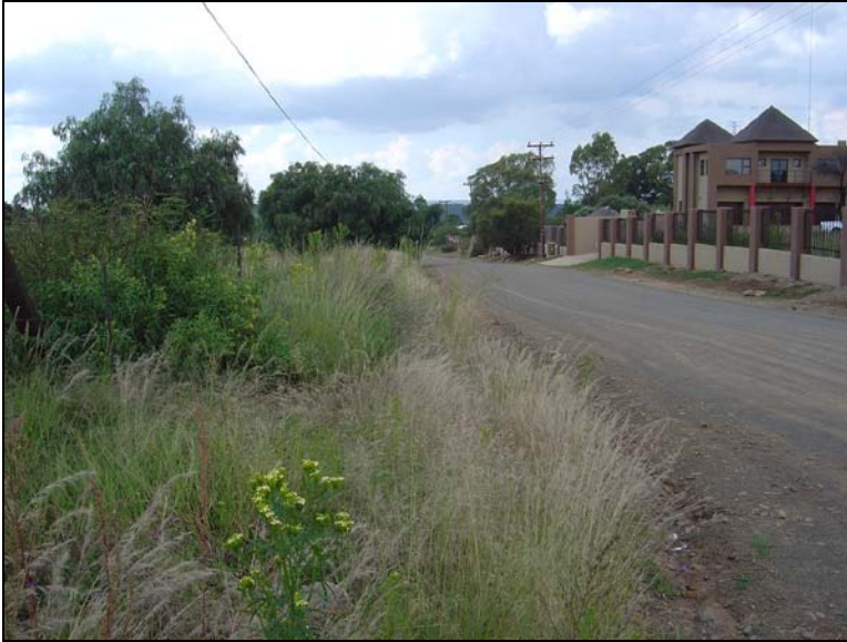
Fig.1 Western Spitskop 1399, Rayton, Bloemfontein, facing east along Ray Champion Road.