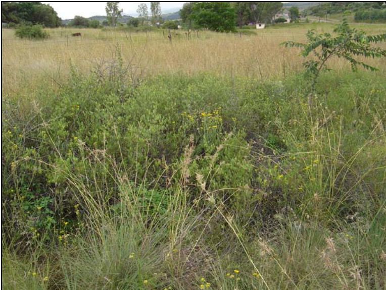
Fig.5 Patches of Rhus ciliata (Klein Suurtaaibos) occur where the soil had been disturbed.