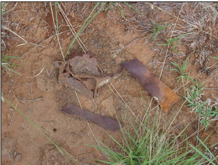
Fig.6 Soldered tin can and other pieces of metal characteristic of the Anglo-Boer War.