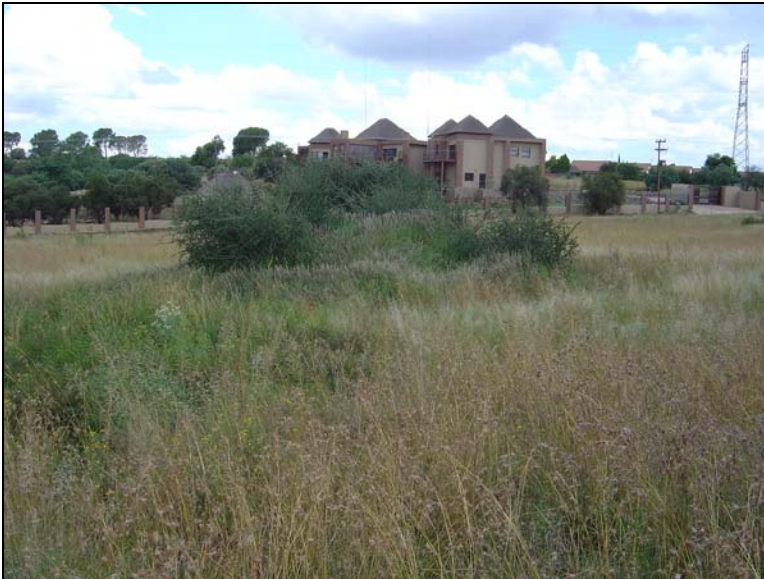
Fig.3 General view of the site from the eastern corner.