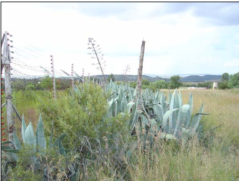
Fig.4 The northern corner of the proposed site.