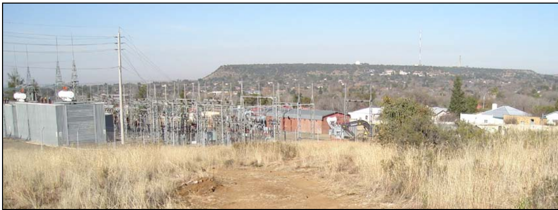
Fig.1 View of the Bayswater Sub-station with Naval Hill in the background.