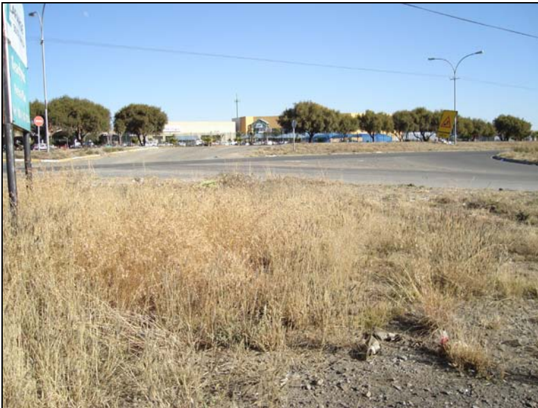
Fig.3 View of the area opposite North Ridge Mall.