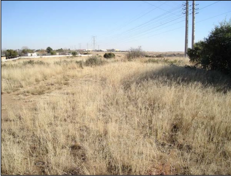
Fig.2 The power line route from Bayswater Sub-station towards North ridge Mall.