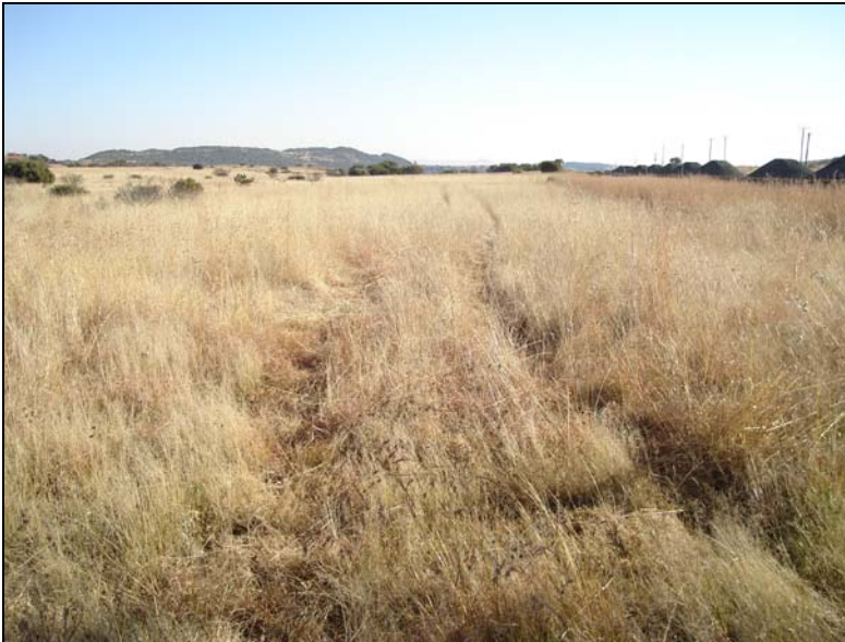
Fig.6 The servitude line on the farm Bayswater 2865 facing west.