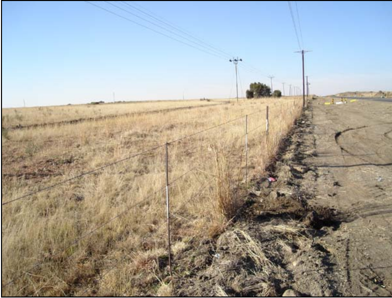
Fig.4 The crossing point of the power transmission line over the R700 road.