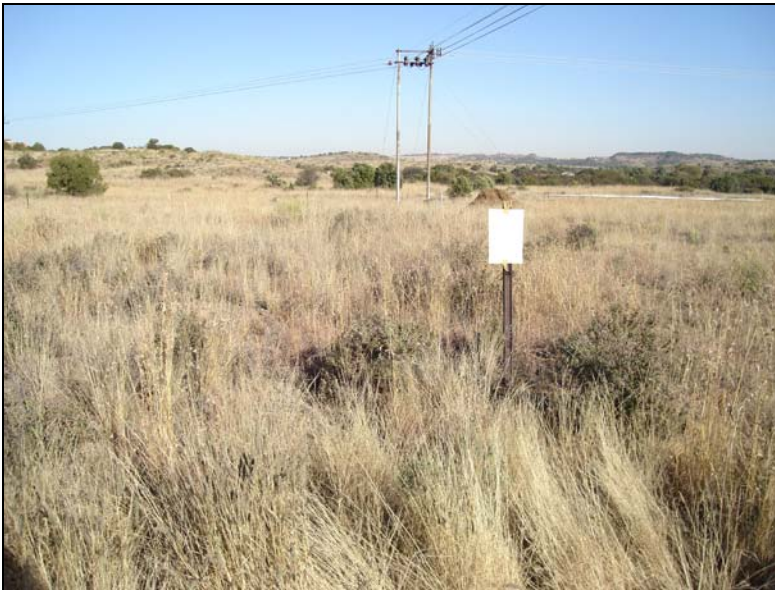
Fig.5 Position of the new sub-station near the R700 road.