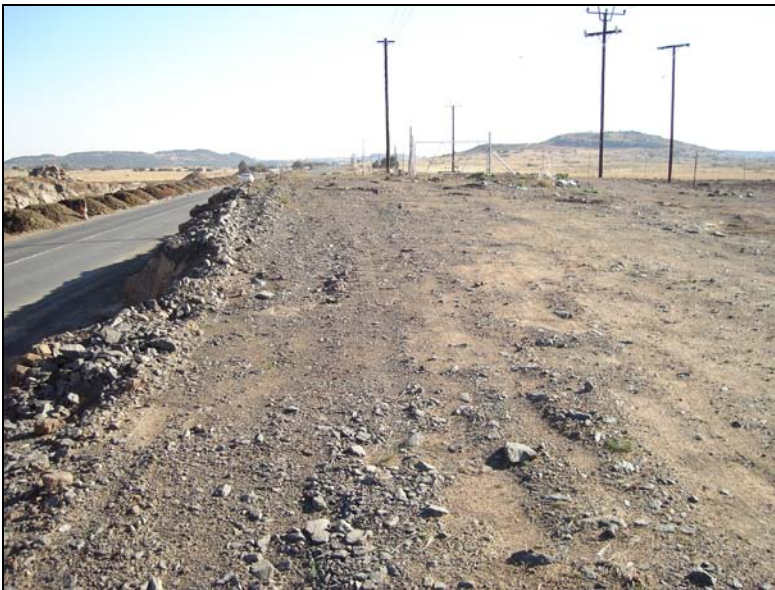
Fig.7 Effects of road building in the area west of North Ridge Mall.