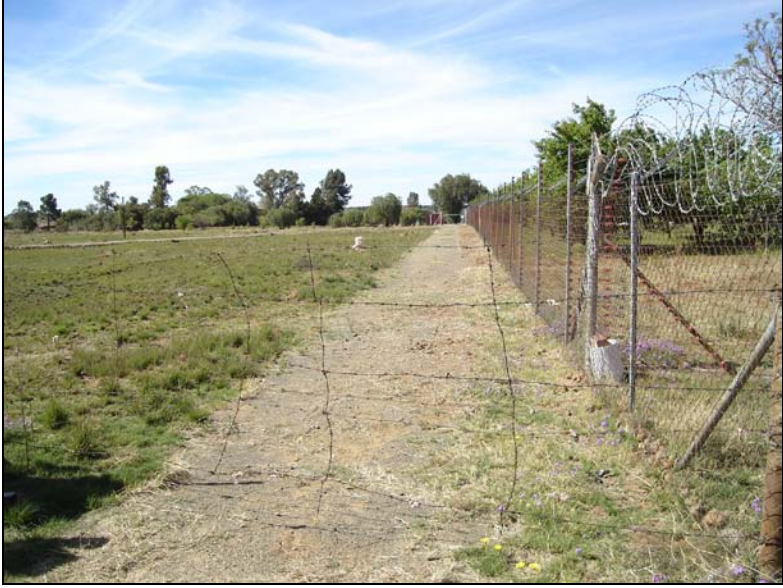
Fig.6 South eastern corner of the site facing north.