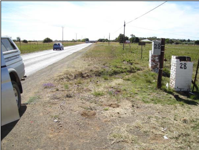
Fig.5 South eastern corner of the site facing west.