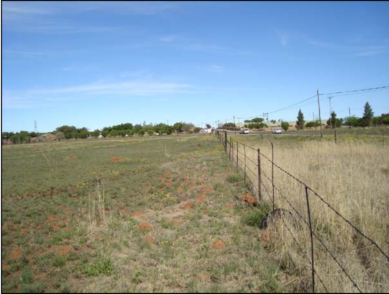
Fig.4 South western corner of the property facing east.