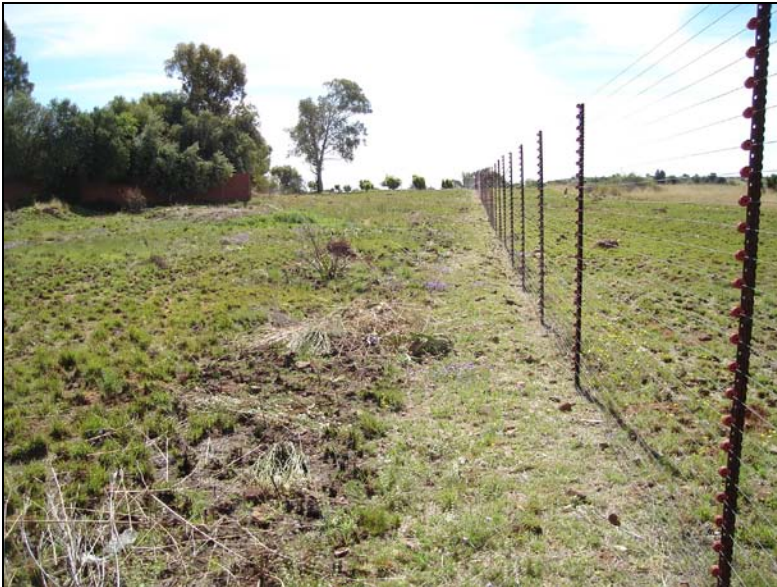
Fig.3 North eastern corner of the property facing north.