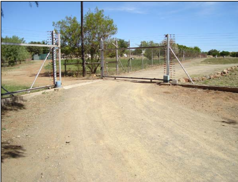
Fig.1 Entrance gate to the property proposed for development.