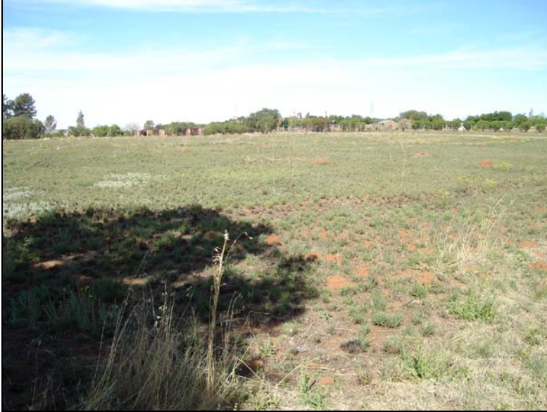
Fig.2 General view of the site proposed for development.