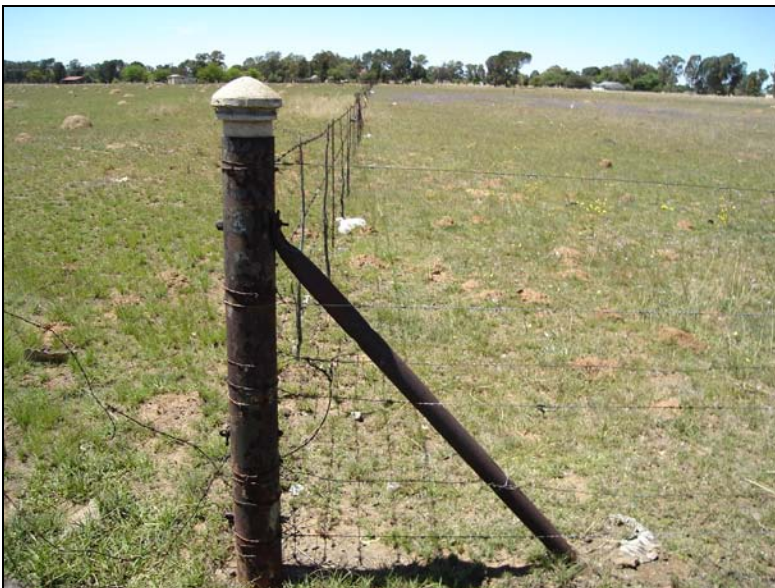
Fig.4 Border of property in Eeufees Road.