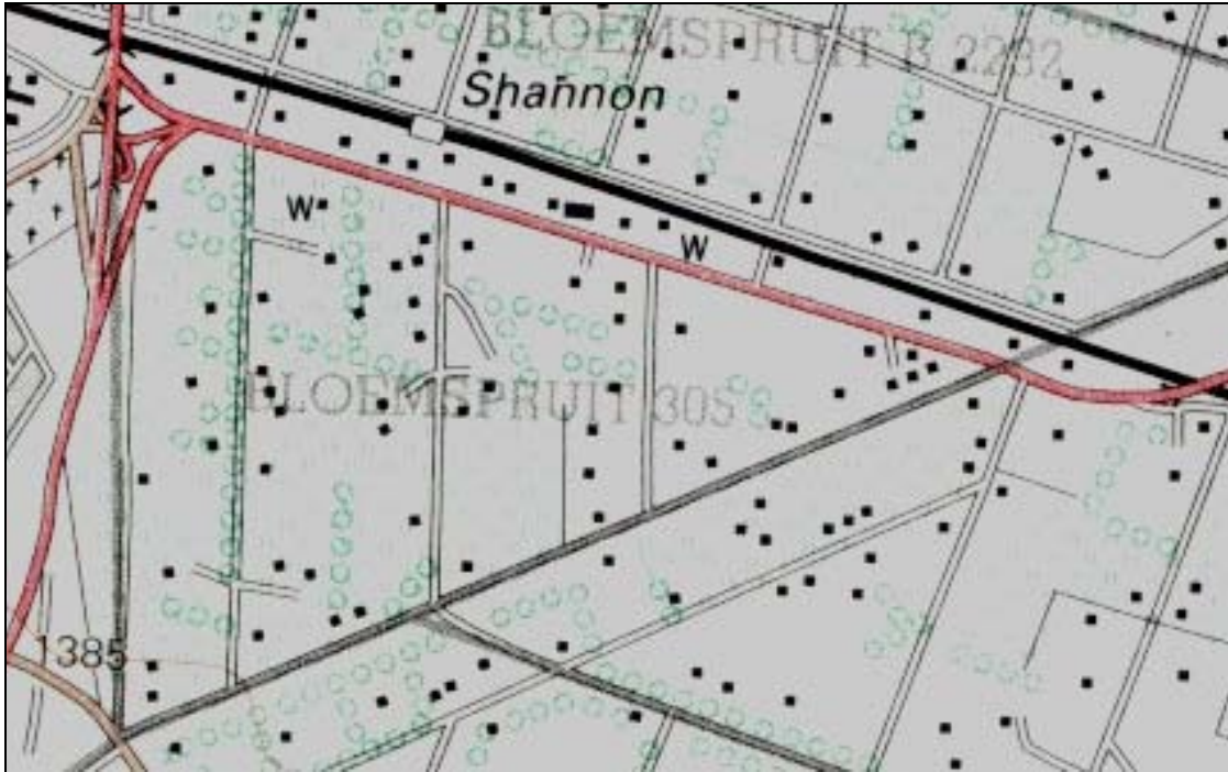
Map 1 Locality of the site Bloemspruit 305, Bloemfontein (2926AB).