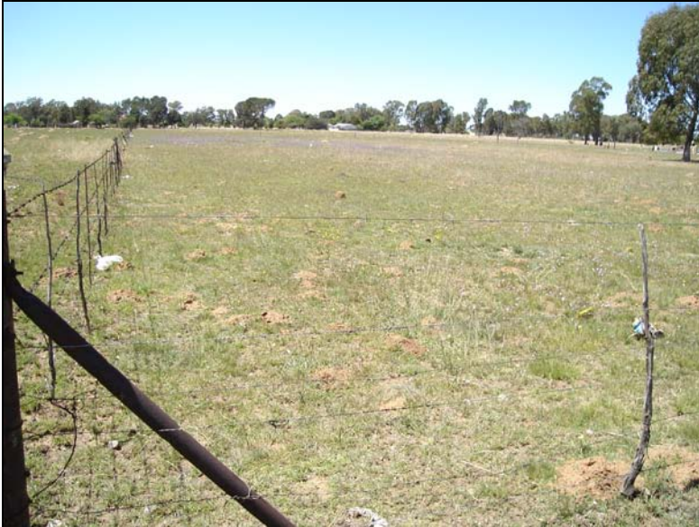
Fig.5 Border of property in Eeufees Road..