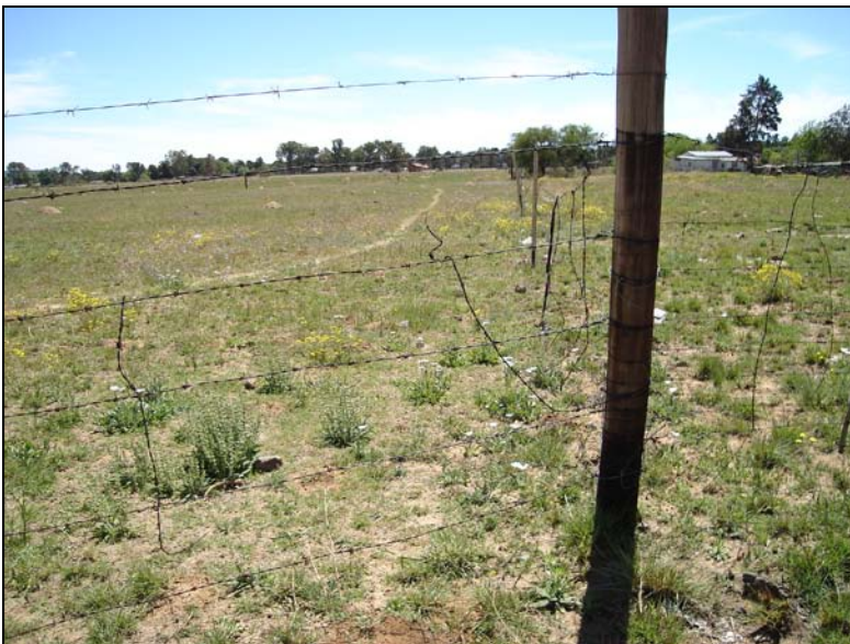
Fig.6 Plot 16A Rose Avenue.