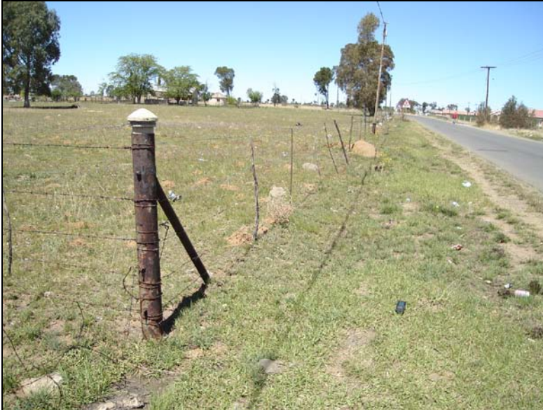
Fig.3 Eeufees Road.