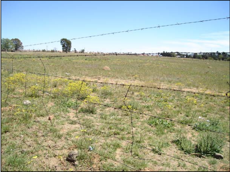
Fig.7 Plot 16A Rose Avenue.