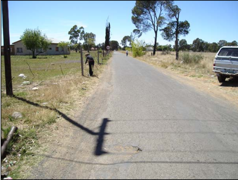
Fig.1 Corner of Eeufees Road & Rose Avenue.