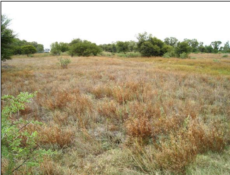
Fig.4 The area proposed for the cultural village and chalets.