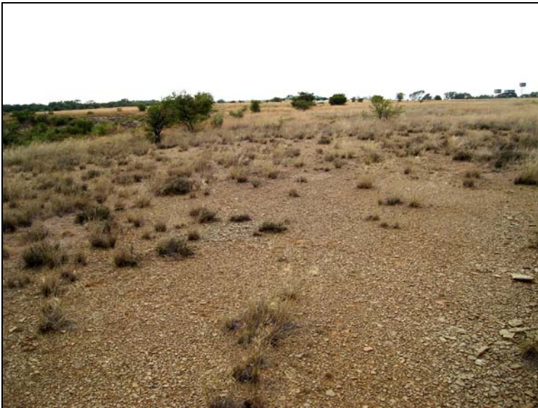
Fig.8 The area for the proposed Eco Park.