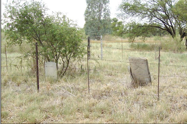
Fig.5 Two unidentified graves in the area near the entrance road.