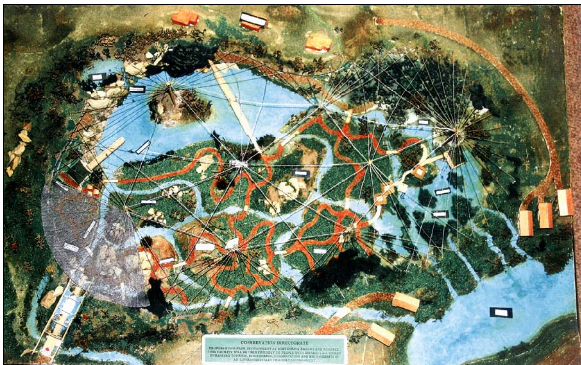
Fig.2 Plan of the proposed Eco Park in the Soetdoring Nature Reserve near the Modder River.