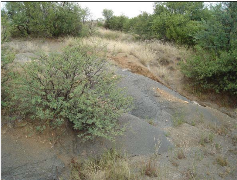
Fig.12 Blue shale is exposed by the erosion of top soil in the dongas.