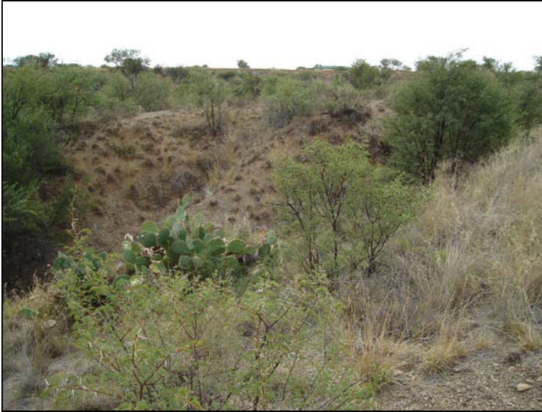
Fig.9. The dongas will become part of the Eco Park development.