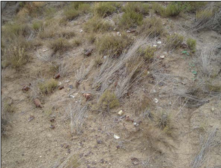
Fig.10 Patches of household debris are found in the dongas.