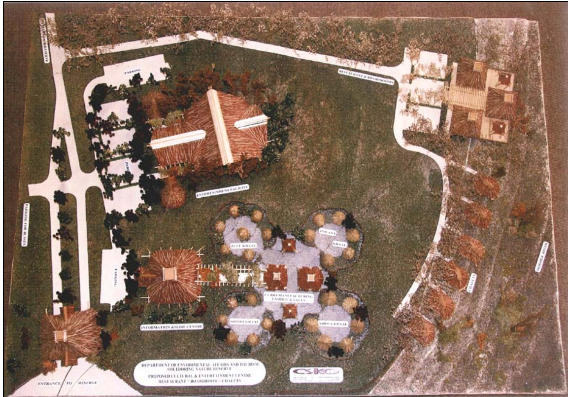
Fig.1 Plan indicating the proposed information centre, cultural village and chalets.