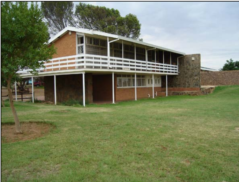
Fig.6 The elegant farmhouse had been transformed into a conference centre.