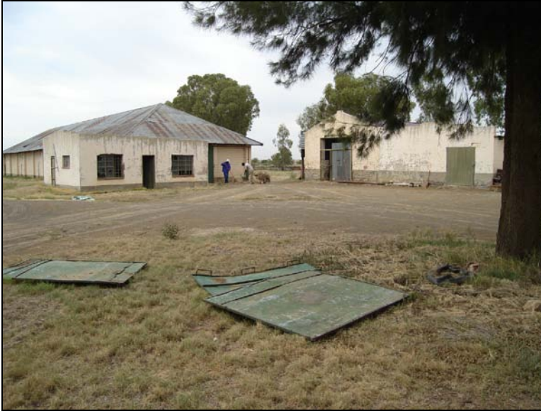
Fig.7 The outbuildings had been part of the old farmyard.