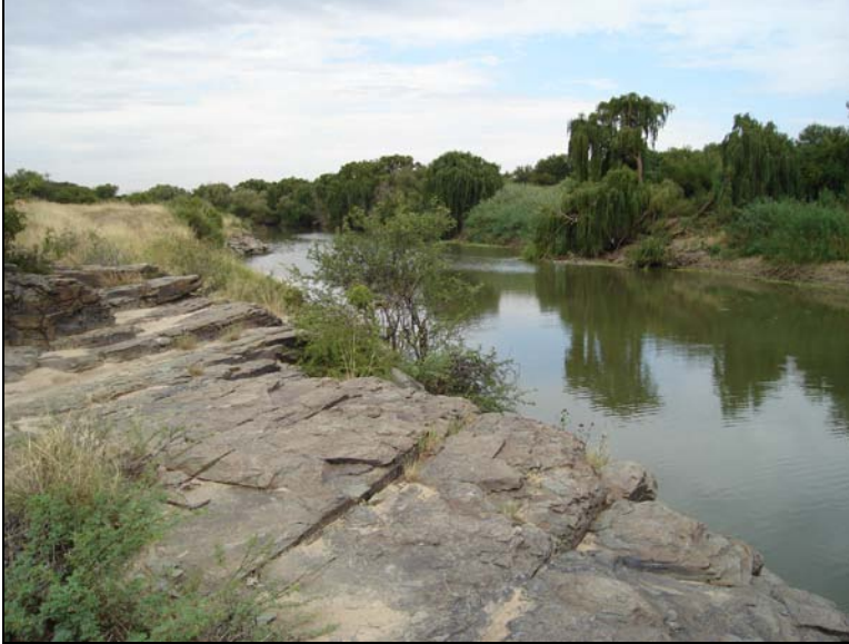
Fig.11 A view of the Modder River near the planned Eco Park.