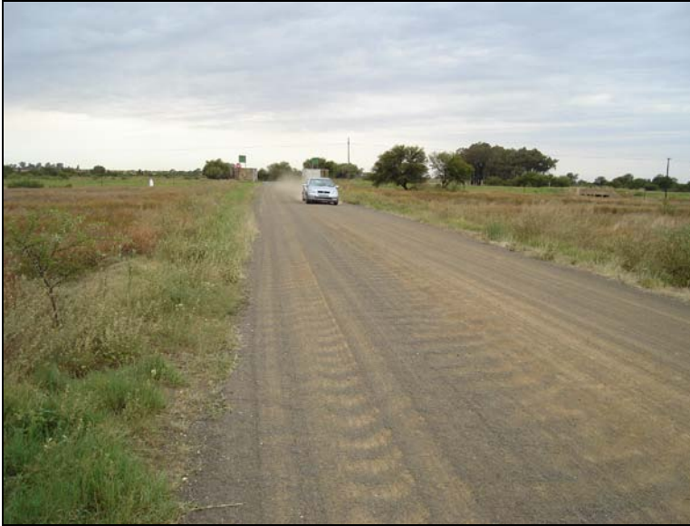
Fig.3 Entrance road from the R700 between Bloemfontein and Bultfontein.