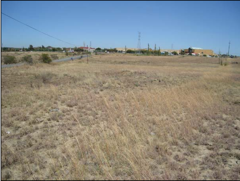
Fig.4 View from Point C facing North Ridge Mall.