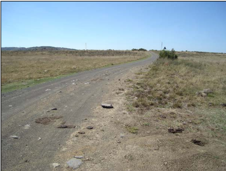
Fig.1 Point A at the north west corner of the property along the R700 main road facing east.