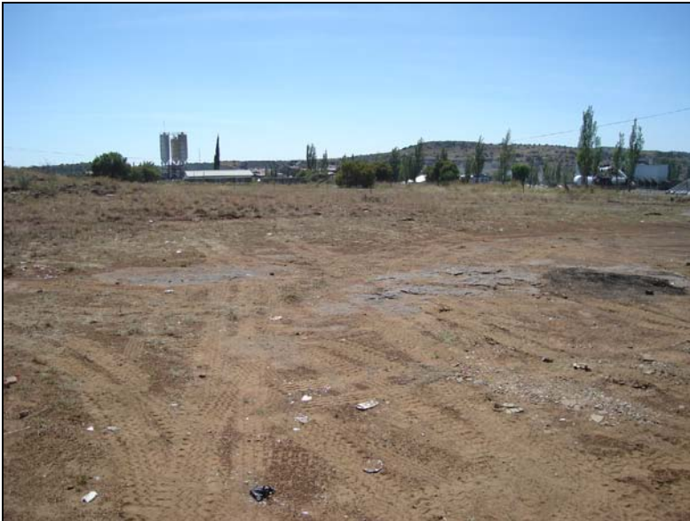
Fig.5 View from Point D facing the Petra quarry and stone crusher.