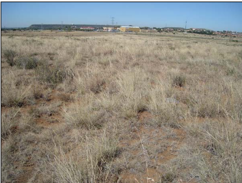
Fig.3 View from Point B facing North Ridge Mall.