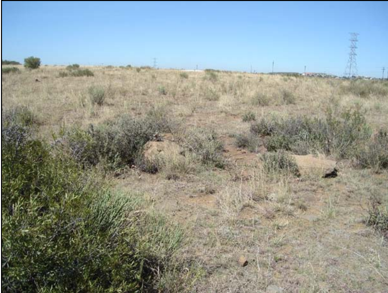
Fig.2 The vegetation at Point B.