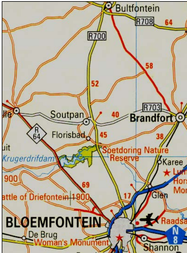
Map 1 Locality of the R700 from Bloemfontein to Bultfontein via Soutpan.