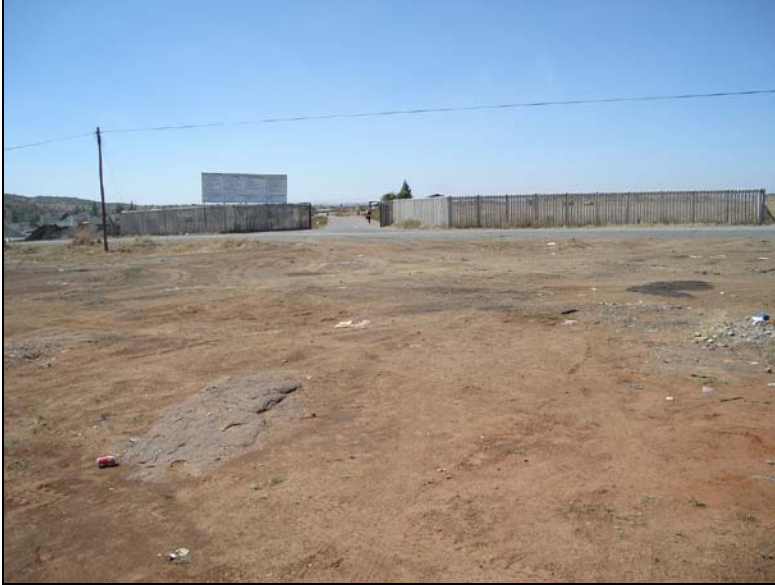
Fig.6 Point D facing the entrance to the municipal land fill site.