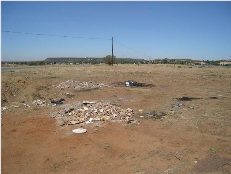
Fig.7 View from Point D facing towards Bayswater and Naval Hill.