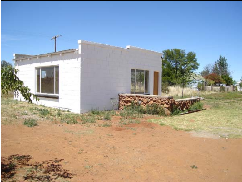
Fig.3 Existing residence on the Remainder of Blackheath 1397 (Hill View 1377), Bloemfontein.