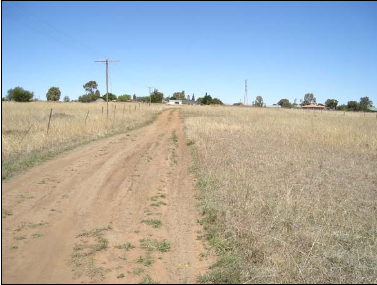
Fig.1 View of the Remainder of Blackheath 1397 (Hill View 1377), Bloemfontein, facing east.