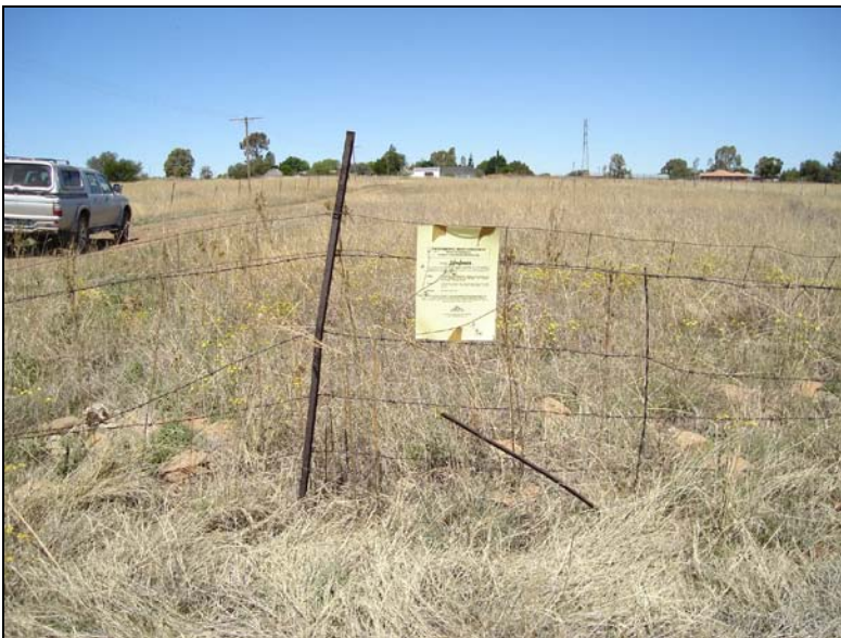
Fig.2 Another view of the Remainder of Blackheath 1397 (Hill View 1377), Bloemfontein.