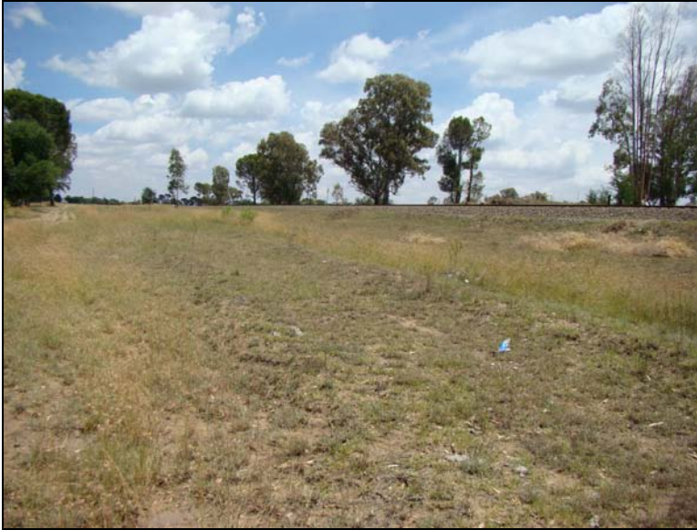
Fig.10 Point E Railway line.