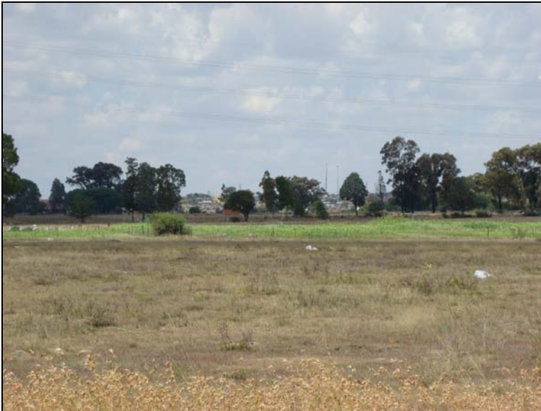
Fig.12 Point F.