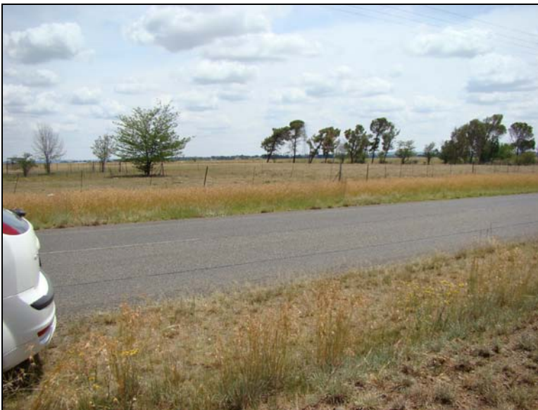
Fig.5 Point C Martin Road.