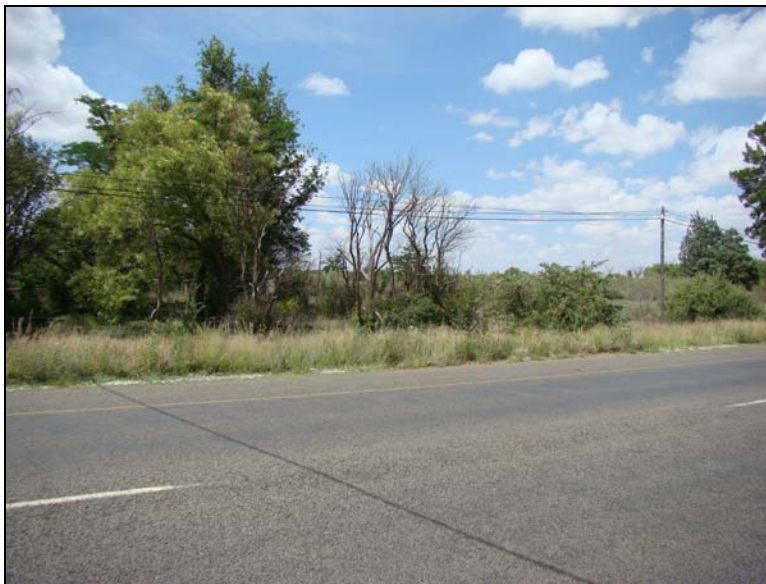
Fig.1 Point A Ribblesdale.