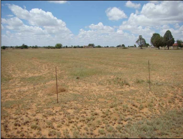
Fig.6 Point C Martin Road.