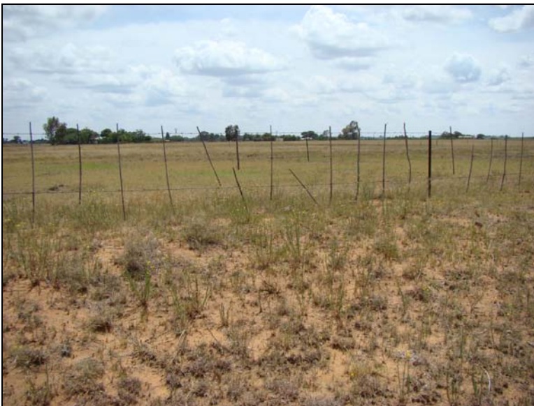
Fig.7 Point D Lynchfield.