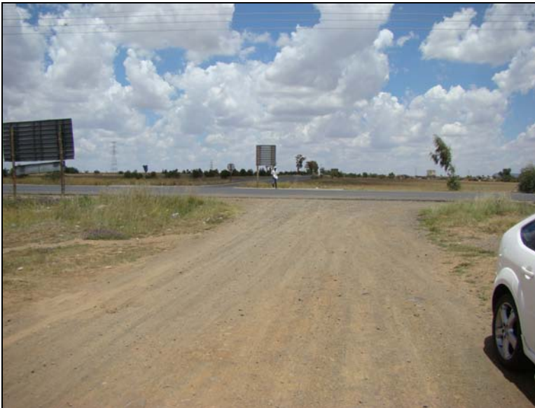
Fig.15 Point H Dewetsdorp Road.