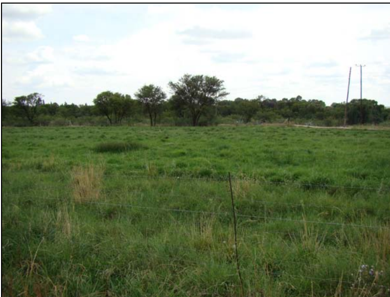
Fig.3 Point B at Midway.