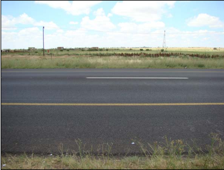
Fig.4 Pont B at Midway.