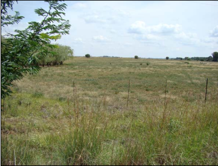
Fig.2 Point A Ribblesdale.