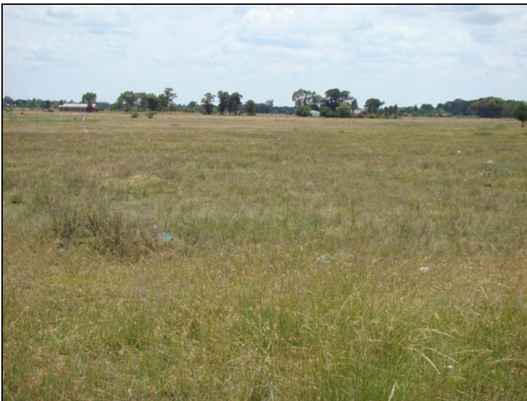
Fig.13 Point G Meadows Road.