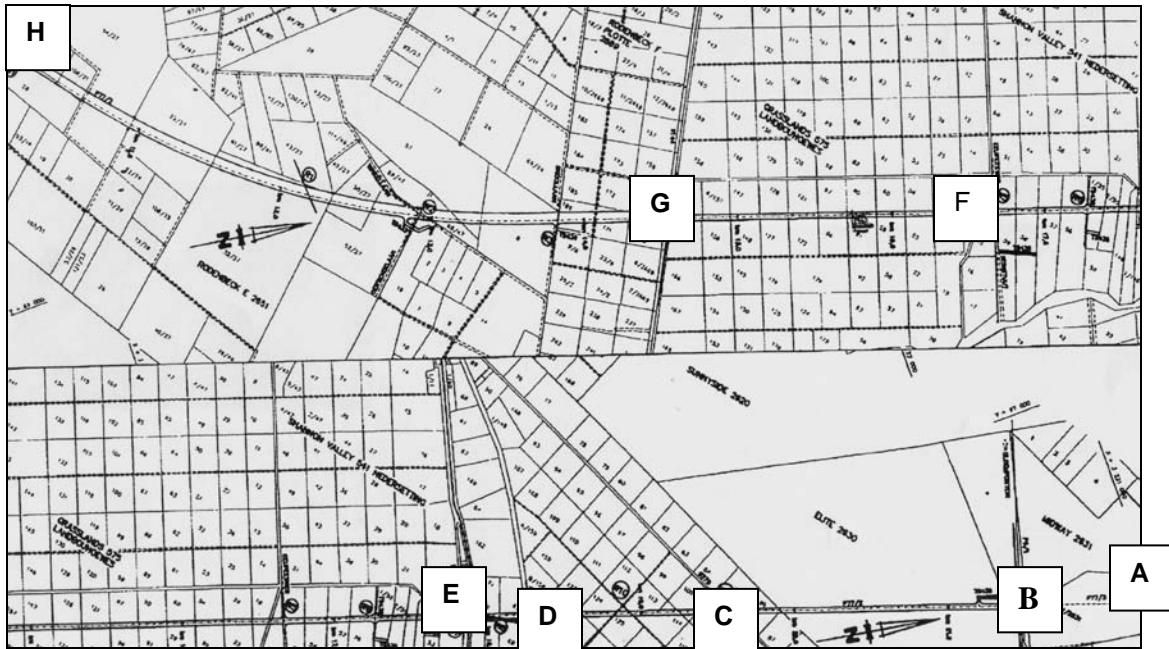
Map 3 Locality of the GPS coordinate points taken at the Bloemfontein Race Track. Club House and stands indicated by red arrow.