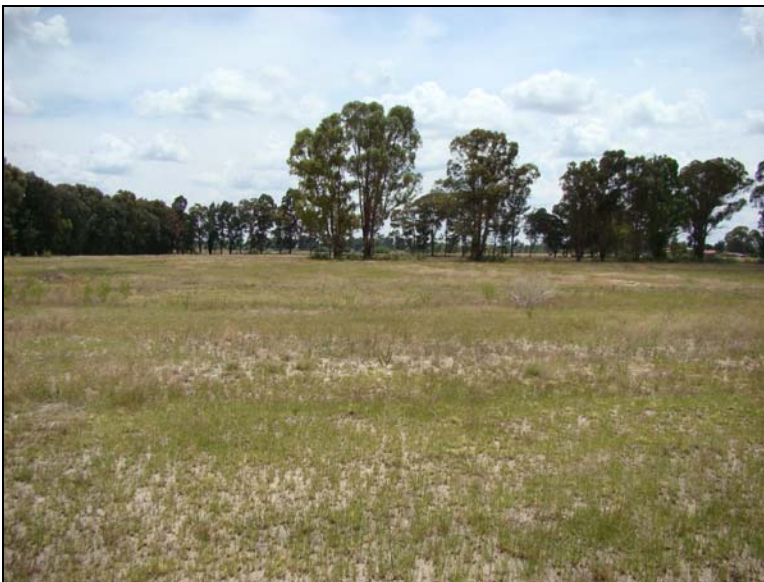
Fig.11 Point F.