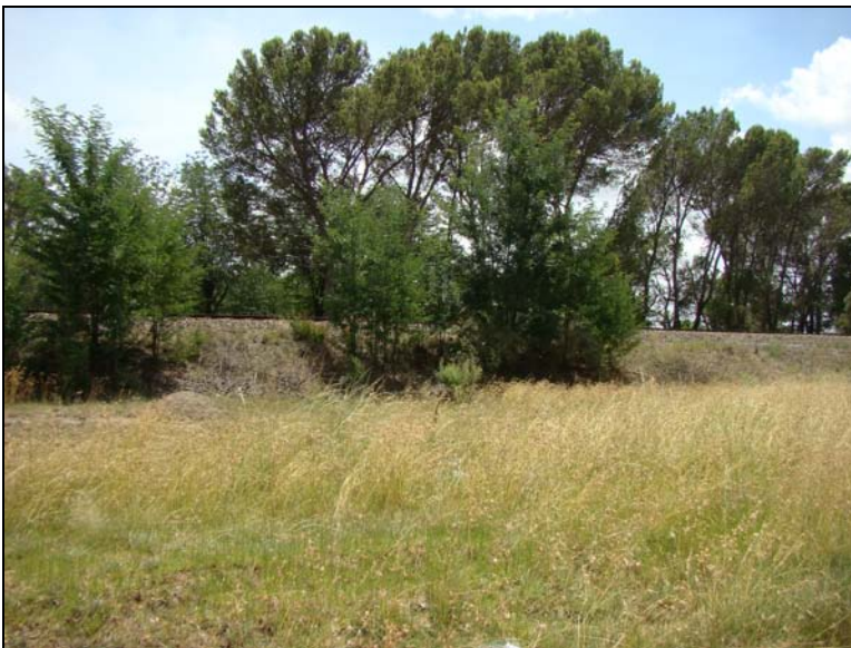
Fig.9 Point E Railway line.