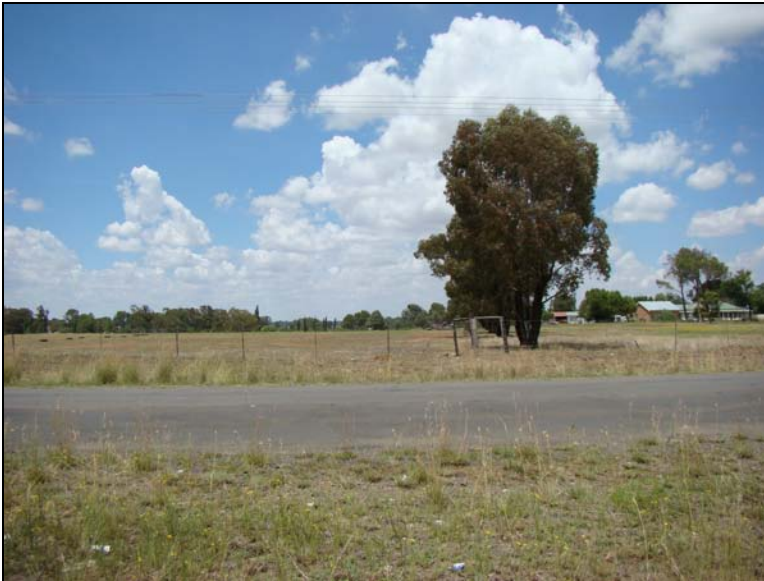
Fig.8 Point D Lynchfiled.