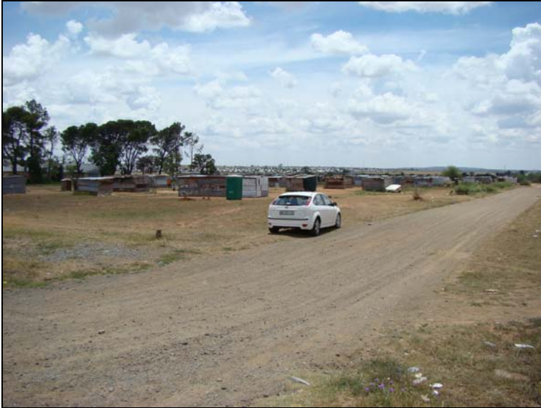
Fig.16 Point H Dewetsdorp Road.