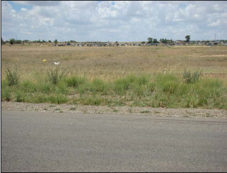
Fig.14 Point G Meadows Road.