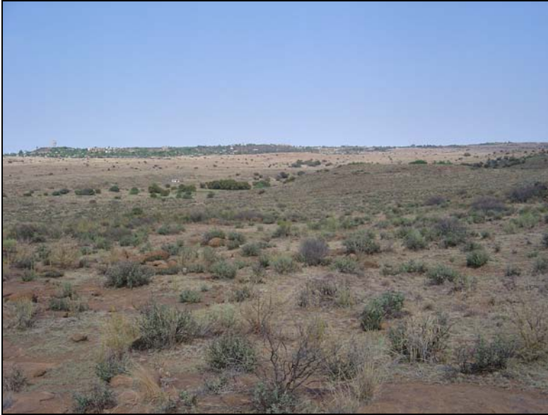
Fig.4 A view down the hill stone towards the N1.