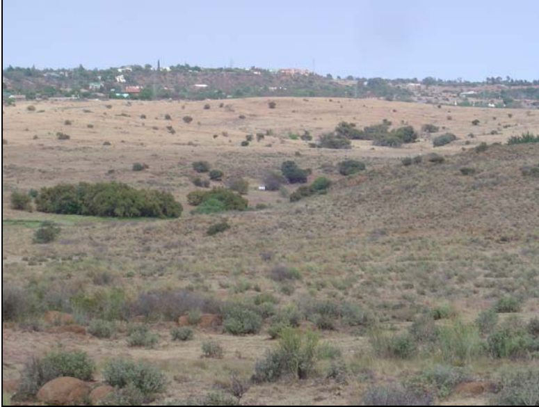
Fig.6 View down the slope towards the stream in the kloof.