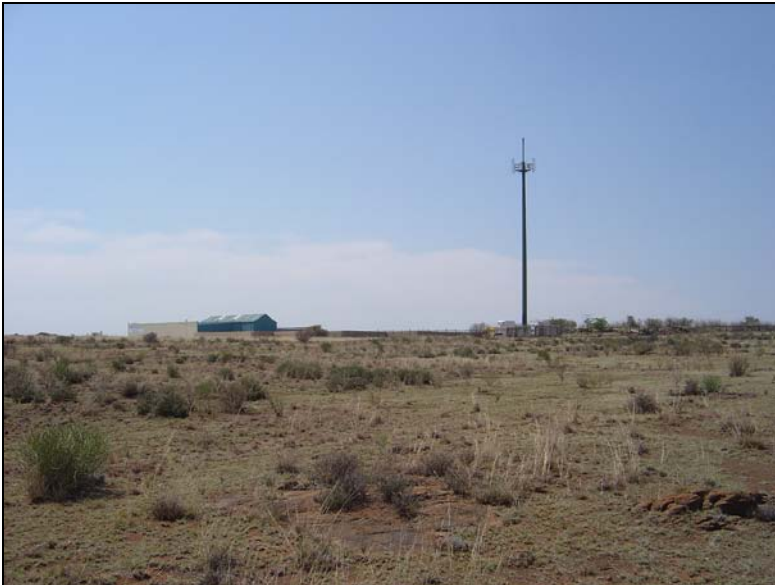
Fig.9 A view towards the Northridge Mall shopping centre, showing the MTN cellular phone mast.