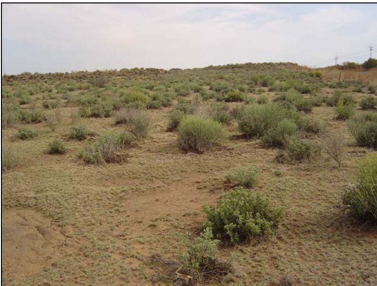
Fig.3 The vegetation on the hill along the R700 road is different.