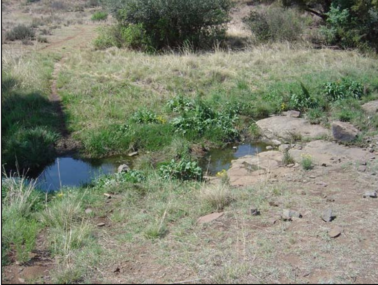
Fig.8 The stream bed in the kloof. It is unfortunate that sewerage water from the residential area is channelled into the stream.