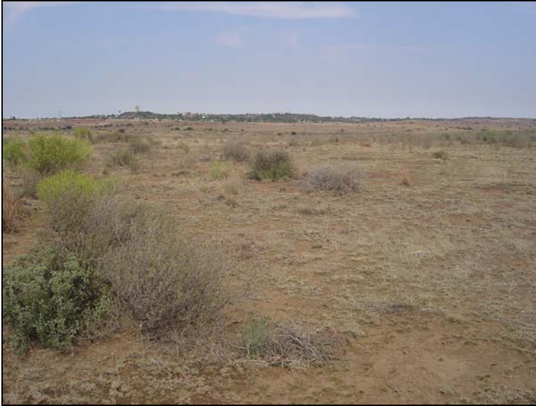
Fig.2 The same locality facing west away from the R700.