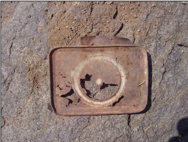
Fig.7 A lid of a beef tin. The heavy soldering indicates its origin from rations issued during the Anglo-Boer War (1899-1902).