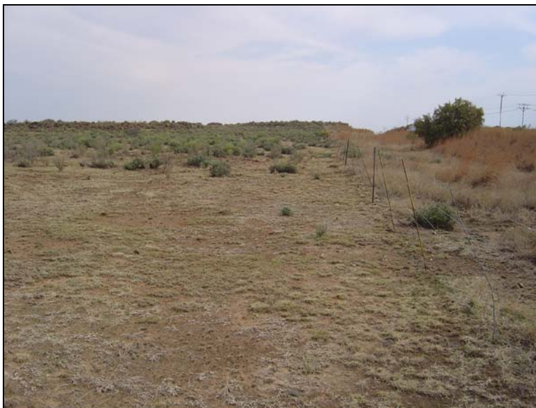
Fig.1 The south eastern corner of the property between Northridge Mall business complex and the R700 main road facing north west.