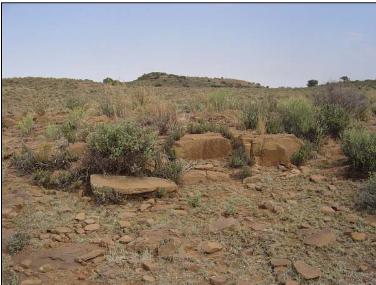
Fig.5 One of several dolerite outcrops on the site.