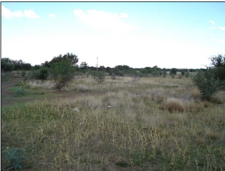
Fig.3 The proposed area of development on Bergkraal 2213, Bloemfontein.