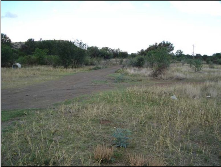
Fig.4 Another view the area of development.