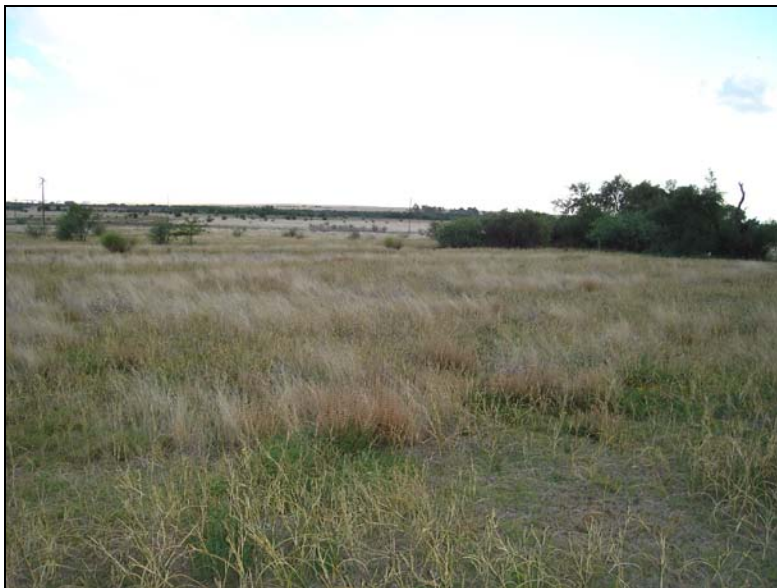
Fig.1 View of the proposed area of development at Bergkraal 2213, Bloemfontein.