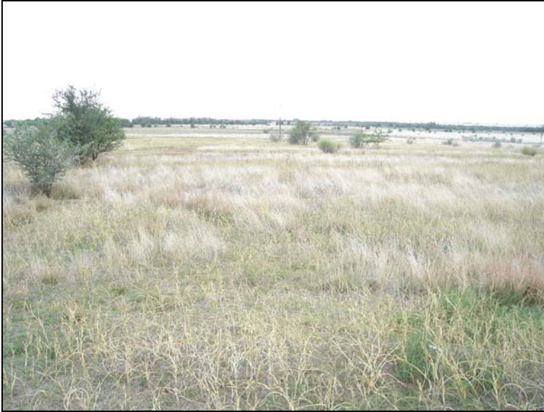
Fig.2 The proposed area of development facing towards the Modder River.