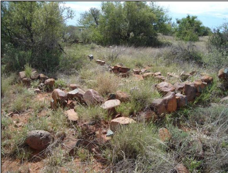
Fig.6 Remains of old labourer's houses.