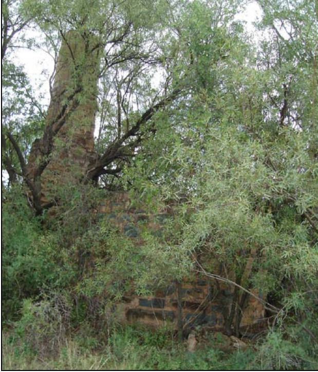
Fig.4 Water pump house.