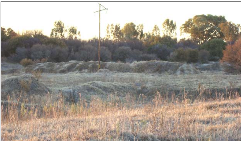
Fig.11 Alluvial soil deposit disturbed by agricultural activities over many years.