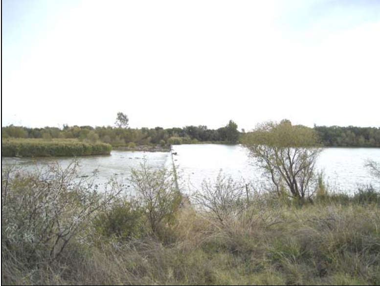
Fig.2 View of the Vaal River at Eiland Drif 763, Boshof.