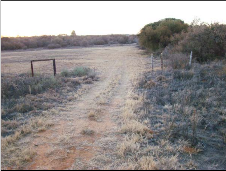
Fig.10 Eastern corner of development.