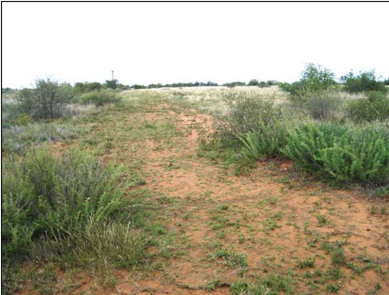
Fig.1 Red sand deposit at Eiland Drif 763, along the Vaal River near Boshof.