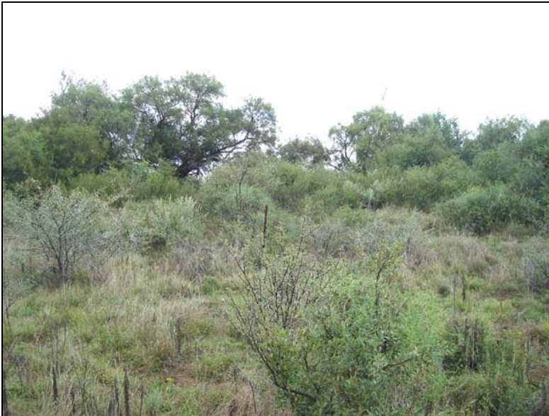
Fig.5 Border fence and vegetation along the River.