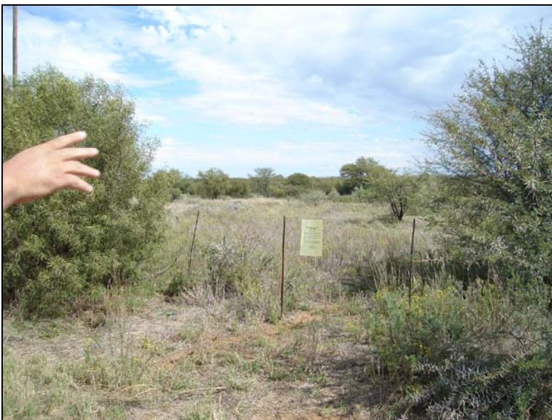
Fig.7 Border of Eiland Drif 763 and Idaho 1059.