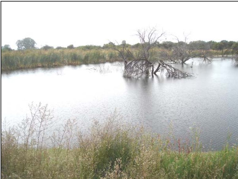
Fig.3 Fresh water spring at Eiland Drif 763, Boshof.