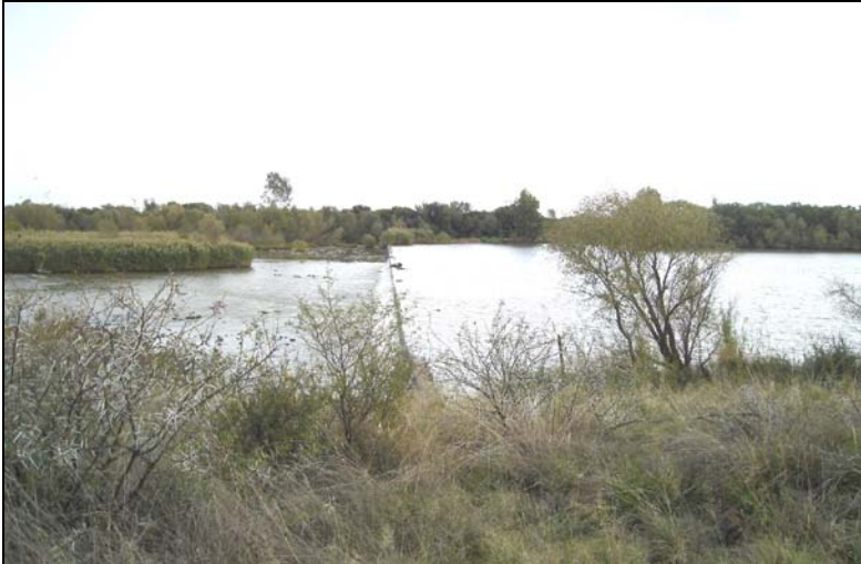
Fig.8 The weir in the Vaal River.