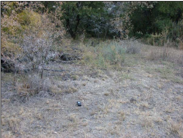
Fig.9 Northern point of the proposed development.