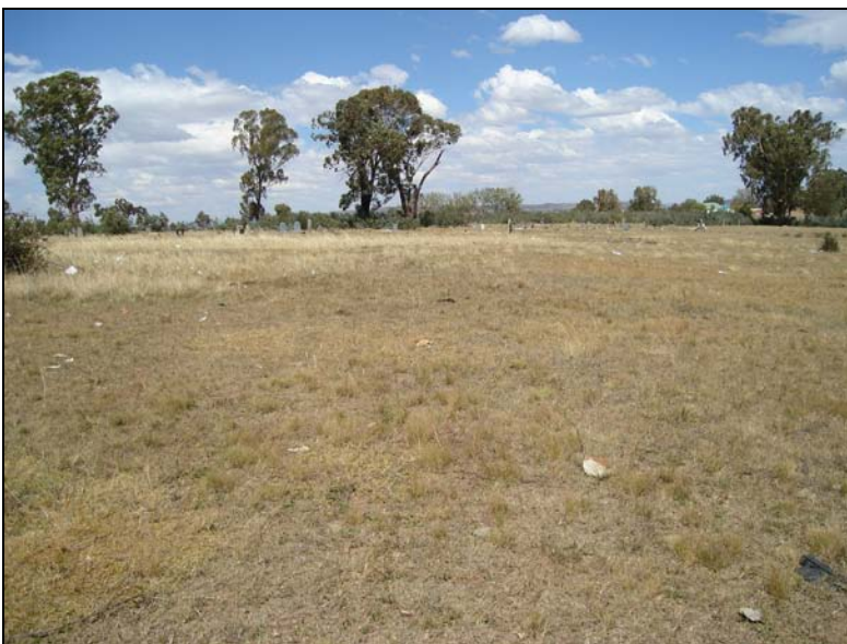
Fig.4 View from point B facing towards the cemetery.