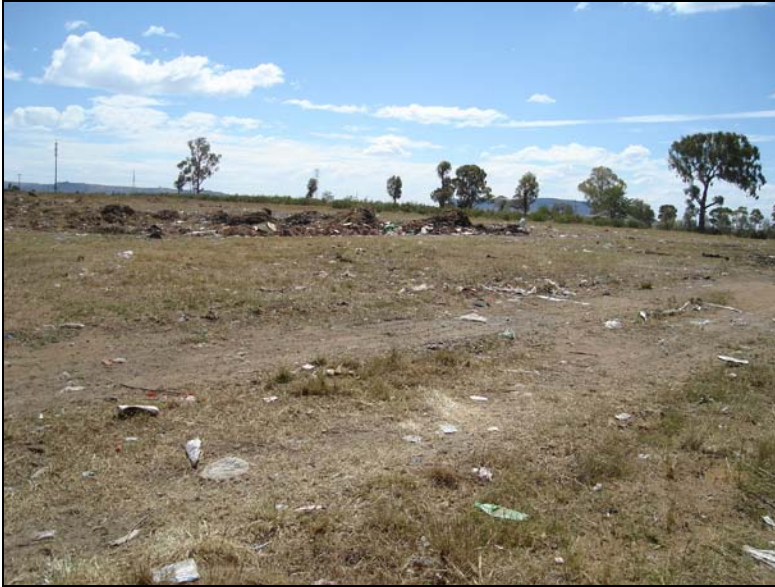
Fig.7 Refuse dumps occur in the area of development.