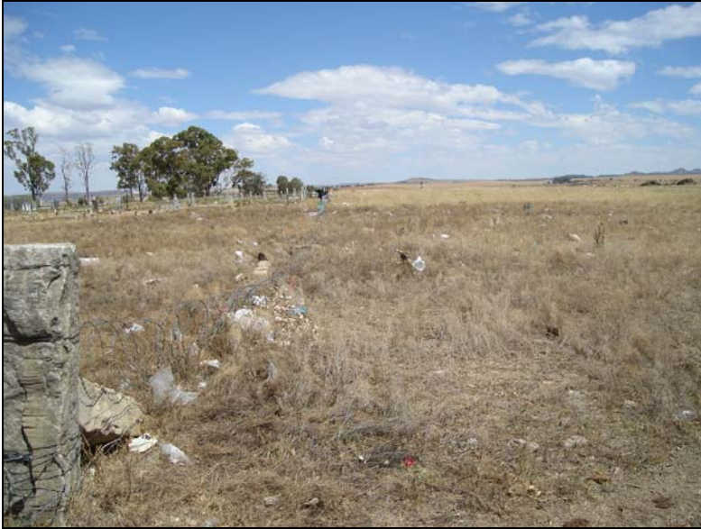
Fig.1 Point A at the eastern position adjacent to the cemetery.