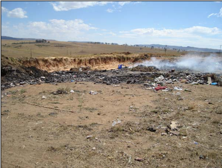
Fig.8 The rubbish dump in the area of development.