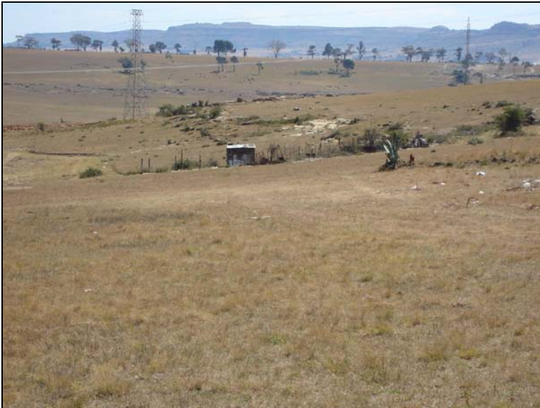
Fig.6 View from point C.