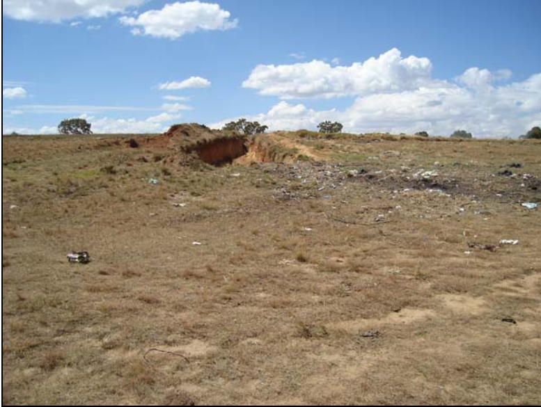
Fig.9 Another trench for refuse disposal in the proposed area of development.