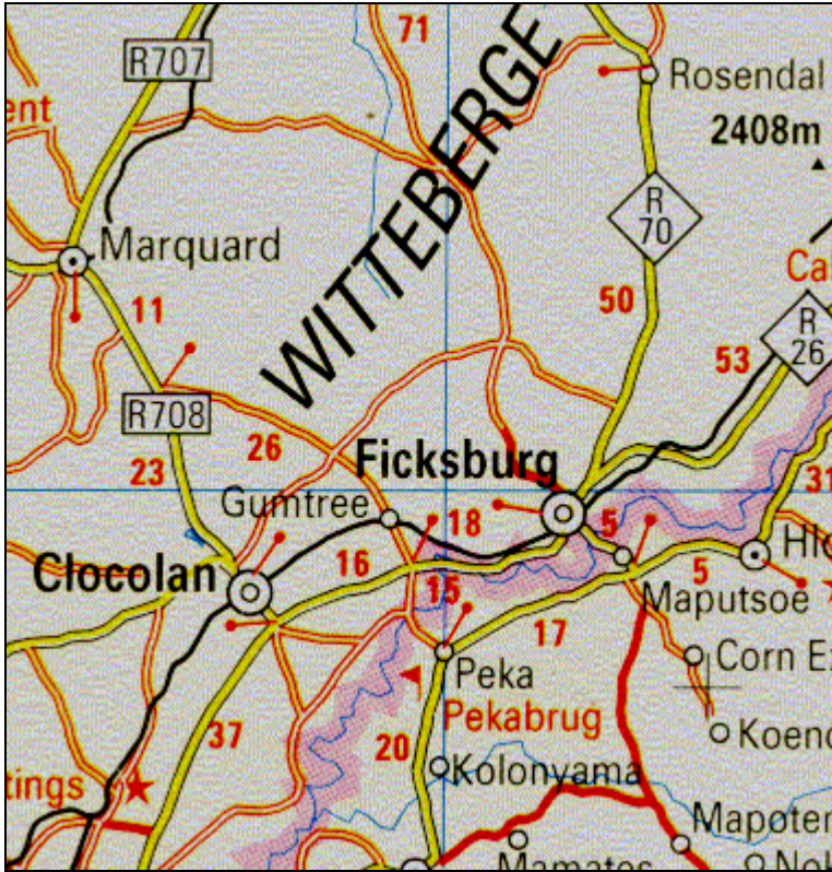
Map 1 Clocolan in relation to Marquard, Ficksburg and the Lesotho border.