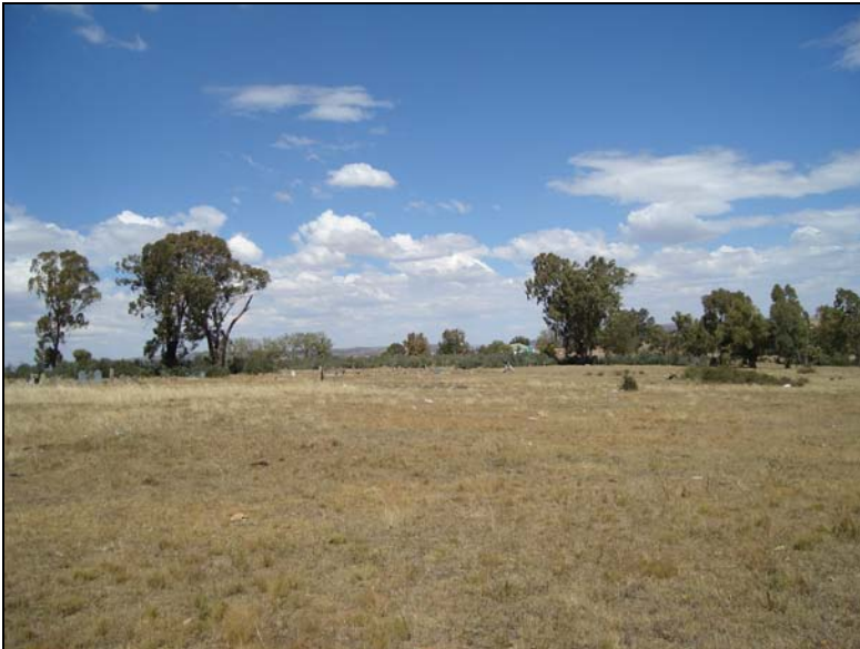
Fig.3 View from point B facing south.