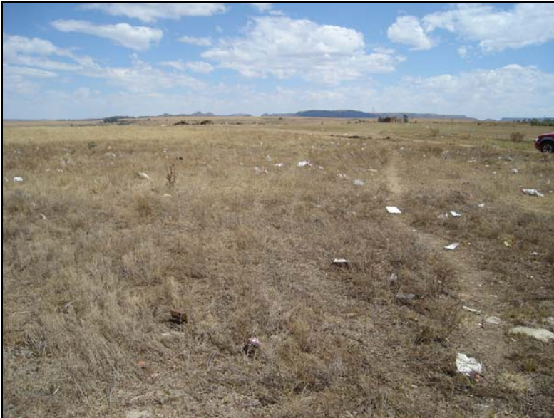
Fig.2 View of the proposed area at Point A facing west.