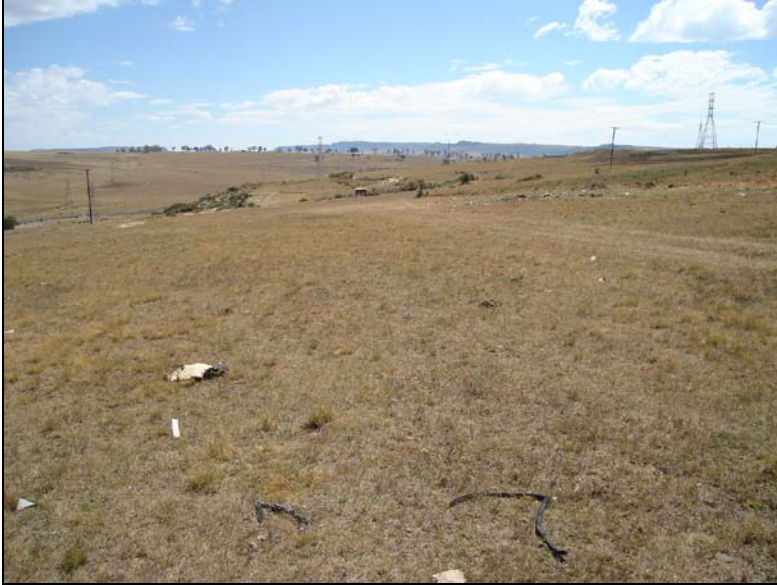
Fig.5 View from point C facing west.