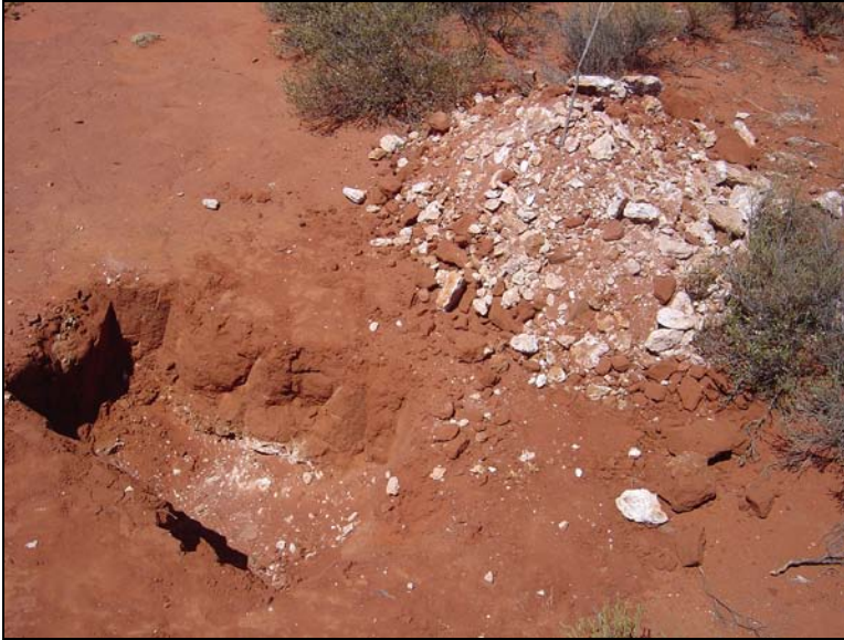
Fig.9 Red soil and calcrete from test pit.