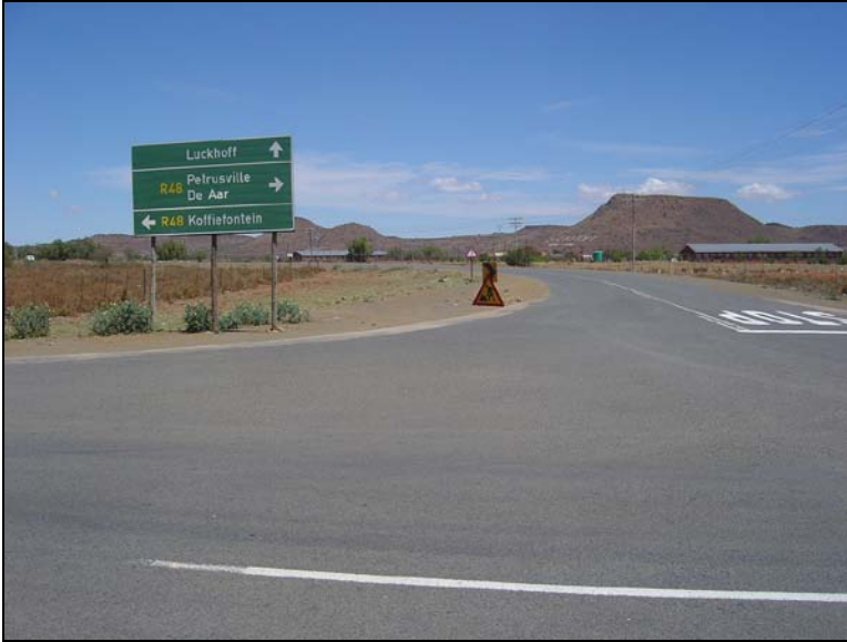
Fig.7 Crossing of the R48 & S572 outside Luckhoff forms the southern and western borders of the site.