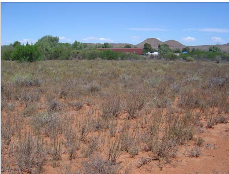
Fig.8 General view of the vegetation at the site.