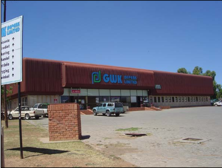
Fig.1 View of the GWK shopping centre on the outskirts of Luckhoff.