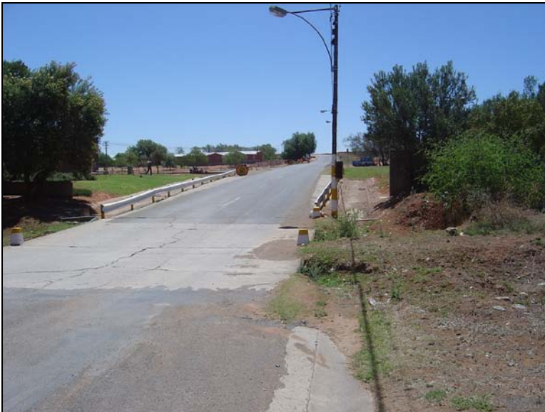
Fig.2 View along the S572 entrance road from the R48 main road facing west.