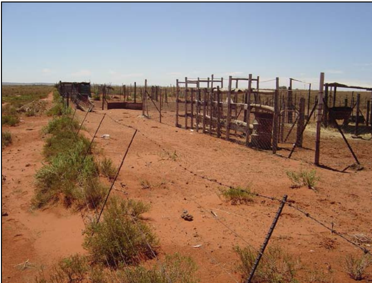
Fig.6 Temporary cattle kraals in the area.