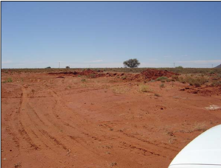
Fig.10 Sand quarry in the area.