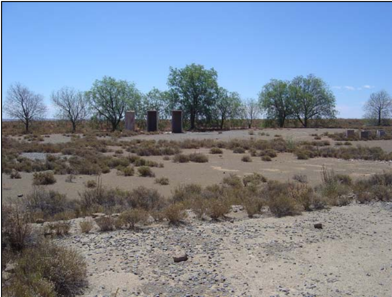
Fig.3 Remains of an old road camp.