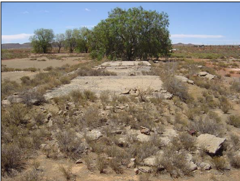
Fig.4 Floors of former pre-fabricated housing at the old road camp.