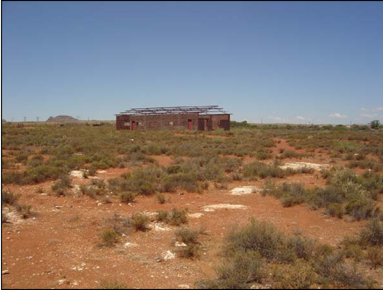
Fig.5 Shed for unknown purpose in the proposed area.