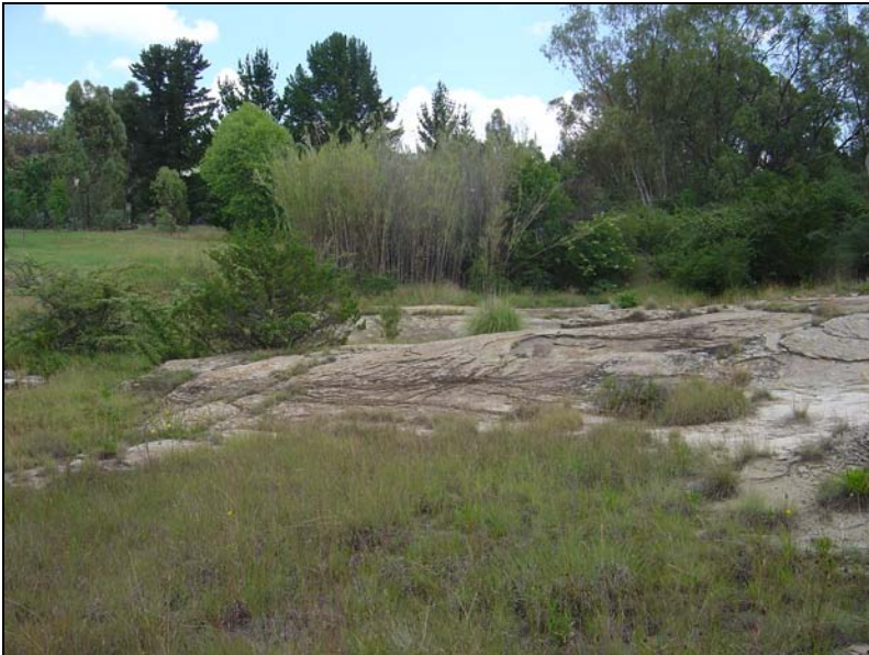
Fig.6 A view on the bare rock bottom of the streambed.