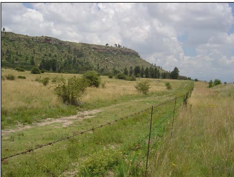
Fig.7 A view of the land at the foot of Stafford Hill, also proposed for development.