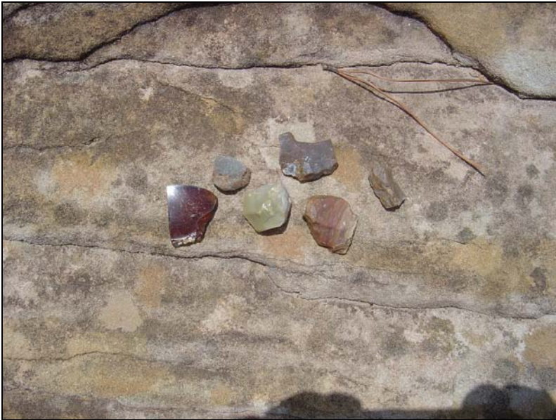
Fig.5 Later Stone Age flakes and a piece of glass on the sandstone bedrock of the stream...