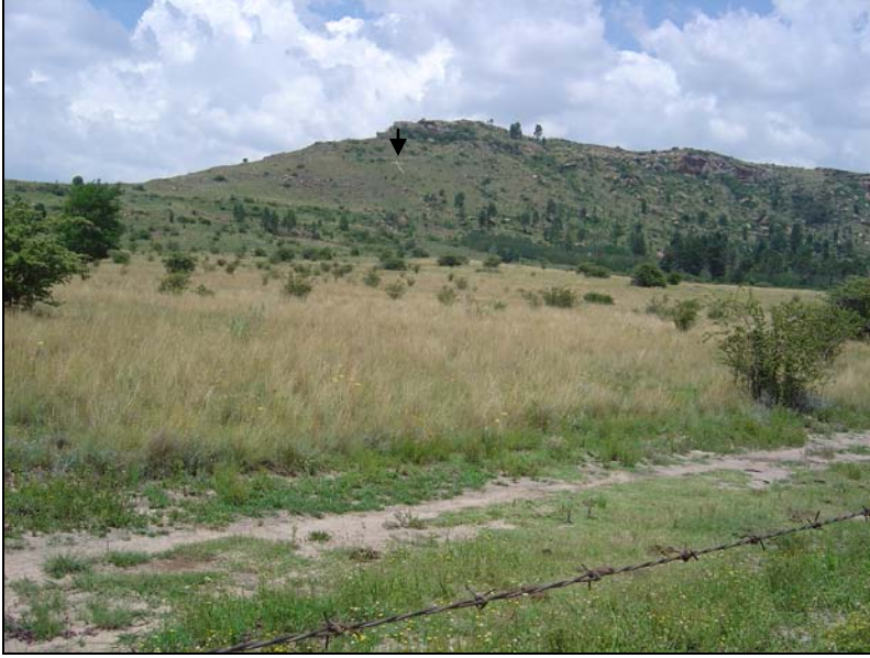
Fig.8 View of the mountain slope. Position of white cross indicated by arrow.