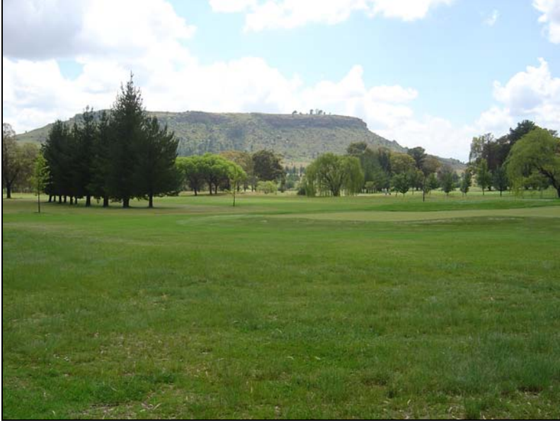
Fig.4 View across the golf course with Stafford's Hill in the background.