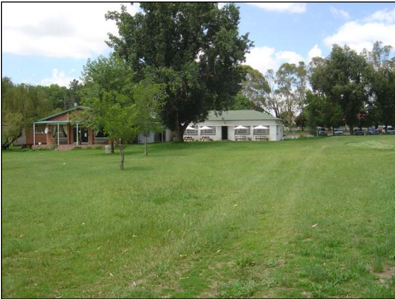
Fig.3 The club house at the golf course.