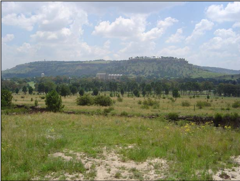
Fig.11 View from the site towards Ficksburg. Imperani mountain in the rear.