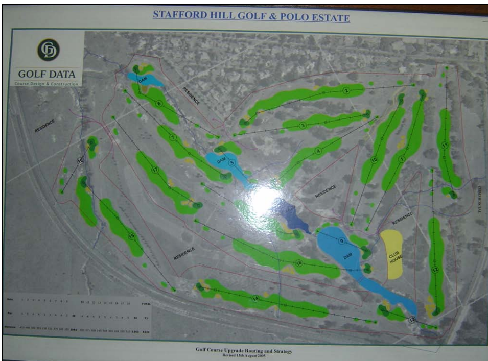
Fig.1 Plan of the Stafford Hill Golf & Polo Estate at Ficksburg.