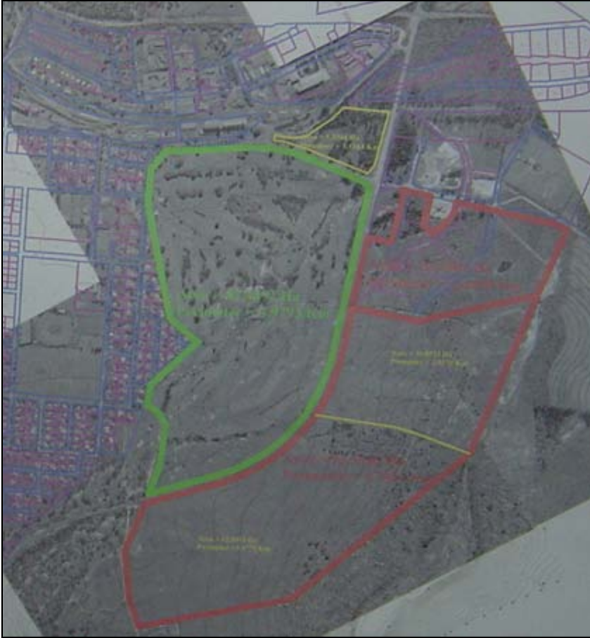
Fig.2 Proposed new developments at the Stafford Hill Golf & Polo Estate, Ficksburg.