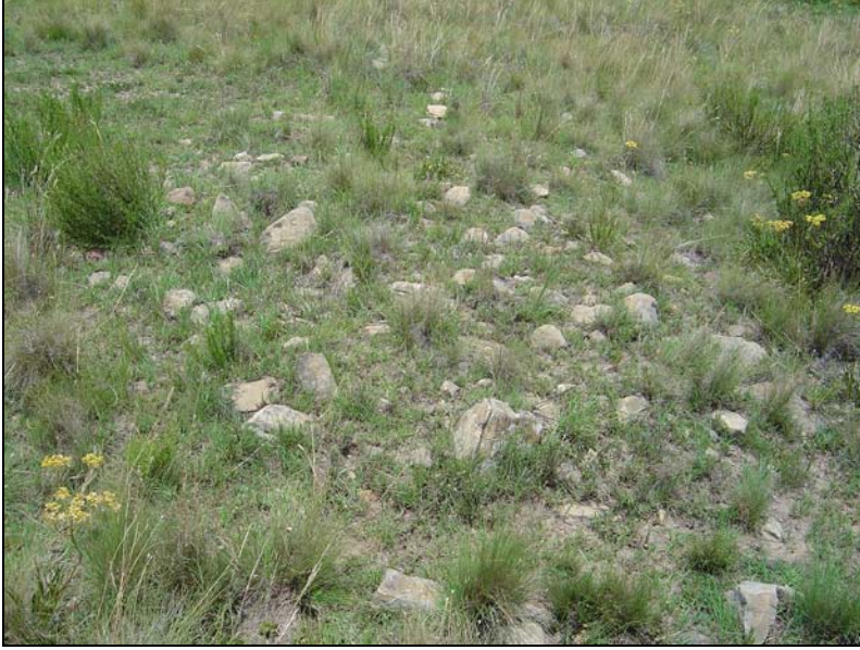
Fig.10 More stone remains visible on surface.