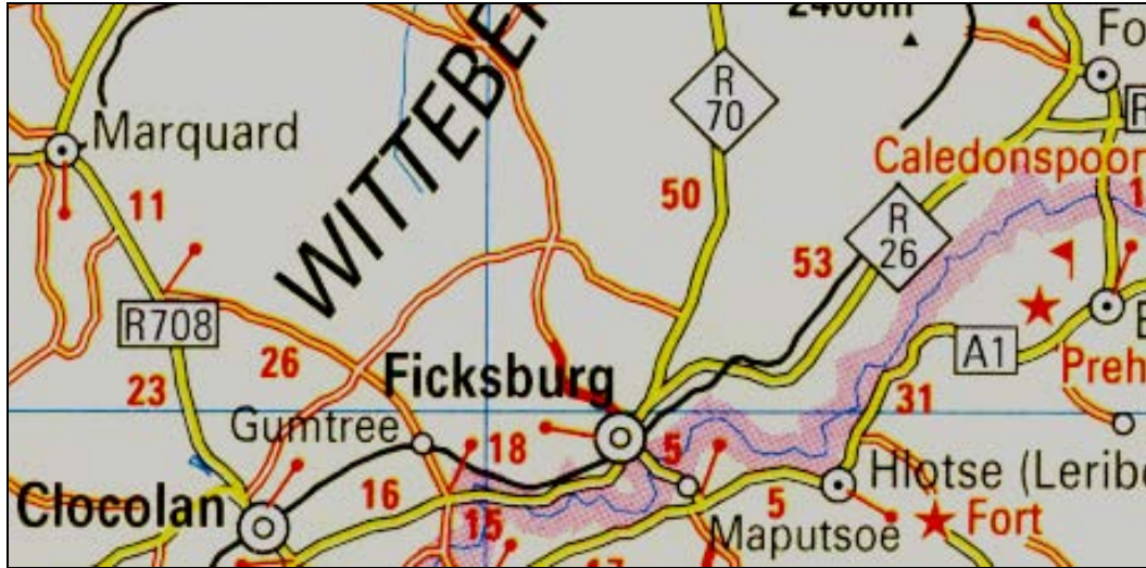
Map 1 Locality of Ficksburg in relation to Marquard, Clocolan, Fouriesburg and Lesotho.