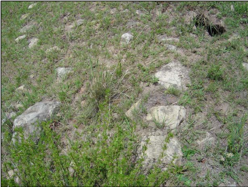
Fig.9 Foundation of stone-wall on surface.