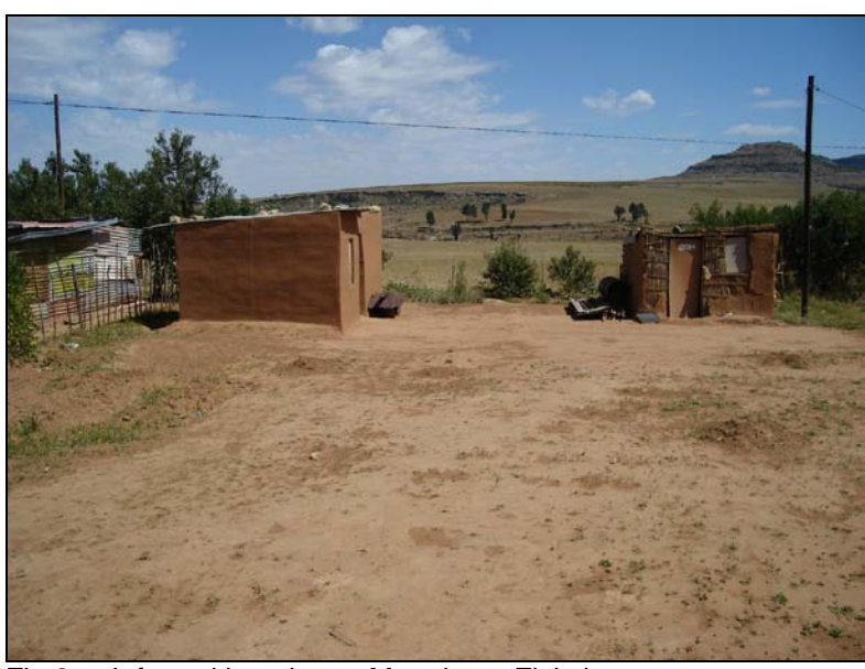
Fig.2 Informal housing at Meqeleng, Ficksburg.