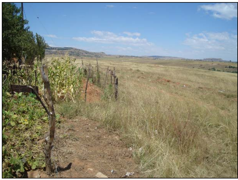
Fig.5 Unofficial extension of the house stands on the outskirts of the township.