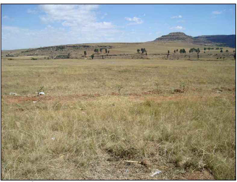
Fig.4 Open grazing fields adjacent to the township extension.