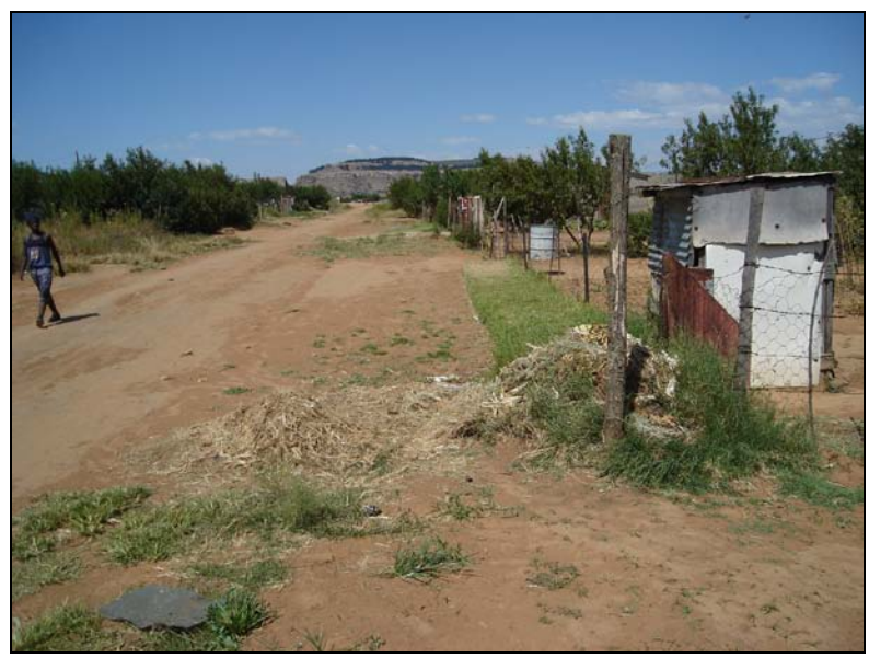
Fig.1 The informal settlements at Meqeleng, Ficksburg.