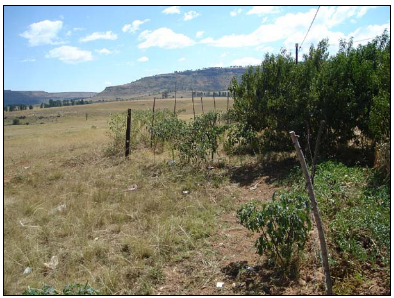
Fig.3 Gardening on the outskirts at Meqeleng, Ficksburg.