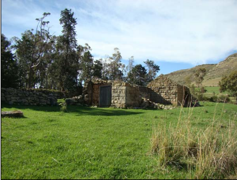
Fig.6 Point H at Dankbaar 294, Fouriesburg facing north.