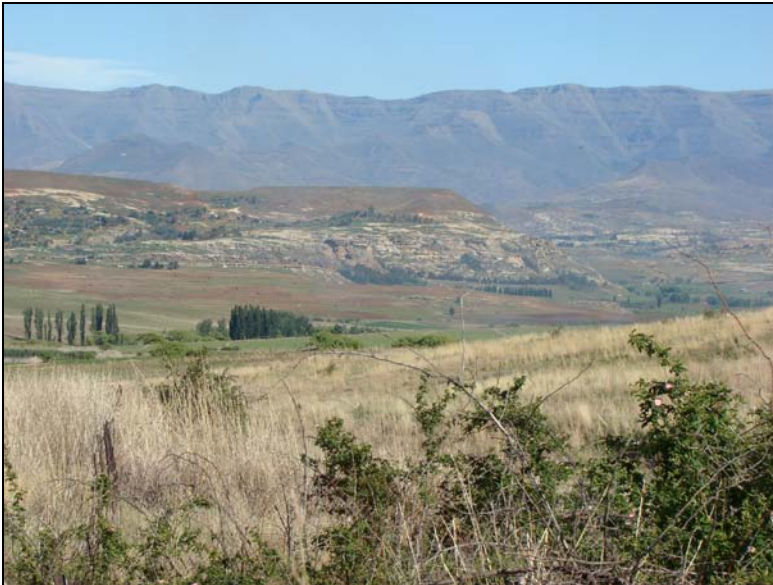
Fig.5 Point G at Dankbaar 294, Fouriesburg facing south.