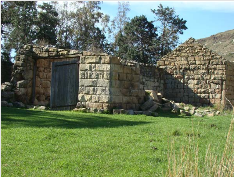
Fig.7 Old buildings at Dankbaar 294 Fouriesburg.