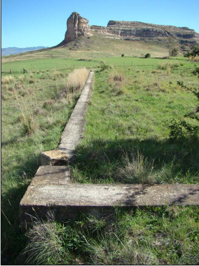
Fig.12 Old foundations at Dankbaar 294 Fouriesburg.