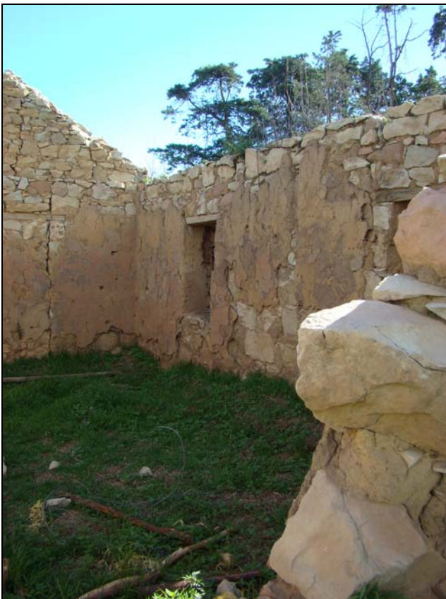
Fig.9 Old buildings at Dankbaar 294 Fouriesburg.