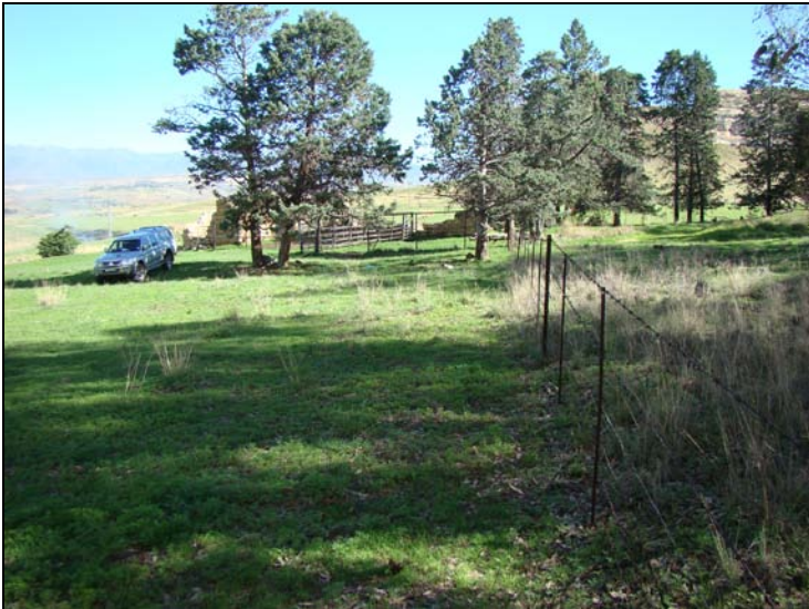
Fig.2 Point C at Dankbaar 294, Fouriesburg facing south.