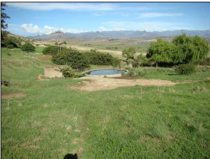
Fig.13 Water reservoir and windmill at Dankbaar 294, Fouriesburg facing east.