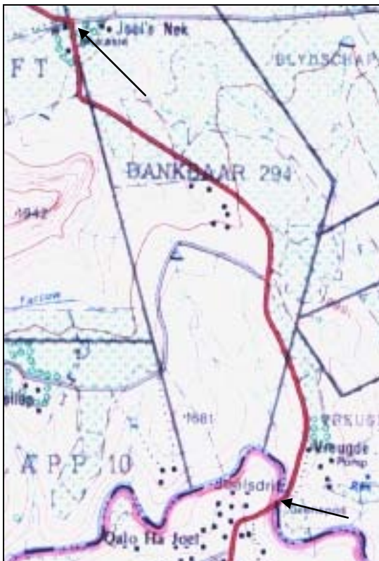
Map 2 Dankbaar 294 in relation to neighbouring farms. Note the S26 road from Joelsnek to Joels Drift (2828CB 1987).