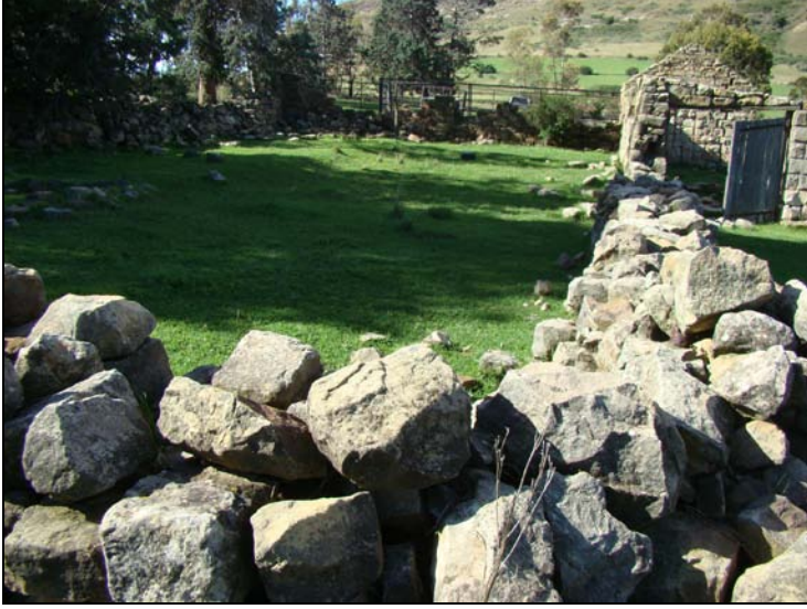
Fig.10 Old kraal walls at Dankbaar 294 Fouriesburg.