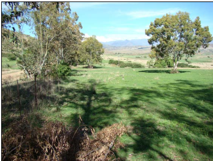
Fig.1 Point C at Dankbaar 294, Fouriesburg facing east.