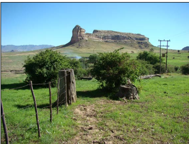
Fig.3 Point D at Dankbaar 294, Fouriesburg facing south.