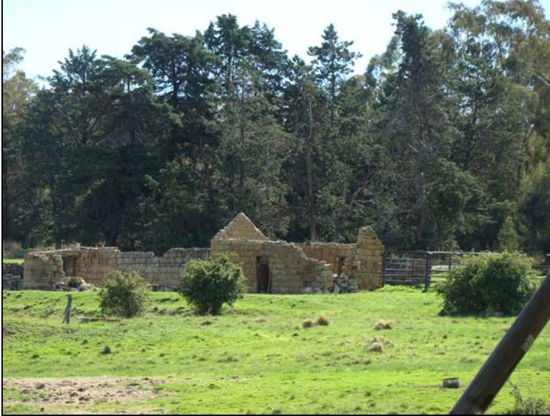
Fig.4 Point D at Dankbaar 294, Fouriesburg facing west towards the old buildings.