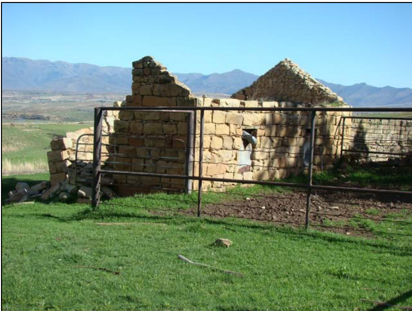
Fig.11 Old buildings and stock crush-pen at Dankbaar 294 Fouriesburg.