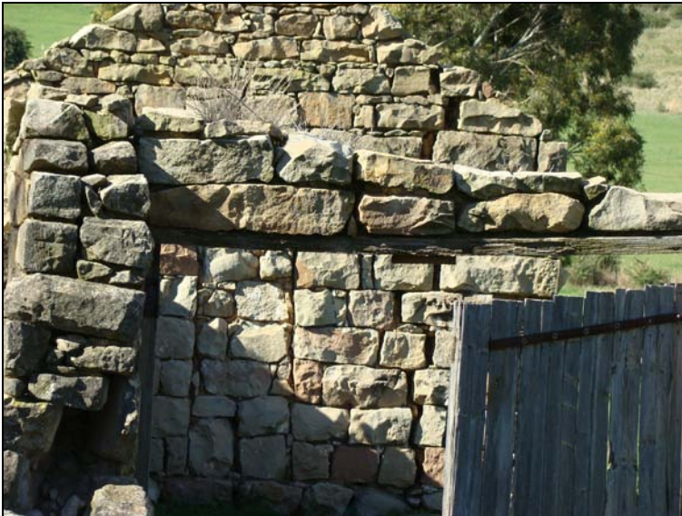
Fig.8 Old buildings at Dankbaar 294 Fouriesburg.