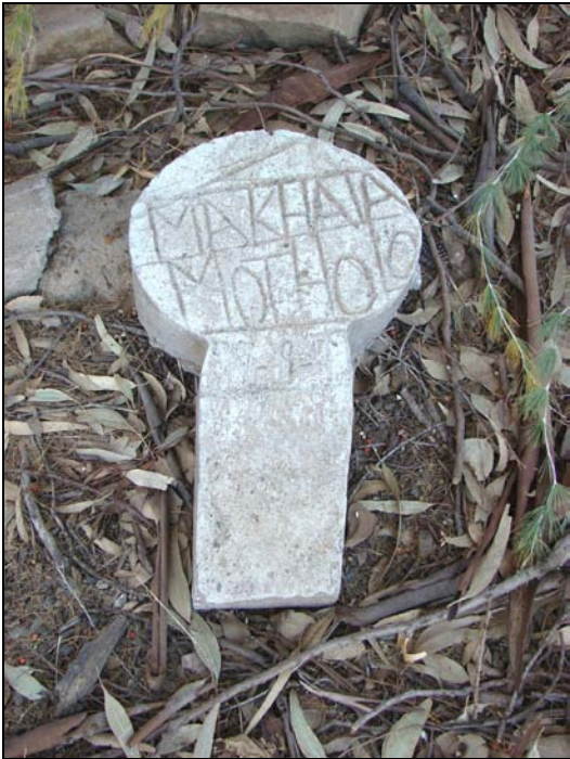
Fig.5 Grave of Makhata Motholo at Waagstuk 136, Heilbron.