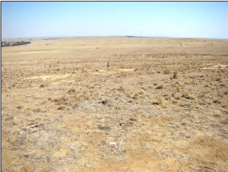
Fig.2 Point A facing west.