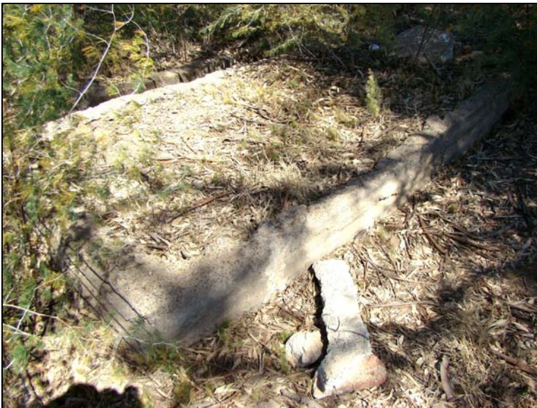
Fig.6 An unmarked grave at Waagstuk 136, Heilbron.