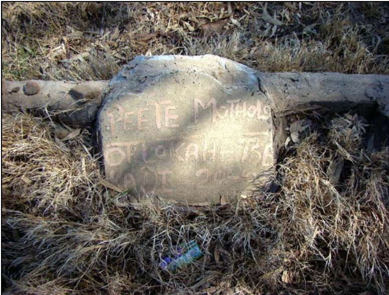
Fig.8 The grave of Peete Motholo at Waagstuk 136, Heilbron.