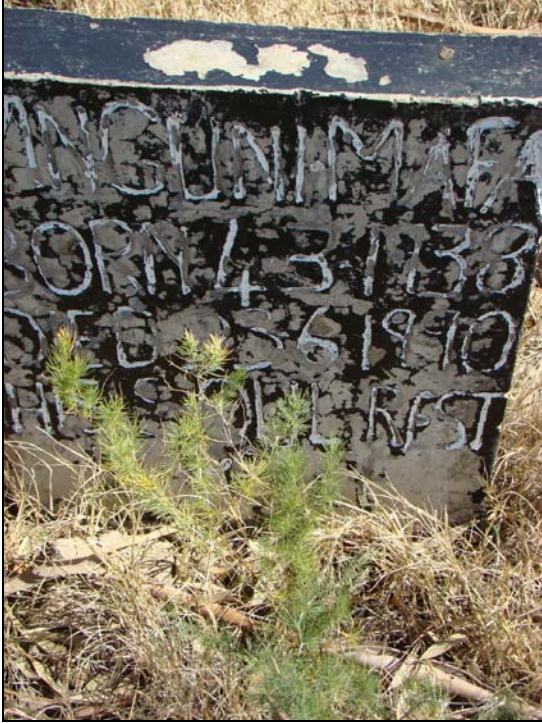
Fig.7 The grave of Mnguni Mafa Born 4/3/1938 Died 23/6/1990.