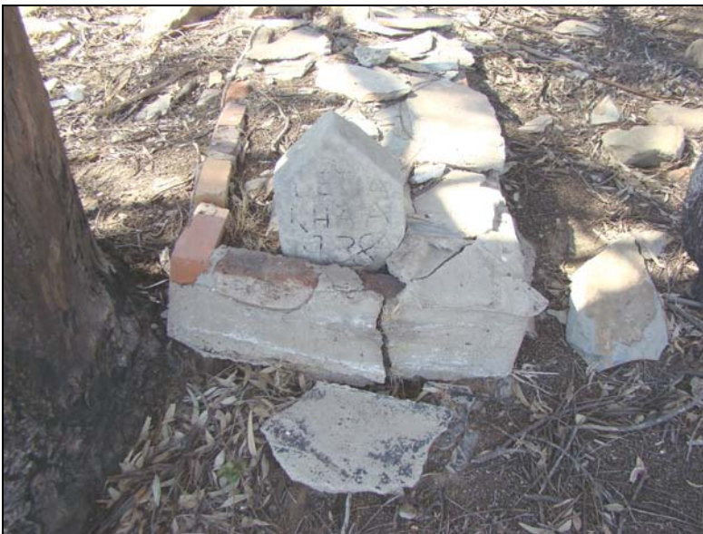
Fig.4 The grave of Letia Khaa 1938 at Waagstuk 136, Heilbron.