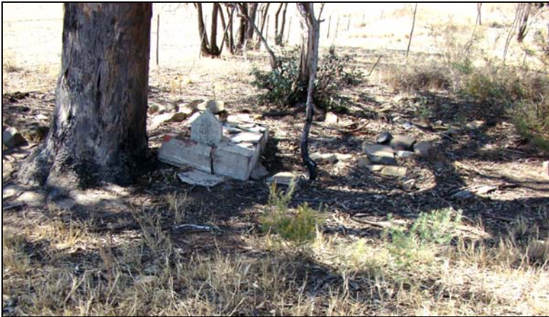
Fig.3 A cluster of about 25 graves at Waagstuk 136, Heilbron.