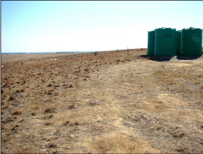
Fig.1 Point A facing north.