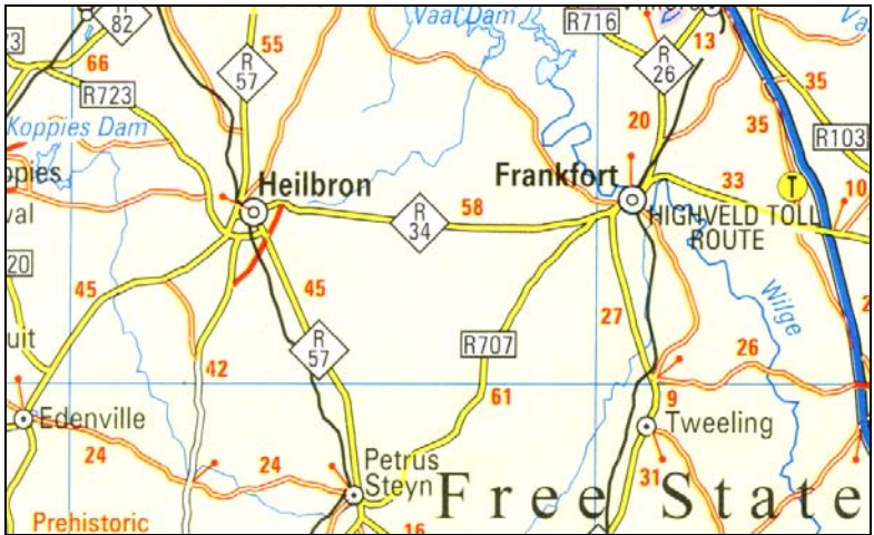
Map 1 Locality of Heilbron, Free State.