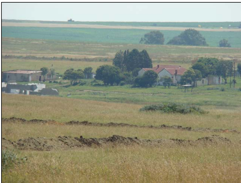
Fig.8 Old farm house on the farm Paisley 73 outside Frankfort.