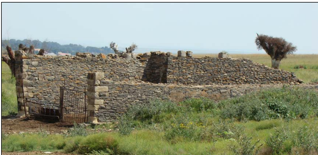
Fig.10 Stock kraal at the farm Paisley 73, Frankfort.