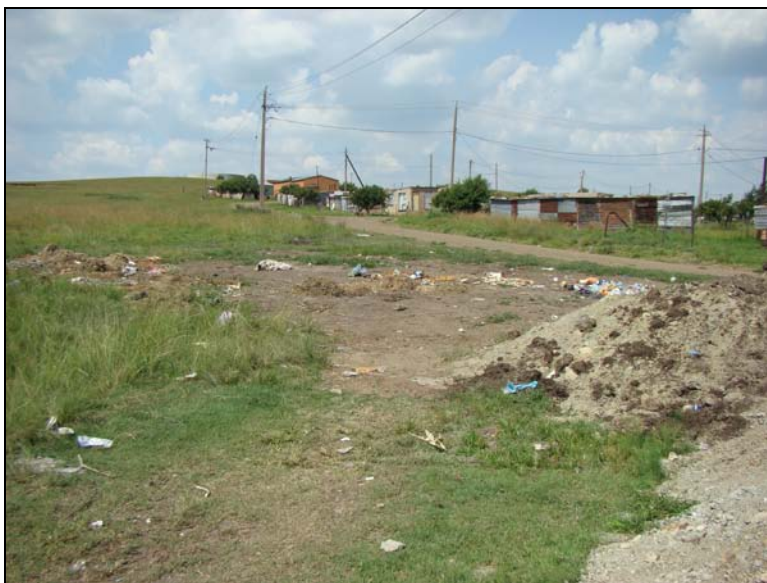
Fig.2 Point A facing east.