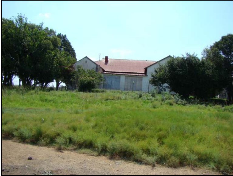
Fig.9 Eastern view of the old farm house on Paisley 73 outside Frankfort.