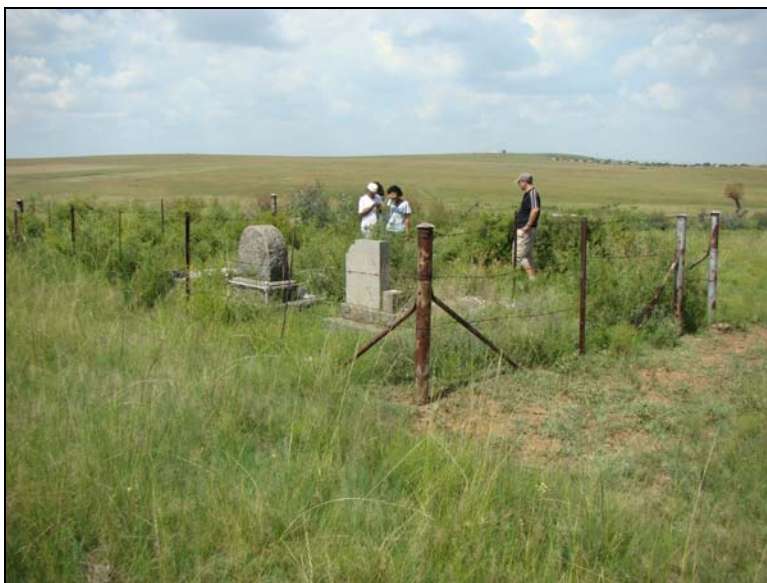
Fig.4 The graveyard on the western periphery of the proposed site.