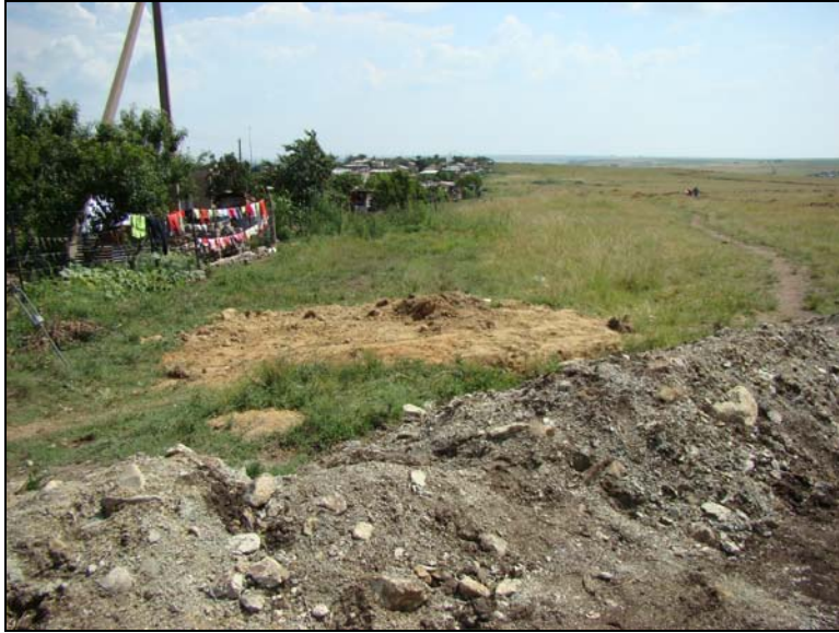
Fig.1 View from Point A along the outskirts of the existing township of Namahadi.