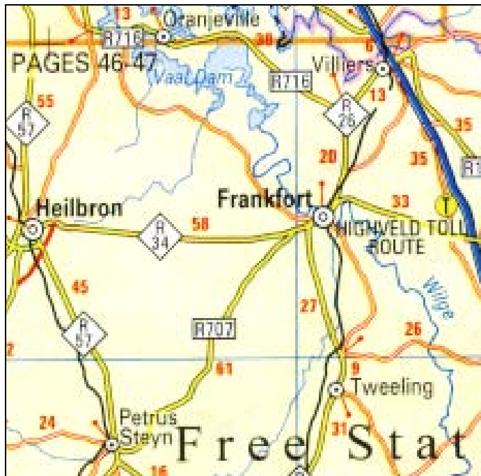
Map 1 Frankfort in relation to Petrus Steyn, Tweeling, Heilbron and Villiers.