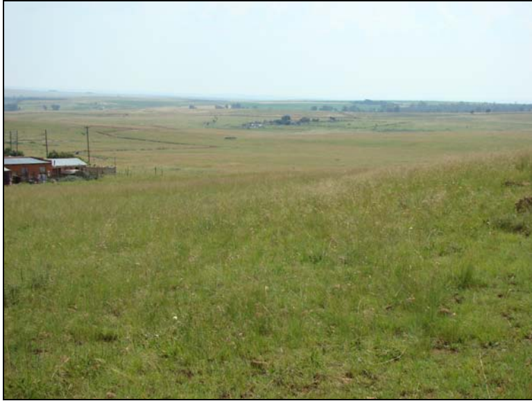
Fig.3 View from point B facing west across the area of development.