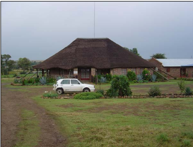
Fig.6 Existing facilities at the site near Koppies.