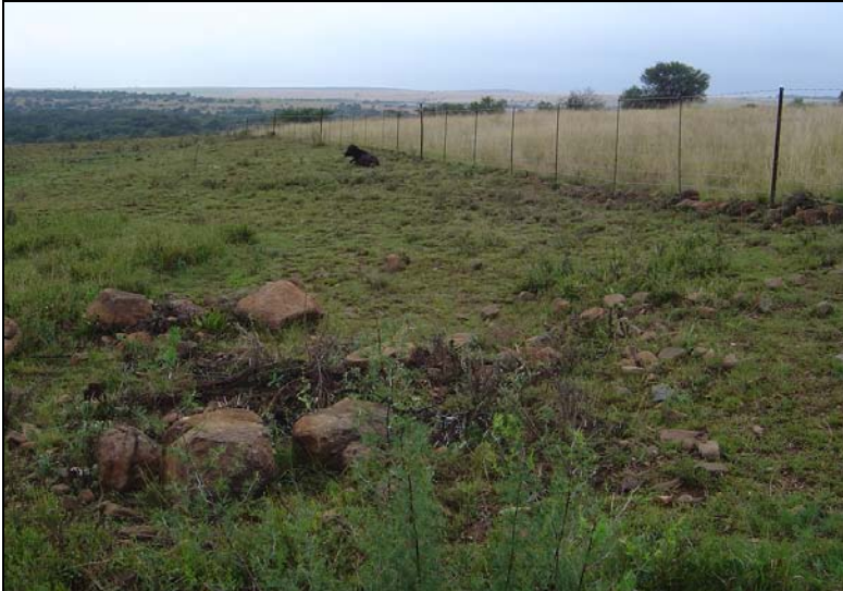
Fig.5 The area of development facing south.