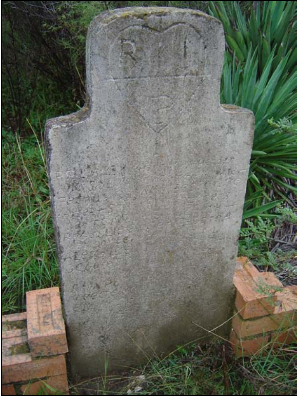
Fig.11 One of the graves some way from the development site.