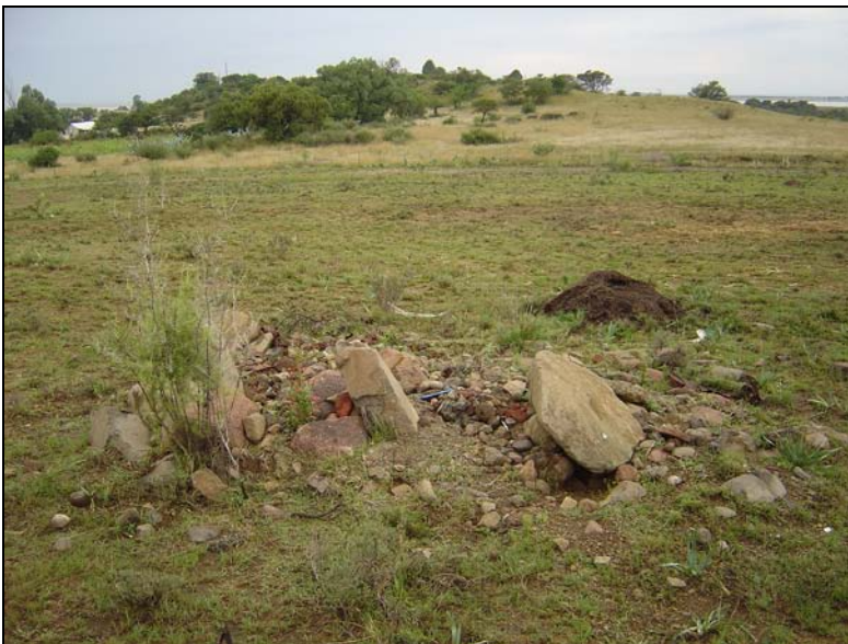
Fig.2 View of the area of development facing the hill.