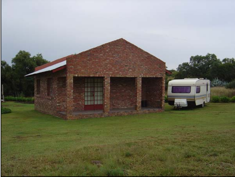
Fig.7 Sleeping facilities at Koppies.