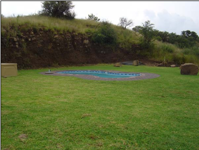
Fig.8 The swimming pool.