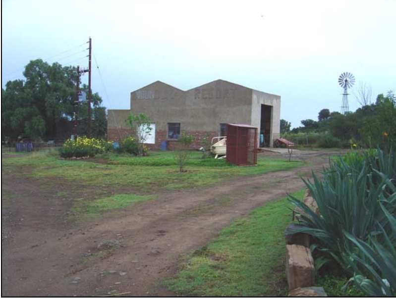
Fig.9 The farm buildings.