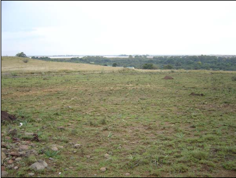
Fig.1 The proposed area of development. Koppies Dam in the back ground.