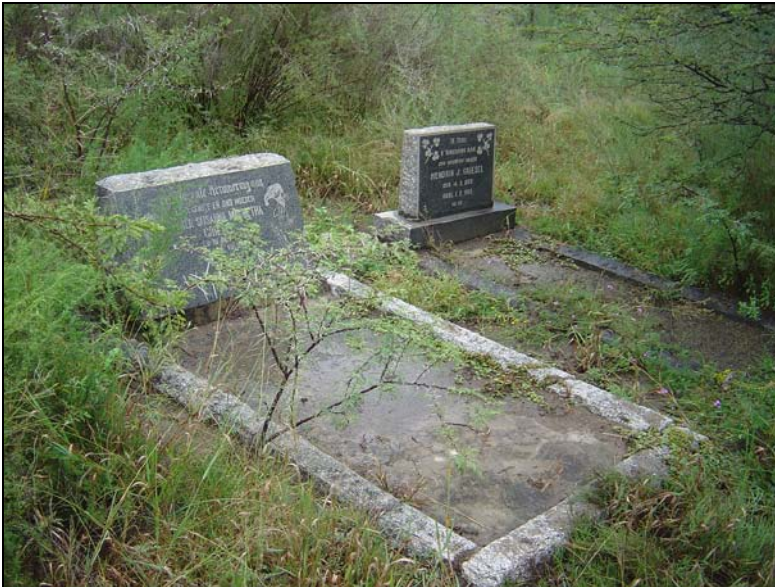
Fig.12 More graves at the site.