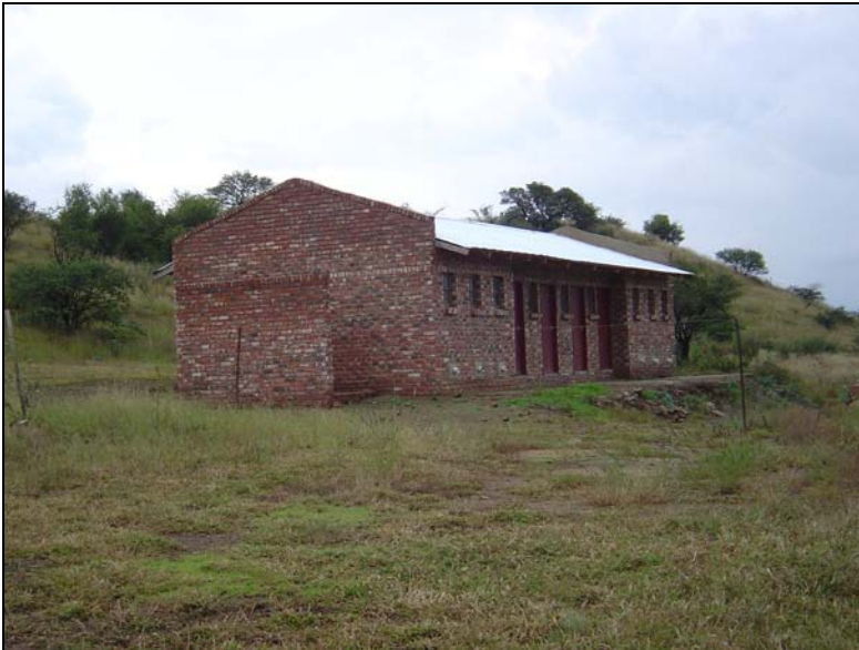
Fig.10 Existing ablation facilities at the site.