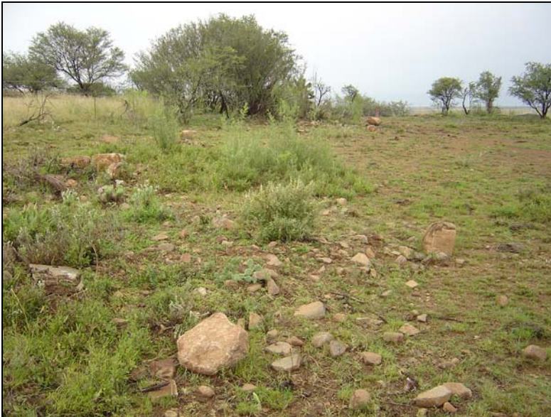
Fig.4 Disturbed area and debris at the site.