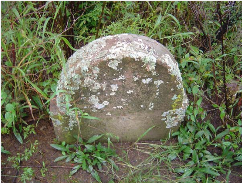
Fig.14 A very old grave at the site.