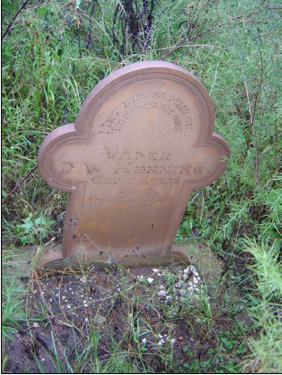
Fig.13 An old grave at the site.