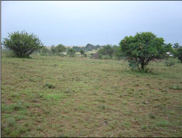
Fig.3 Trees and grass cover at the site.