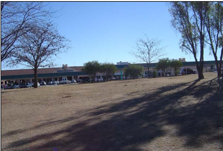
Fig.2 The filling station will become part of the existing shopping centre in the back ground.