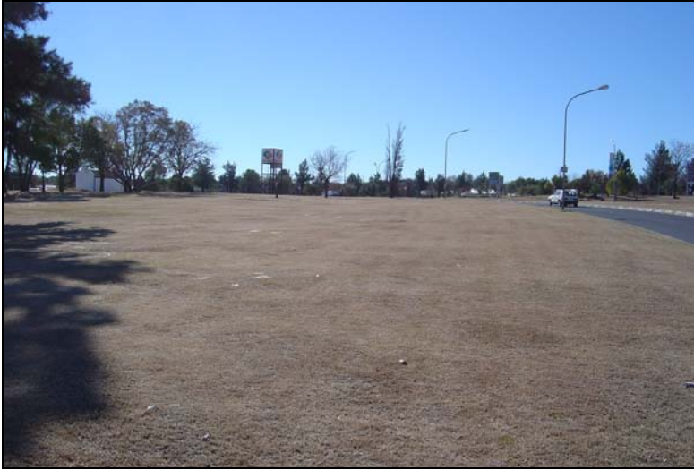
Fig.1 View of the area proposed for the development of a filling station at Kroonstad.