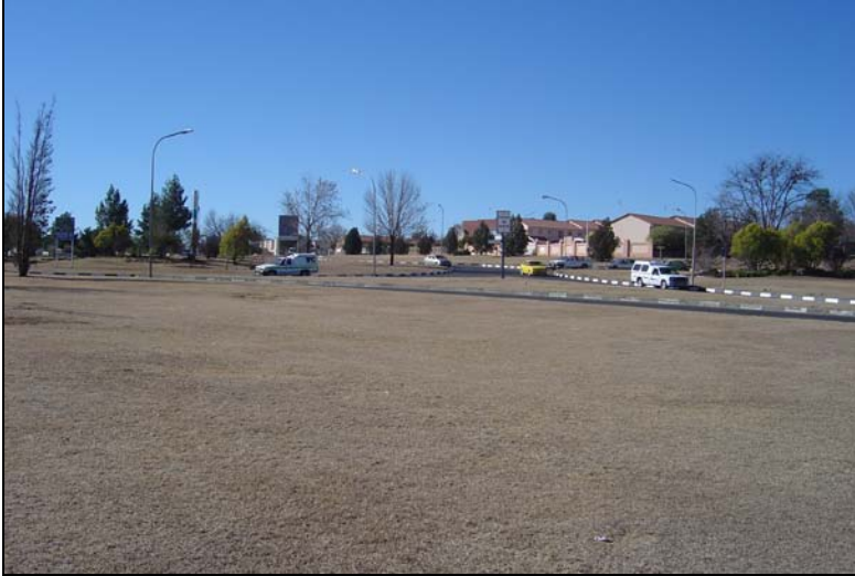
Fig.3 Traffic circle opposite the Hacienda Hotel, Kroonstad.