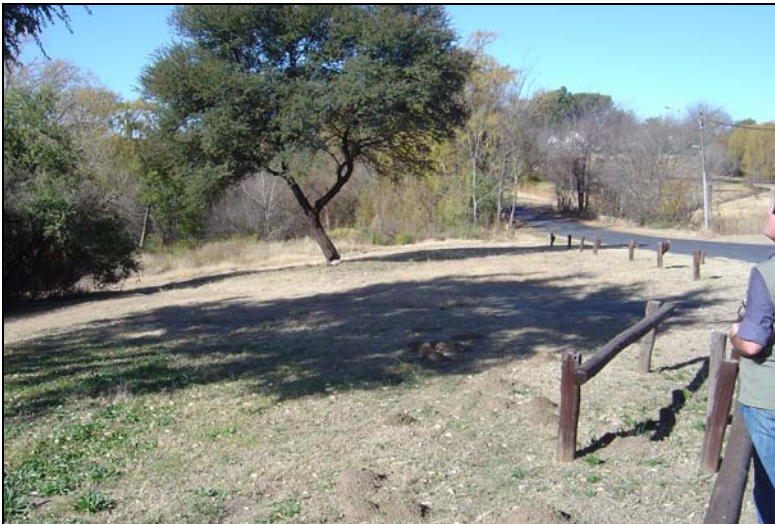
Fig.3 Van Riebeeck Park, Kroonstad. Van der Lingen Street on the right.