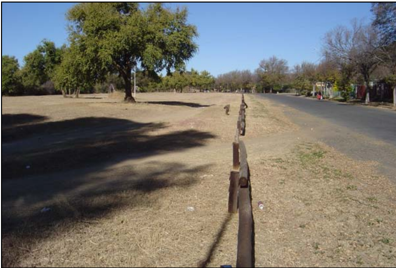
Fig.1 View of Van Riebeeck Park along Van der Lingen Street, Kroonstad.