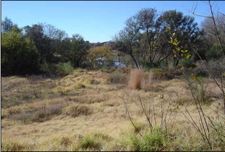
Fig.4 General view of the area along the Vals River.