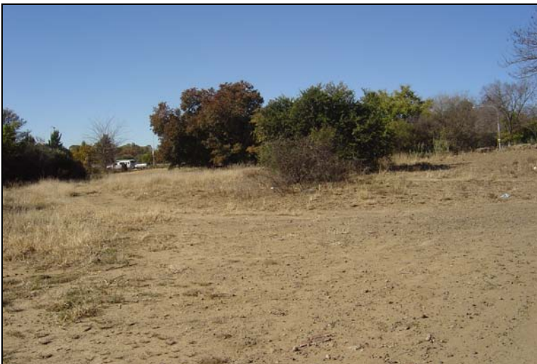
Fig.7 Eastern end of the land earmarked for development at Kroonstad.