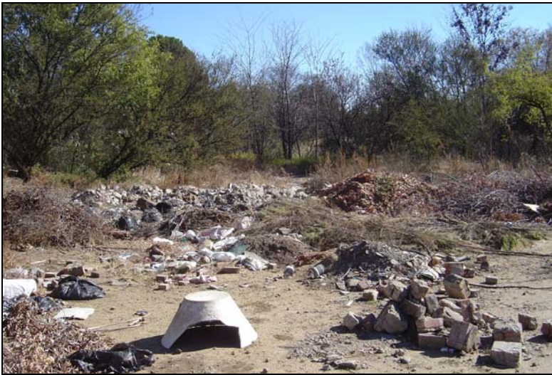
Fig.6 State of littering along the southern bank of the Vals River.