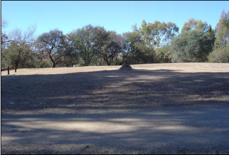
Fig.2 Van Riebeeck Park, Kroonstad facing the Vals River.