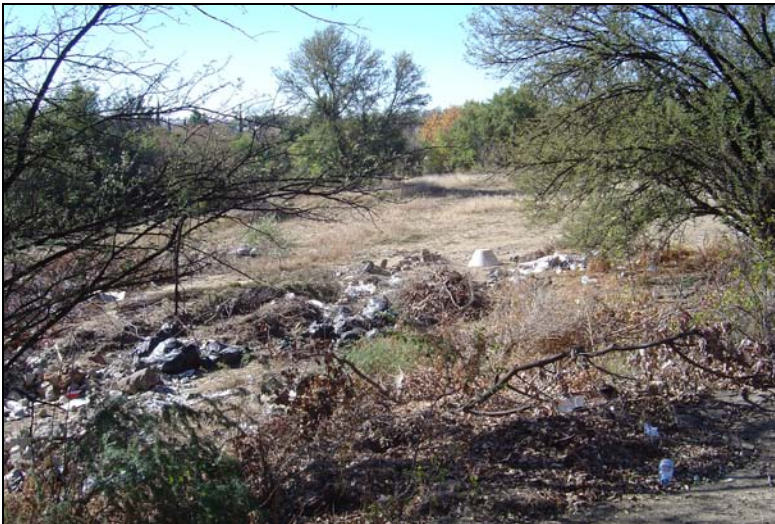
Fig.5 Litter along the Vals River, Kroonstad.