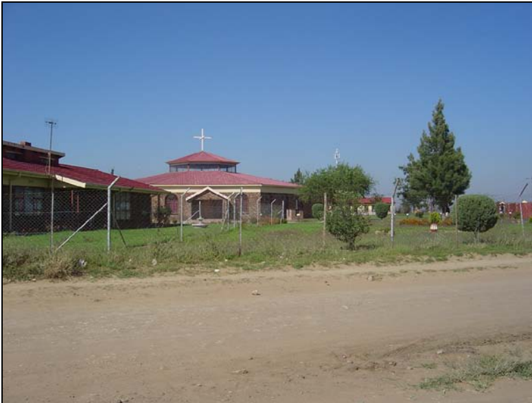
Fig.2 Church in existing part of township of Maokeng.