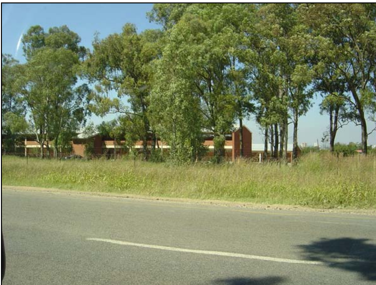
Fig.3 School opposite Hospital.