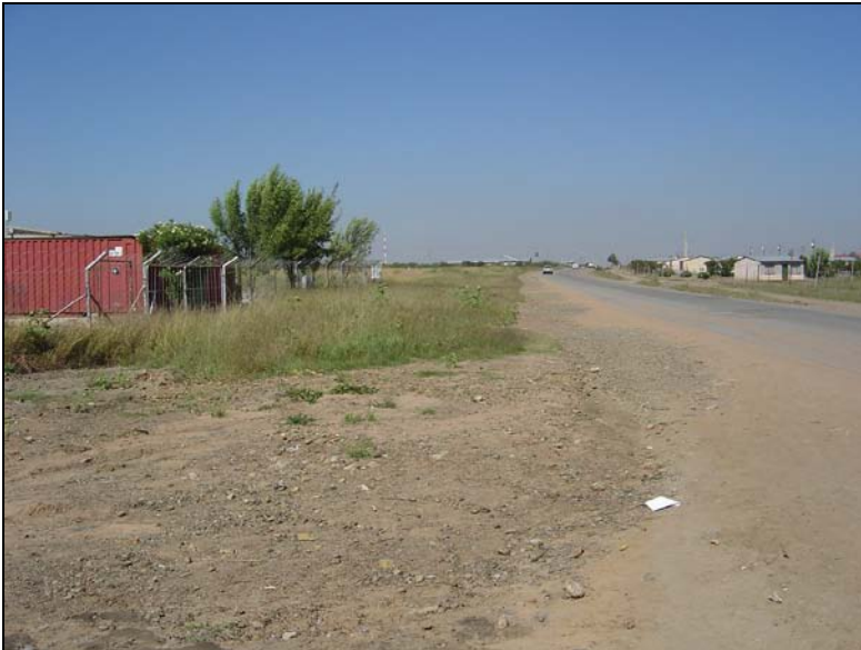
Fig.7 Brickworks in existing township at Maokeng.