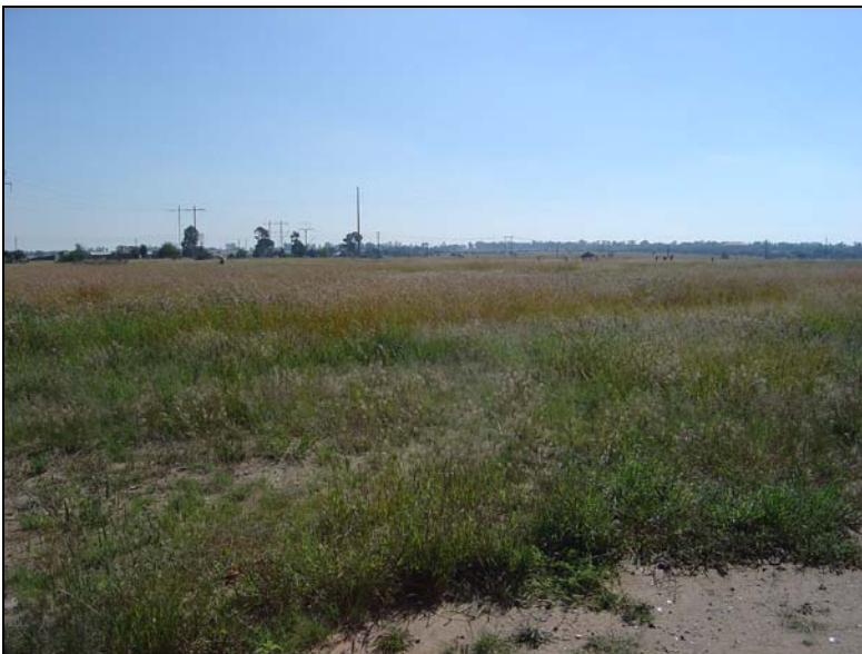
Fig.5 view of the lang proposed for development at Maokeng, Kroonstad.