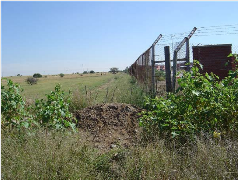
Fig.4 View of the area adjacent to hospital.