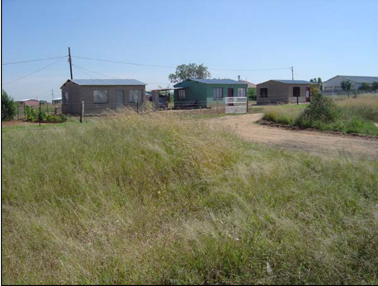
Fig.6 Existing township adjacent to proposed developments at Maokeng.