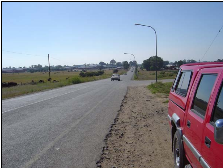
Fig.1 View at point A6 looking back towards Kroonstad.