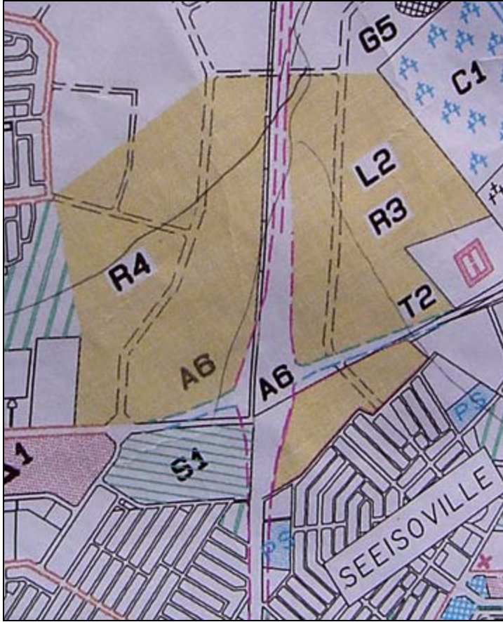
Map 3 Locality of the land proposed for development.