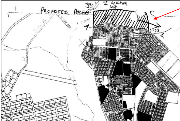
Map 3 Locality of the proposed housing developments at Ladybrand. GPS points indicated A-D.