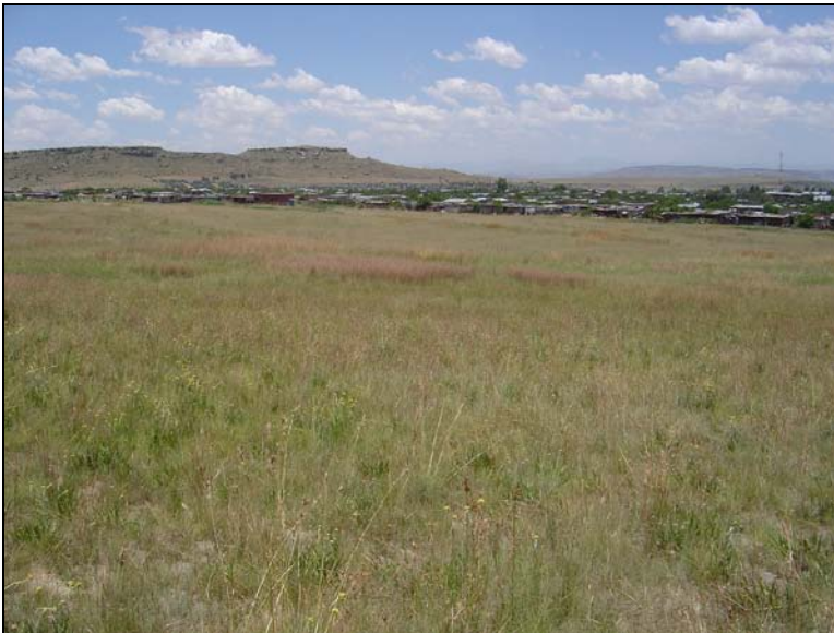
Fig.3 General view across the area of development.