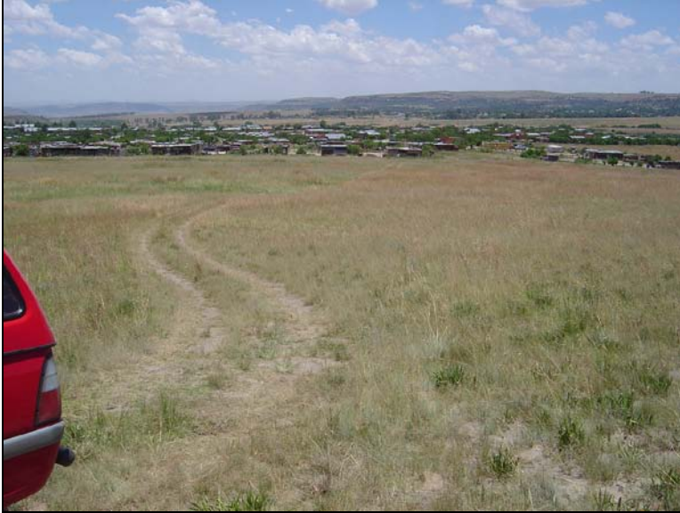
Fig.2 View from point B towards the existing township.