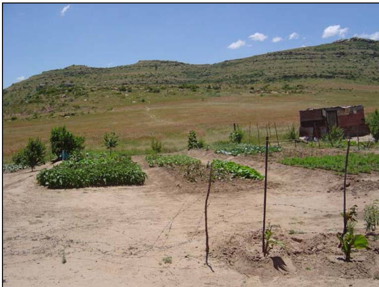
Fig.1 View from existing township at Manyatseng towards the hill.