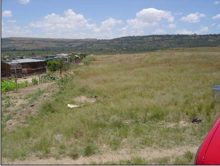
Fig.4 View along the line A-D.