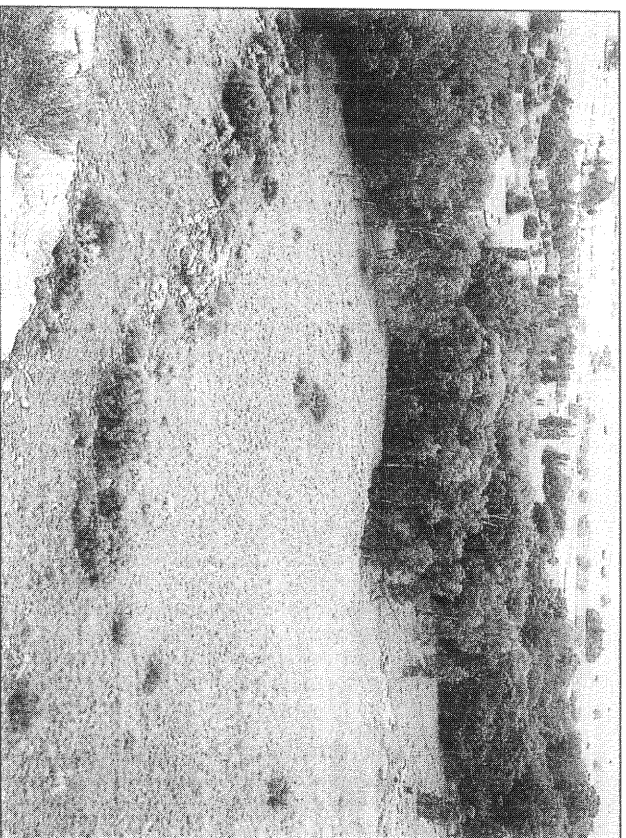
Fig.1 View from the highest point down across the area of proposed development.