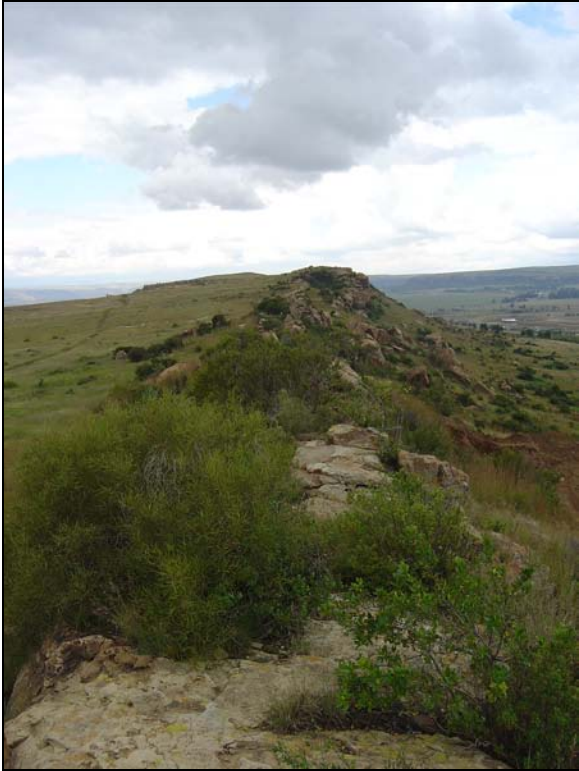
Fig.5 The dolerite ridge on the hill.