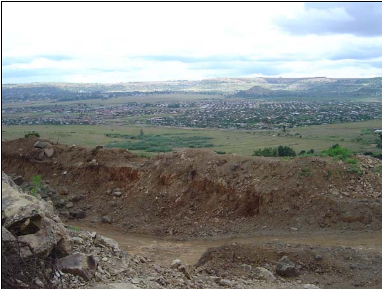
Fig.3 View from the quarry towards Ladybrand.