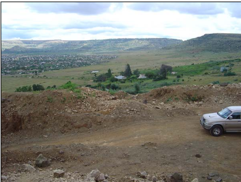
Fig.4 View from the quarry onto the Brightside farmhouse below.