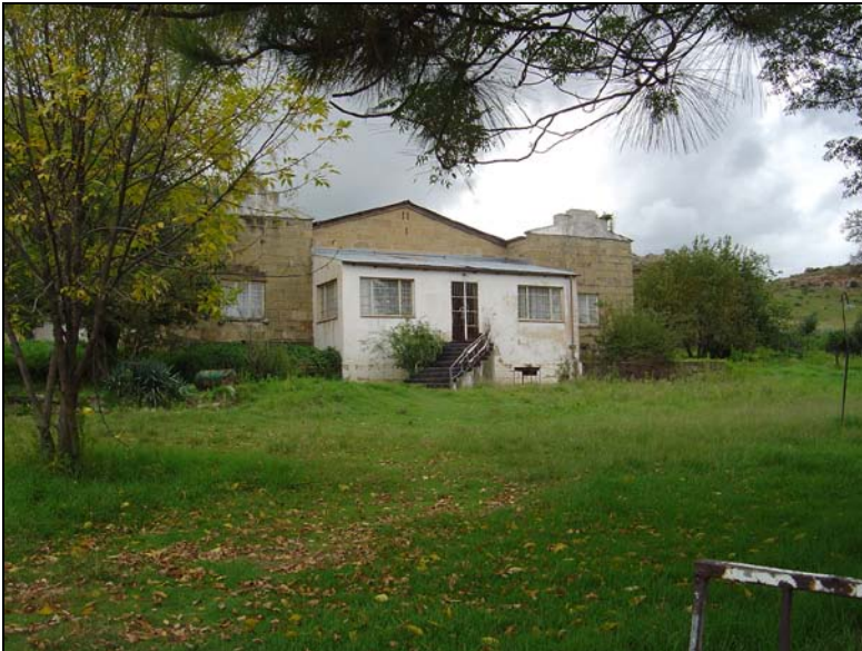
Fig.6 Old farm house at Brightside 338, Ladybrand.