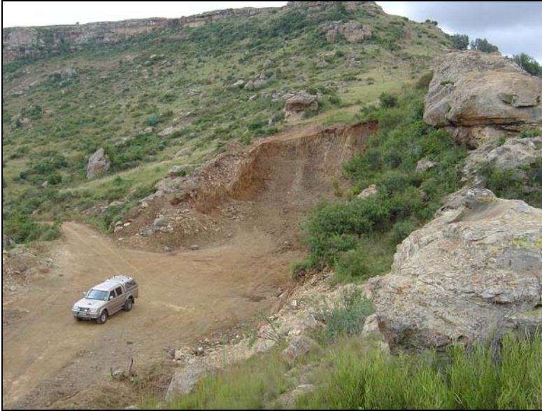
Fig.1 General view of the extensive quarry at Brightside 338, Ladybrand.