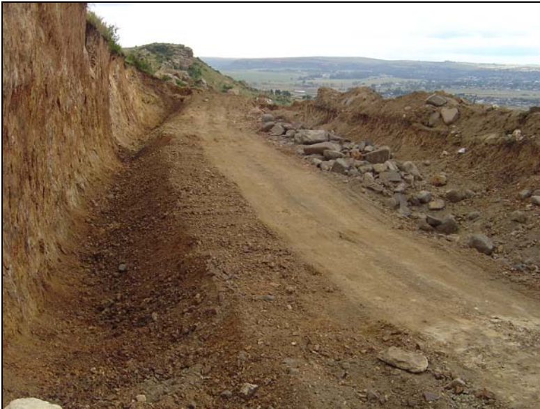
Fig.2 View of the inside of the quarry at Ladybrand.