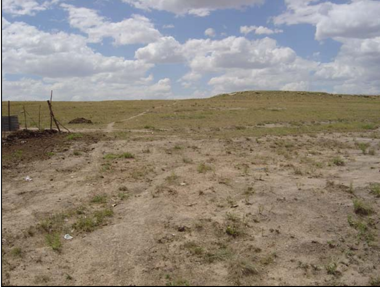
Fig.1 View across the area of development towards the hill.