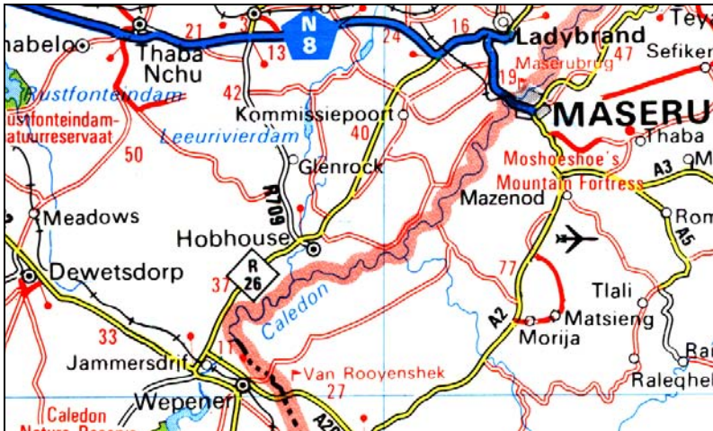
Map 1 Locality of Hobhouse in relation to Thaba Nchu, Dewetsdorp and Wepener.