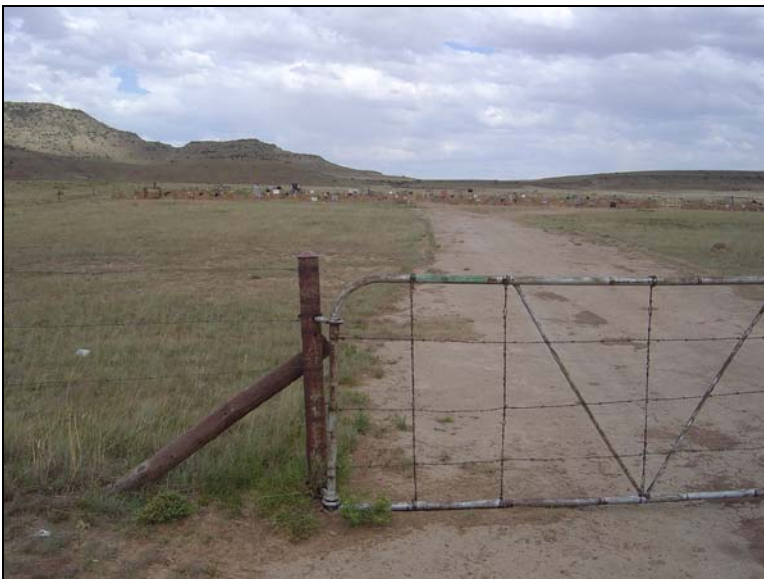
Fig.4 The graveyard at point C.