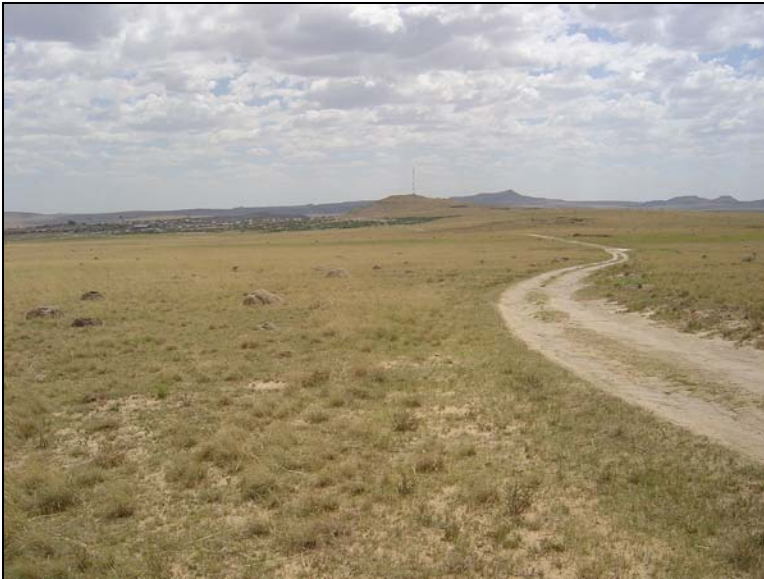
Fig.3 The area of development viewed from point D.