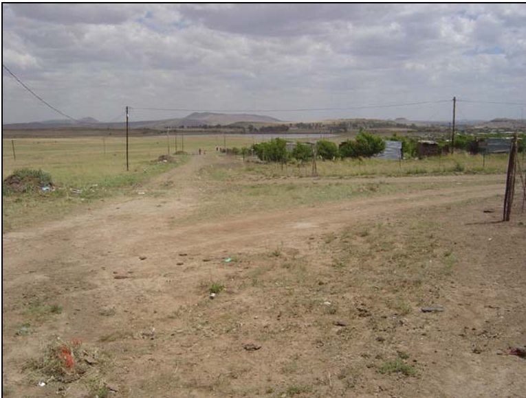
Fig.2 View from point B.