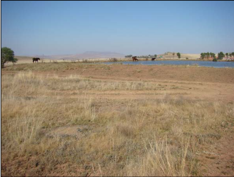
Fig.2 Existing sewer system at Hobhouse.