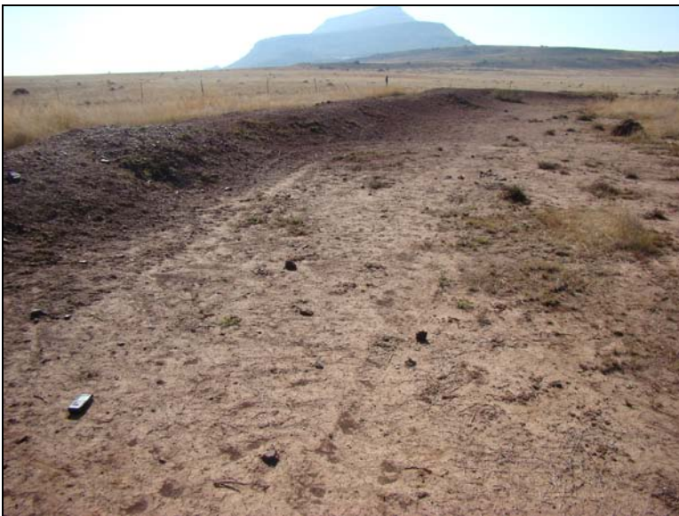
Fig.5 Locality for the new solid waste treatment system at Hobhouse.