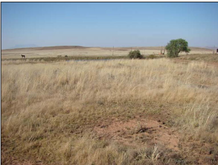
Fig.3 View across the proposed area of development adjacent to the existing oxidation pond system at Hobhouse.