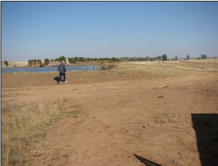
Fig.1 Point A facing existing oxidation pond system at Hobhouse.