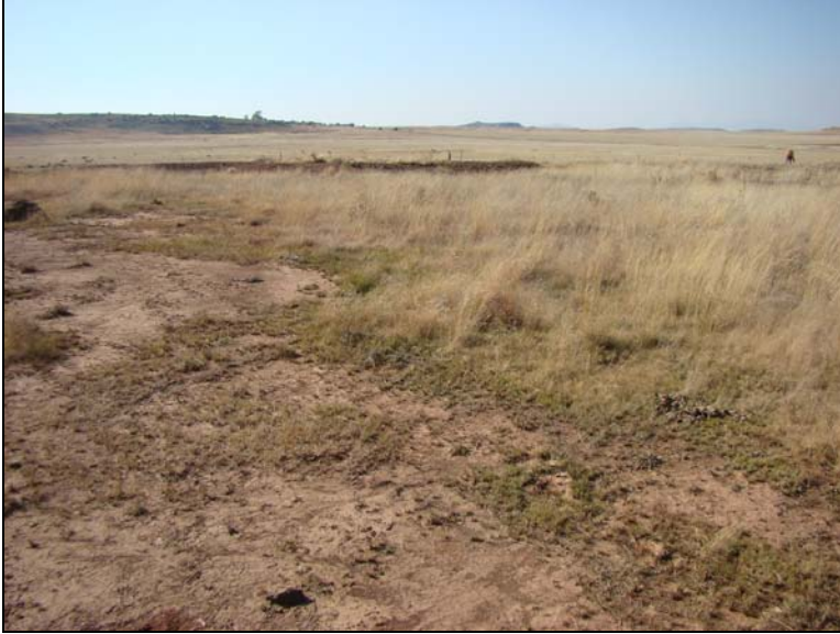
Fig.4 Area proposed for the new solid waste treatment plant at Hobhouse.