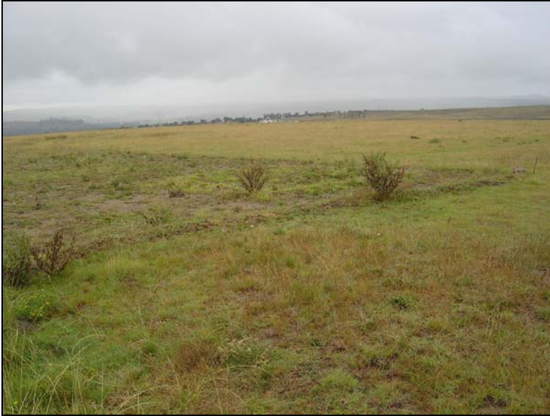
Fig.1 The proposed area of residential development on Brandhoek 20, Lindley.