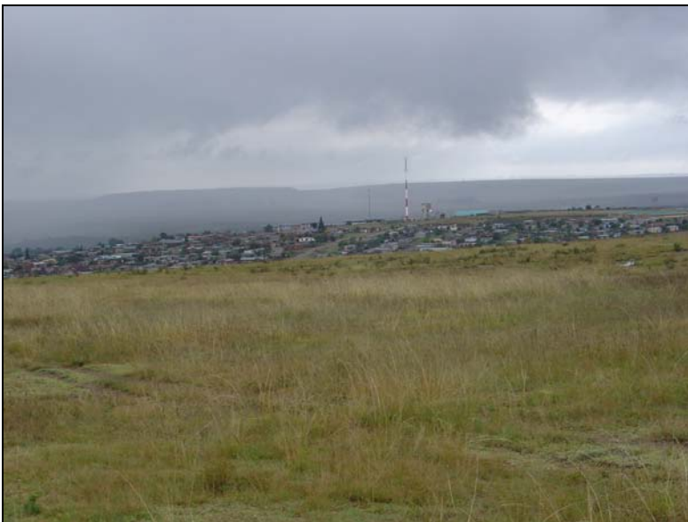
Fig.4 Area of development with Ntha outside Lindley in the background.