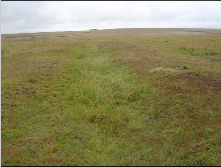
Fig.3 Old sewer pond.