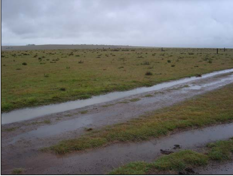
Fig.5 View across the area of development.