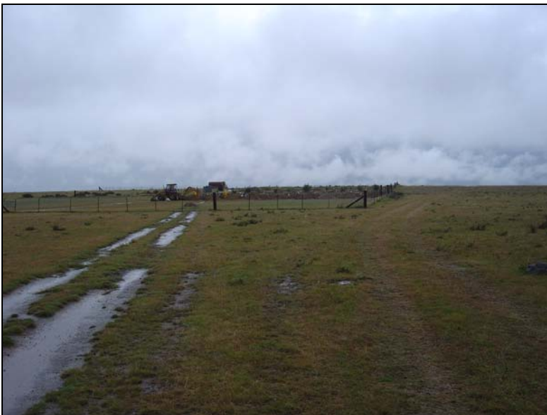
Fig.2 Graveyard at Brandhoek 20, Lindley.