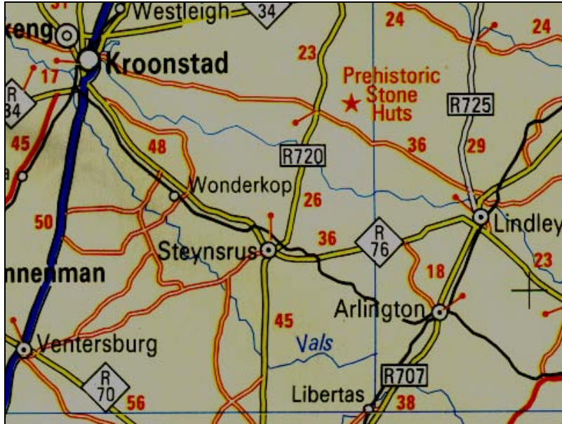
Map 1 Locality of Lindley in relation to Arlington, Kroonstad and Ventersburg.