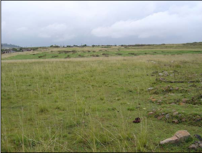
Fig.3 Old sewer ponds at Mamafubedu, Petrus Steyn.