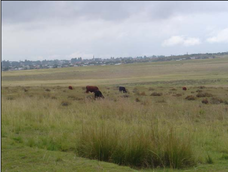
Fig.1 The proposed area of residential development on Vriendschap 772, Petrus Steyn.