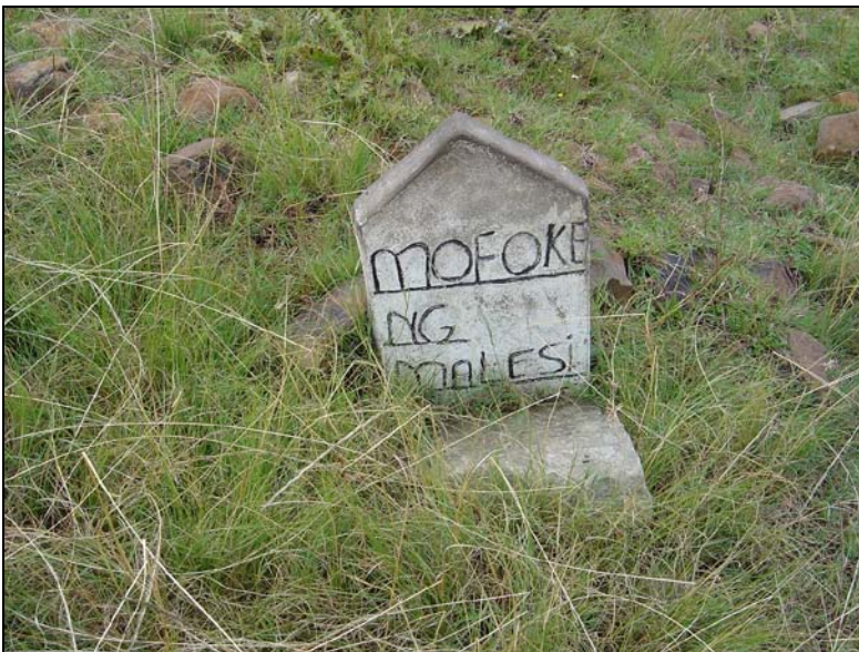
Fig.6 Example of an undated grave at Mamafubedu, Petrus Steyn.