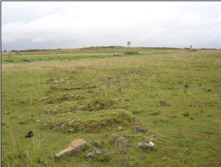
Fig.5 View of some of the graves at Mamafubedu, Petrus Steyn.