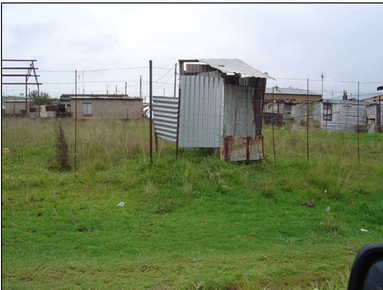
Fig.2 Existing township of Mamafubedu, Petrus Steyn.