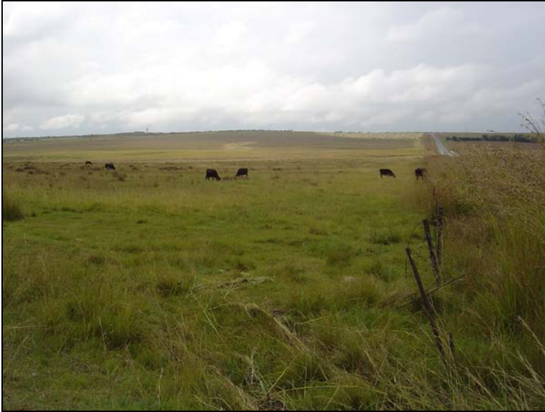
Fig.7 General view across the area of development at Mamafubedu, Petrus Steyn.