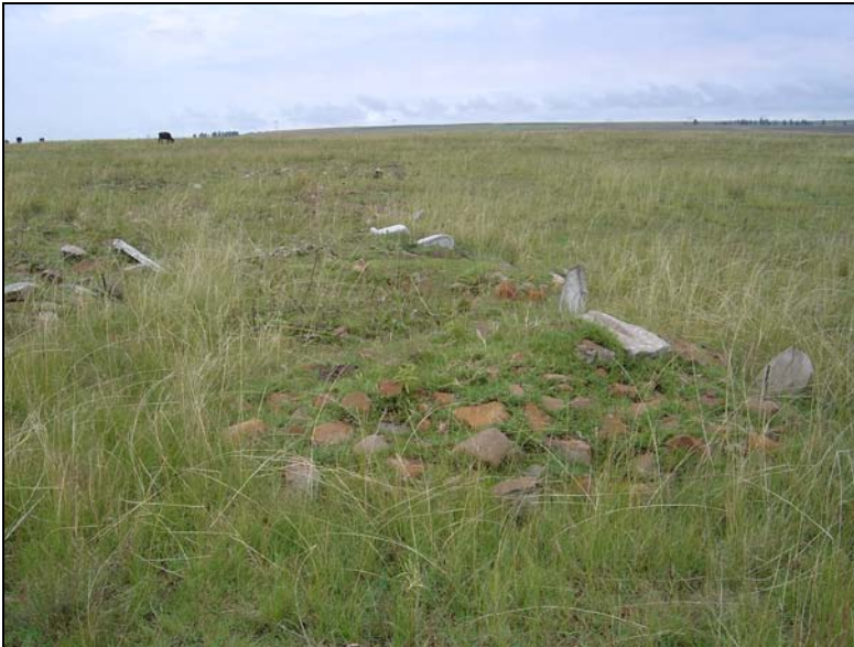
Fig.4 Graves at Mamafubedu, Petrus Steyn.